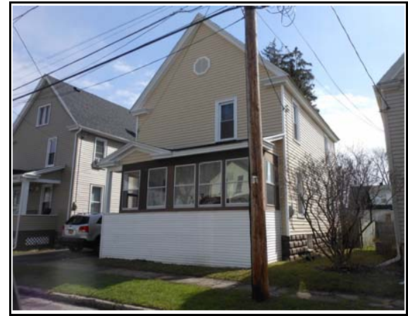
34 Columbia Ave 180200 84.043-1-31

Neighborhood: 300 Property Class: 210 - 1 Family Res Sale Date: 11/13/2023 Sale Price: $ 160,000 Prelim 2025 Land Asmt: $ 10,000 Prelim 2025 Asmt: $ 178,000 Building Style: Old Style Exterior Wall: Alum/vinyl Year Built: 1925 Basement Type: Full Grade: Average Condition: Normal SFLA: 1,798 Sale Price/SFLA: $ 88.99 Number Bedrooms: 6 Number Baths: 1.0