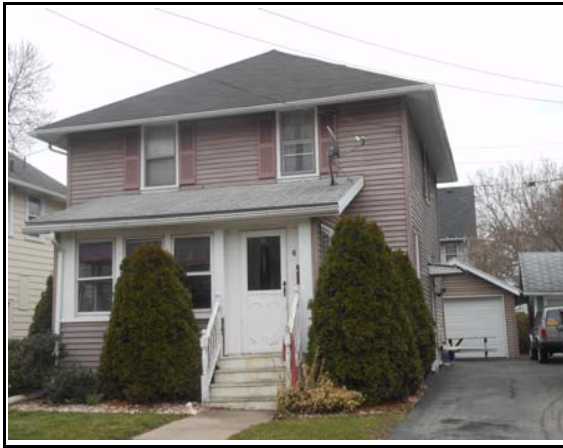
6 Union St 180200 84.031-1-38

Neighborhood: 300 Property Class: 210 - 1 Family Res Sale Date: 7/8/2024 Sale Price: $ 174,900 Prelim 2025 Land Asmt: $ 9,000 Prelim 2025 Asmt: $ 161,000 Building Style: Old Style Exterior Wall: Alum/vinyl Year Built: 1924 Basement Type: Full Grade: Average Condition: Normal SFLA: 1,248 Sale Price/SFLA: $ 140.14 Number Bedrooms: 3 Number Baths: 1.5