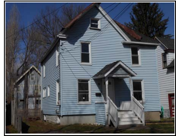
35 Manhattan Ave 180200 84.035-1-56

Neighborhood: 300 Property Class: 210 - 1 Family Res Sale Date: 4/26/2024 Sale Price: $ 165,000 Prelim 2025 Land Asmt: $ 9,500 Prelim 2025 Asmt: $ 146,000 Building Style: Old Style Exterior Wall: Alum/vinyl Year Built: 1900 Basement Type: Full Grade: Average Condition: Normal SFLA: 1,494 Sale Price/SFLA: $ 110.44 Number Bedrooms: 4 Number Baths: 1.0