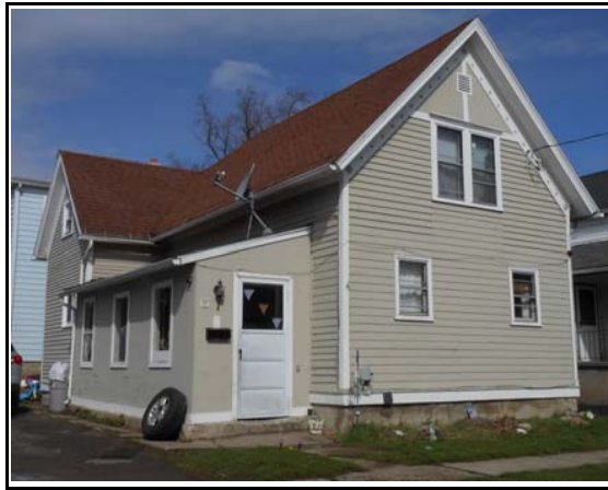
13 Columbia Ave 180200 84.043-1-38

Neighborhood: 300 Property Class: 210 - 1 Family Res Sale Date: 7/8/2024 Sale Price: $ 174,900 Prelim 2025 Land Asmt: $ 9,000 Prelim 2025 Asmt: $ 161,000 Building Style: Old Style Exterior Wall: Alum/vinyl Year Built: 1924 Basement Type: Full Grade: Average Condition: Normal SFLA: 1,248 Sale Price/SFLA: $ 140.14 Number Bedrooms: 3 Number Baths: 1.5