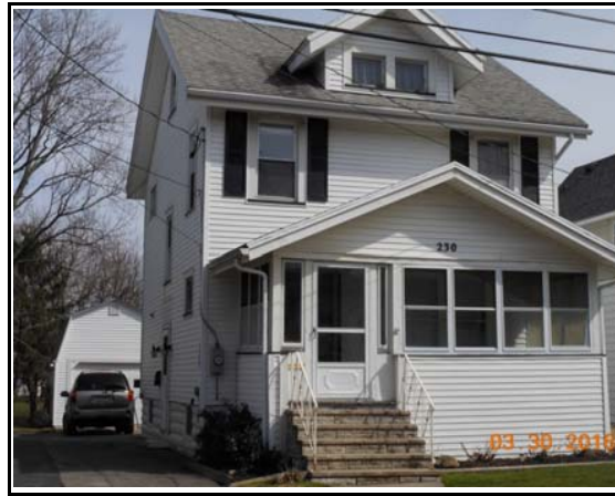
230 Bank St 180200 84.026-1-68

Neighborhood: 300 Property Class: 210 - 1 Family Res Sale Date: 3/22/2024 Sale Price: $ 120,000 Prelim 2025 Land Asmt: $ 9,000 Prelim 2025 Asmt: $ 135,000 Building Style: Old Style Exterior Wall: Alum/vinyl Year Built: 1925 Basement Type: Full Grade: Average Condition: Normal SFLA: 1,194 Sale Price/SFLA: $ 100.50 Number Bedrooms: 3 Number Baths: 1.0