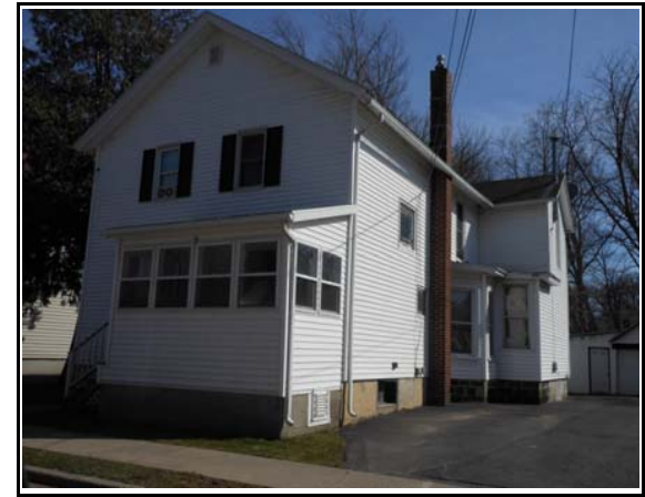
9 Watson St 180200 84.065-1-7

Neighborhood: 500 Property Class: 210 - 1 Family Res Sale Date: 9/6/2024 Sale Price: $ 50,000 Prelim 2025 Land Asmt: $ 16,300 Prelim 2025 Asmt: $ 180,500 Building Style: Old Style Exterior Wall: Alum/vinyl Year Built: 1878 Basement Type: Full Grade: Average Condition: Poor SFLA: 2,006 Sale Price/SFLA: $ 24.93 Number Bedrooms: 4 Number Baths: 2.0