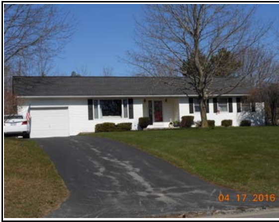
74 River St 180200 84.009-1-25

Neighborhood: 500 Property Class: 210 - 1 Family Res Sale Date: 8/15/2024 Sale Price: $ 225,000 Prelim 2025 Land Asmt: $ 17,600 Prelim 2025 Asmt: $ 205,000 Building Style: Ranch Exterior Wall: Alum/vinyl Year Built: 1987 Basement Type: Partial Grade: Average Condition: Normal SFLA: 1,728 Sale Price/SFLA: $ 130.21 Number Bedrooms: 3 Number Baths: 1.5