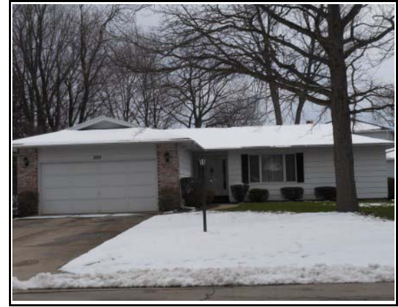
200 Naramore Dr 180200 85.005-1-37

Neighborhood: 100 Property Class: 210 - 1 Family Res Sale Date: 11/22/2024 Sale Price: $ 236,000 Prelim 2025 Land Asmt: $ 29,000 Prelim 2025 Asmt: $ 240,000 Building Style: Ranch Exterior Wall: Wood Year Built: 1970 Basement Type: Full Grade: Average Condition: Normal SFLA: 1,786 Sale Price/SFLA: $ 132.14 Number Bedrooms: 3 Number Baths: 3.0