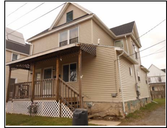
9-11 Mckinley Ave 180200 84.059-2-38

Neighborhood: 600 Property Class: 210 - 1 Family Res Sale Date: 7/28/2023 Sale Price: $ 90,000 Prelim 2025 Land Asmt: $ 9,900 Prelim 2025 Asmt: $ 91,000 Building Style: Old Style Exterior Wall: Alum/vinyl Year Built: 1890 Basement Type: Full Grade: Average Condition: Normal SFLA: 1,352 Sale Price/SFLA: $ 66.57 Number Bedrooms: 2 Number Baths: 1.0