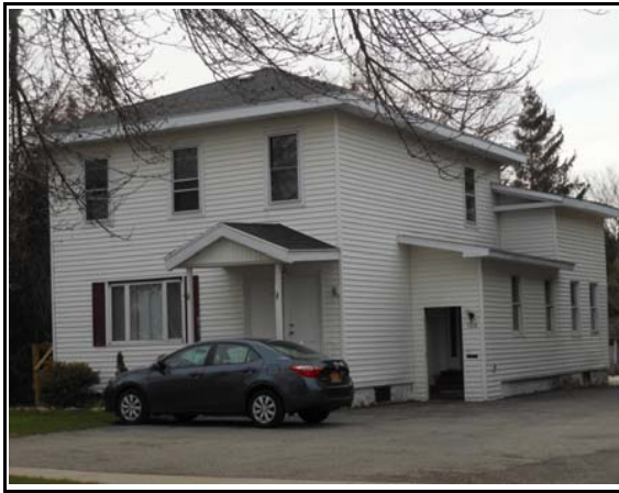
108 Jackson St 180200 84.057-1-35

Neighborhood: 500 Property Class: 210 - 1 Family Res Sale Date: 2/6/2023 Sale Price: $ 100,000 Prelim 2025 Land Asmt: $ 17,100 Prelim 2025 Asmt: $ 102,000 Building Style: Old Style Exterior Wall: Alum/vinyl Year Built: 1870 Basement Type: Partial Grade: Economy Condition: Poor SFLA: 2,569 Sale Price/SFLA: $ 38.93 Number Bedrooms: 5 Number Baths: 3.5