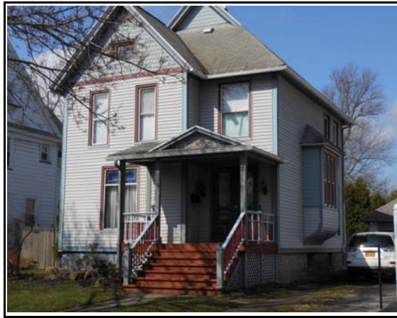
31 Tracy Ave 180200 84.034-1-69

Neighborhood: 300 Property Class: 210 - 1 Family Res Sale Date: 7/22/2024 Sale Price: $ 233,500 Prelim 2025 Land Asmt: $ 12,200 Prelim 2025 Asmt: $ 192,000 Building Style: Old Style Exterior Wall: Wood Year Built: 1954 Basement Type: Full Grade: Average Condition: Normal SFLA: 1,970 Sale Price/SFLA: $ 118.53 Number Bedrooms: 3 Number Baths: 1.5