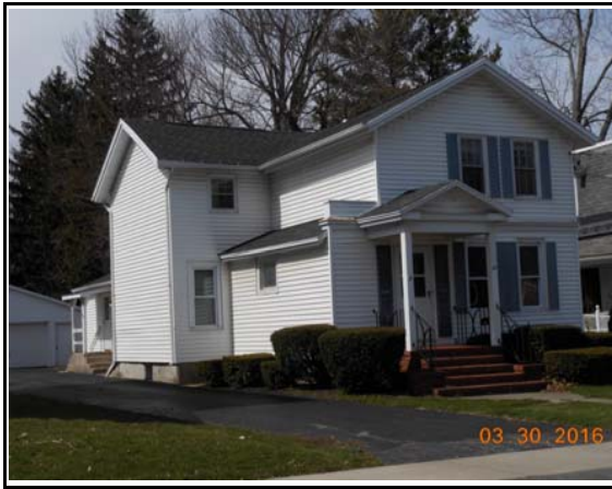
133 Bank St 180200 84.033-2-18

Neighborhood: 300 Property Class: 210 - 1 Family Res Sale Date: 1/20/2023 Sale Price: $ 125,000 Prelim 2025 Land Asmt: $ 16,200 Prelim 2025 Asmt: $ 152,000 Building Style: Old Style Exterior Wall: Alum/vinyl Year Built: 1900 Basement Type: Partial Grade: Average Condition: Fair SFLA: 2,502 Sale Price/SFLA: $ 49.96 Number Bedrooms: 4 Number Baths: 2.0