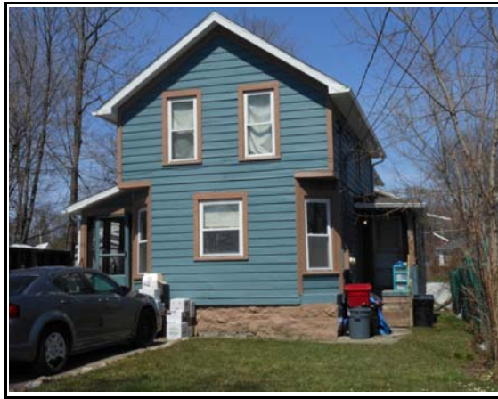
1 Cone St 180200 84.073-1-18

Neighborhood: 500 Property Class: 210 - 1 Family Res Sale Date: 8/22/2023 Sale Price: $ 173,000 Prelim 2025 Land Asmt: $ 15,300 Prelim 2025 Asmt: $ 197,000 Building Style: Old Style Exterior Wall: Wood Year Built: 1918 Basement Type: Full Grade: Average Condition: Fair SFLA: 1,500 Sale Price/SFLA: $ 115.33 Number Bedrooms: 4 Number Baths: 1.0