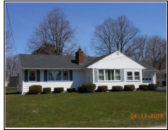
17 Northern Blvd 180200 71.020-1-55

Neighborhood: 200 Property Class: 210 - 1 Family Res Sale Date: 9/30/2024 Sale Price: $ 230,000 Prelim 2025 Land Asmt: $ 16,800 Prelim 2025 Asmt: $ 214,000 Building Style: Ranch Exterior Wall: Alum/vinyl Year Built: 1955 Basement Type: Slab/pier Grade: Average Condition: Normal SFLA: 1,402 Sale Price/SFLA: $ 164.05 Number Bedrooms: 3 Number Baths: 1.0