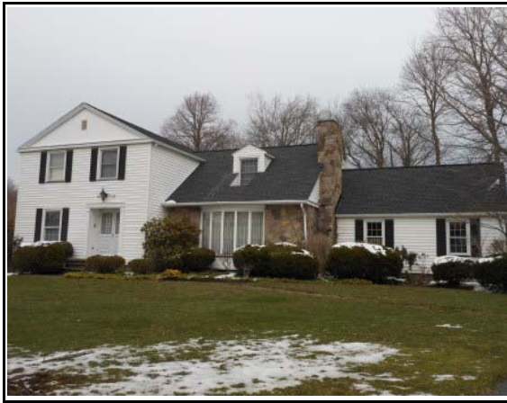
13 Woodcrest Dr 180200 84.012-2-12

Neighborhood: 100 Property Class: 210 - 1 Family Res Sale Date: 7/11/2024 Sale Price: $ 331,500 Prelim 2025 Land Asmt: $ 33,500 Prelim 2025 Asmt: $ 356,000 Building Style: Colonial Exterior Wall: Alum/vinyl Year Built: 1968 Basement Type: Full Grade: Average Condition: Normal SFLA: 3,058 Sale Price/SFLA: $ 108.40 Number Bedrooms: 5 Number Baths: 3.0