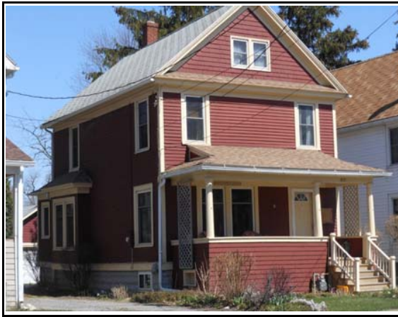
62 Pearl St 180200 84.047-2-56

Neighborhood: 500 Property Class: 210 - 1 Family Res Sale Date: 10/23/2024 Sale Price: $ 174,500 Prelim 2025 Land Asmt: $ 8,800 Prelim 2025 Asmt: $ 177,000 Building Style: Old Style Exterior Wall: Wood Year Built: 1910 Basement Type: Full Grade: Average Condition: Normal SFLA: 1,302 Sale Price/SFLA: $ 134.02 Number Bedrooms: 3 Number Baths: 1.0