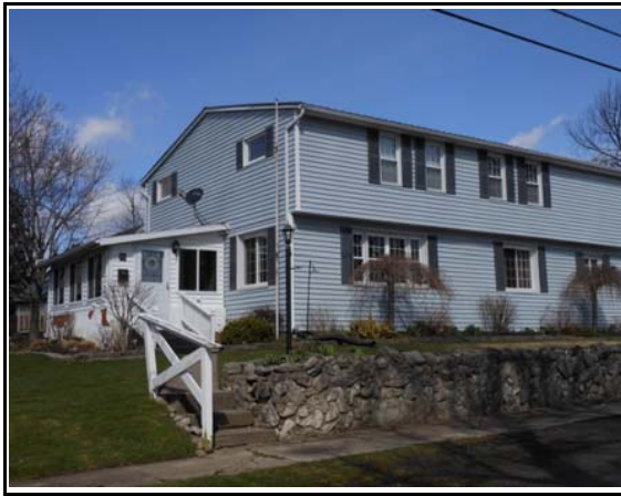
63 Manhattan Ave 180200 84.035-1-3

Neighborhood: 200 Property Class: 210 - 1 Family Res Sale Date: 5/16/2023 Sale Price: $ 225,000 Prelim 2025 Land Asmt: $ 15,900 Prelim 2025 Asmt: $ 251,000 Building Style: Colonial Exterior Wall: Alum/vinyl Year Built: 1950 Basement Type: Full Grade: Average Condition: Normal SFLA: 2,508 Sale Price/SFLA: $ 89.71 Number Bedrooms: 5 Number Baths: 2.0