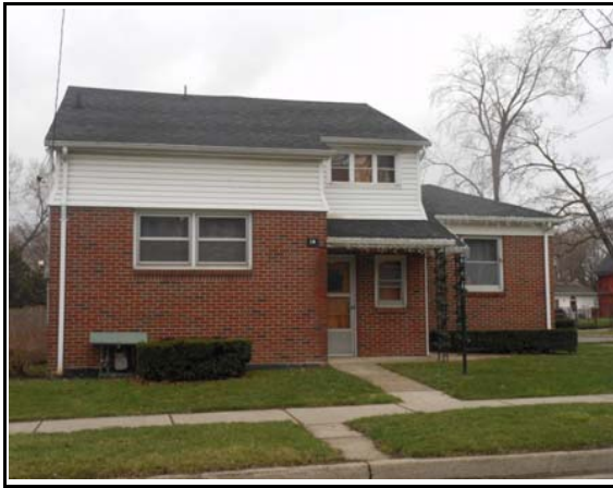
14 Washington Ave 180200 84.040-2-1

Neighborhood: 300 Property Class: 210 - 1 Family Res Sale Date: 7/22/2024 Sale Price: $ 233,500 Prelim 2025 Land Asmt: $ 12,200 Prelim 2025 Asmt: $ 192,000 Building Style: Old Style Exterior Wall: Wood Year Built: 1954 Basement Type: Full Grade: Average Condition: Normal SFLA: 1,970 Sale Price/SFLA: $ 118.53 Number Bedrooms: 3 Number Baths: 1.5