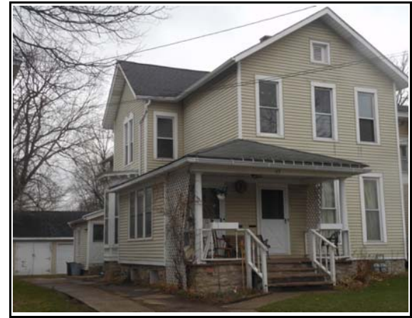
117 State St 180200 84.007-1-18

Neighborhood: 700 Property Class: 220 - 2 Family Res Sale Date: 9/12/2023 Sale Price: $ 90,000 Prelim 2025 Land Asmt: $ 12,600 Prelim 2025 Asmt: $ 108,000 Building Style: Old Style Exterior Wall: Alum/vinyl Year Built: 1900 Basement Type: Full Grade: Average Condition: Poor SFLA: 2,258 Sale Price/SFLA: $ 39.86 Number Bedrooms: 4 Number Baths: 2.0