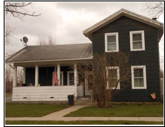
100 Harvester Ave 180200 84.016-1-43

Neighborhood: 600 Property Class: 210 - 1 Family Res Sale Date: 11/6/2024 Sale Price: $ 37,000 Prelim 2025 Land Asmt: $ 6,400 Prelim 2025 Asmt: $ 62,000 Building Style: Old Style Exterior Wall: Composition Year Built: 1900 Basement Type: Full Grade: Average Condition: Poor SFLA: 1,636 Sale Price/SFLA: $ 22.62 Number Bedrooms: 3 Number Baths: 1.0