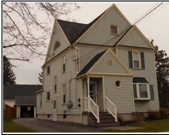
5-7 Otis St 180200 84.020-2-85

Neighborhood: 500 Property Class: 210 - 1 Family Res Sale Date: 12/18/2023 Sale Price: $ 130,000 Prelim 2025 Land Asmt: $ 15,000 Prelim 2025 Asmt: $ 146,000 Building Style: Old Style Exterior Wall: Alum/vinyl Year Built: 1900 Basement Type: Full Grade: Average Condition: Normal SFLA: 1,760 Sale Price/SFLA: $ 73.86 Number Bedrooms: 3 Number Baths: 2.0