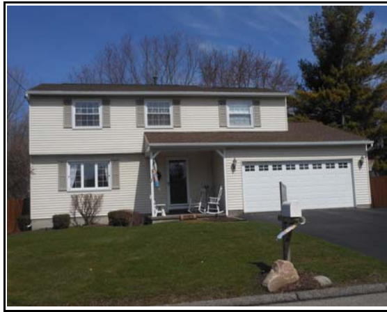
5 Burke Dr 180200 71.018-2-18

Neighborhood: 200 Property Class: 210 - 1 Family Res Sale Date: 8/21/2024 Sale Price: $ 325,888 Prelim 2025 Land Asmt: $ 17,400 Prelim 2025 Asmt: $ 334,000 Building Style: Cape Cod Exterior Wall: Brick Year Built: 1958 Basement Type: Full Grade: Average Condition: Normal SFLA: 3,696 Sale Price/SFLA: $ 88.17 Number Bedrooms: 5 Number Baths: 3.0