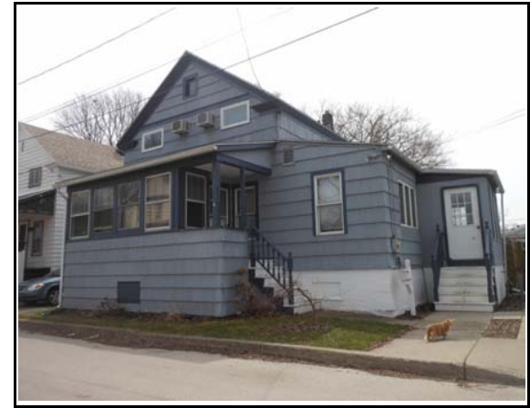
6 Hall St 180200 84.066-2-26

Neighborhood: 600 Property Class: 220 - 2 Family Res Sale Date: 12/27/2023 Sale Price: $ 65,000 Prelim 2025 Land Asmt: $ 10,700 Prelim 2025 Asmt: $ 59,000 Building Style: Old Style Exterior Wall: Wood Year Built: 1900 Basement Type: Partial Grade: Average Condition: Fair SFLA: 1,240 Sale Price/SFLA: $ 52.42 Number Bedrooms: 2 Number Baths: 2.0