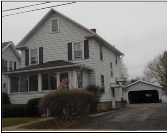
20 Woodrow Rd 180200 84.022-1-30

Neighborhood: 400 Property Class: 210 - 1 Family Res Sale Date: 12/10/2024 Sale Price: $ 190,000 Prelim 2025 Land Asmt: $ 47,000 Prelim 2025 Asmt: $ 156,000 Building Style: Old Style Exterior Wall: Alum/vinyl Year Built: 1928 Basement Type: Full Grade: Average Condition: Normal SFLA: 1,528 Sale Price/SFLA: $ 124.35 Number Bedrooms: 3 Number Baths: 2.0