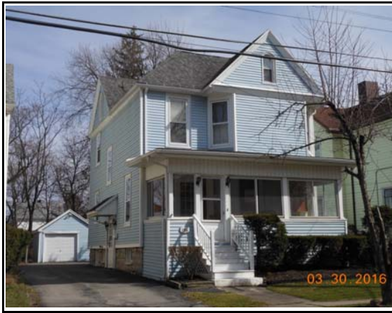
156 Bank St 180200 84.034-1-86

Neighborhood: 300 Property Class: 210 - 1 Family Res Sale Date: 5/14/2024 Sale Price: $ 157,500 Prelim 2025 Land Asmt: $ 11,000 Prelim 2025 Asmt: $ 151,000 Building Style: Old Style Exterior Wall: Alum/vinyl Year Built: 1890 Basement Type: Full Grade: Average Condition: Normal SFLA: 1,596 Sale Price/SFLA: $ 98.68 Number Bedrooms: 3 Number Baths: 1.5