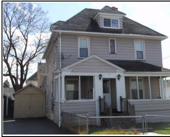
2 Manhattan Ave 180200 84.043-1-65

Neighborhood: 300 Property Class: 220 - 2 Family Res Sale Date: 3/15/2023 Sale Price: $ 97,000 Prelim 2025 Land Asmt: $ 9,500 Prelim 2025 Asmt: $ 109,000 Building Style: Old Style Exterior Wall: Alum/vinyl Year Built: 1900 Basement Type: Full Grade: Average Condition: Fair SFLA: 1,646 Sale Price/SFLA: $ 58.93 Number Bedrooms: 4 Number Baths: 2.0