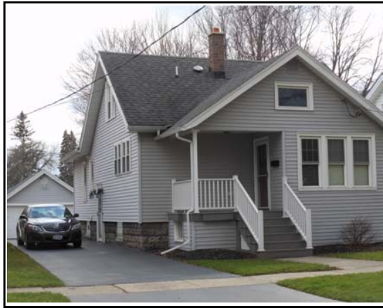
116 East Ave 180200 84.043-3-27

Neighborhood: 700 Property Class: 210 - 1 Family Res Sale Date: 10/29/2024 Sale Price: $ 165,000 Prelim 2025 Land Asmt: $ 10,600 Prelim 2025 Asmt: $ 134,000 Building Style: Old Style Exterior Wall: Alum/vinyl Year Built: 1910 Basement Type: Full Grade: Average Condition: Normal SFLA: 1,404 Sale Price/SFLA: $ 117.52 Number Bedrooms: 3 Number Baths: 1.0