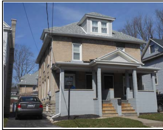
25 Montclair Ave 180200 84.031-2-10

Neighborhood: 300 Property Class: 220 - 2 Family Res Sale Date: 9/7/2023 Sale Price: $ 90,000 Prelim 2025 Land Asmt: $ 8,300 Prelim 2025 Asmt: $ 116,000 Building Style: Old Style Exterior Wall: Wood Year Built: 1890 Basement Type: Full Grade: Average Condition: Poor SFLA: 1,986 Sale Price/SFLA: $ 45.32 Number Bedrooms: 5 Number Baths: 2.0