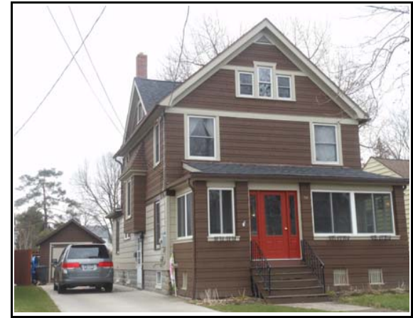
54 Vernon Ave 180200 84.006-3-71

Neighborhood: 200 Property Class: 210 - 1 Family Res Sale Date: 4/9/2024 Sale Price: $ 210,000 Prelim 2025 Land Asmt: $ 17,500 Prelim 2025 Asmt: $ 184,000 Building Style: Old Style Exterior Wall: Alum/vinyl Year Built: 1927 Basement Type: Full Grade: Average Condition: Normal SFLA: 1,568 Sale Price/SFLA: $ 133.93 Number Bedrooms: 2 Number Baths: 1.0