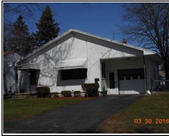
10 Douglas St 180200 71.082-1-57

Neighborhood: 200 Property Class: 210 - 1 Family Res Sale Date: 6/8/2023 Sale Price: $ 182,500 Prelim 2025 Land Asmt: $ 20,100 Prelim 2025 Asmt: $ 200,000 Building Style: Ranch Exterior Wall: Alum/vinyl Year Built: 1951 Basement Type: Full Grade: Average Condition: Good SFLA: 932 Sale Price/SFLA: $ 195.82 Number Bedrooms: 2 Number Baths: 1.5