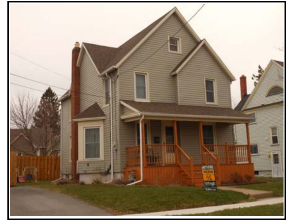
3 Otis St 180200 84.020-2-86

Neighborhood: 500 Property Class: 220 - 2 Family Res Sale Date: 11/15/2024 Sale Price: $ 115,000 Prelim 2025 Land Asmt: $ 16,000 Prelim 2025 Asmt: $ 105,000 Building Style: Old Style Exterior Wall: Wood Year Built: 1900 Basement Type: Full Grade: Average Condition: Normal SFLA: 1,402 Sale Price/SFLA: $ 82.03 Number Bedrooms: 3 Number Baths: 2.0