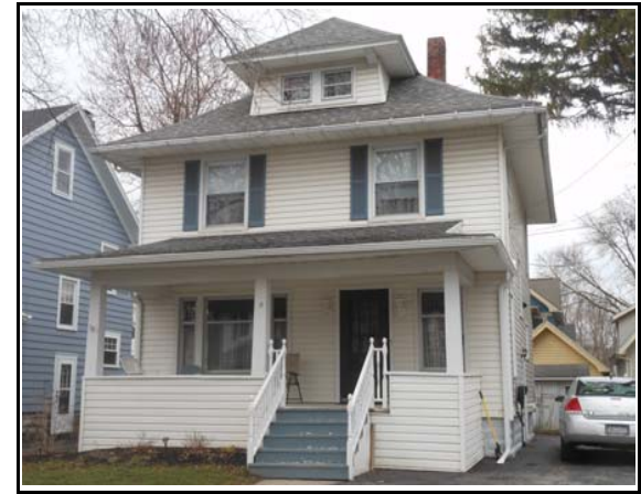
11 Kingsbury Ave 180200 84.031-1-27

Neighborhood: 200 Property Class: 210 - 1 Family Res Sale Date: 10/6/2023 Sale Price: $ 151,000 Prelim 2025 Land Asmt: $ 11,000 Prelim 2025 Asmt: $ 156,000 Building Style: Old Style Exterior Wall: Wood Year Built: 1932 Basement Type: Full Grade: Average Condition: Normal SFLA: 1,464 Sale Price/SFLA: $ 103.14 Number Bedrooms: 4 Number Baths: 1.0