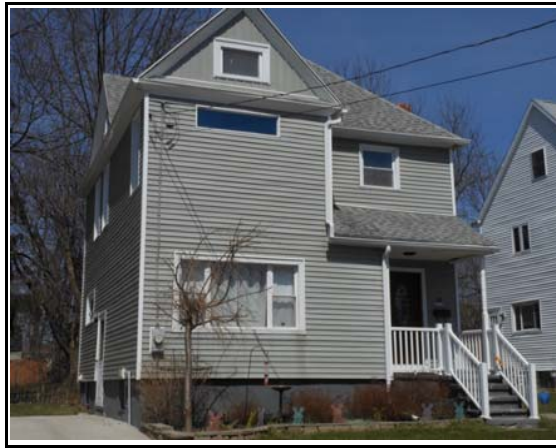
14 Morton Ave 180200 84.015-2-27

Neighborhood: 500 Property Class: 210 - 1 Family Res Sale Date: 10/23/2024 Sale Price: $ 174,500 Prelim 2025 Land Asmt: $ 8,800 Prelim 2025 Asmt: $ 177,000 Building Style: Old Style Exterior Wall: Wood Year Built: 1910 Basement Type: Full Grade: Average Condition: Normal SFLA: 1,302 Sale Price/SFLA: $ 134.02 Number Bedrooms: 3 Number Baths: 1.0