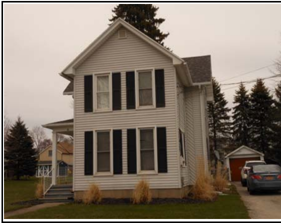
33-35 Otis St 180200 84.020-2-73

Neighborhood: 500 Property Class: 210 - 1 Family Res Sale Date: 1/12/2024 Sale Price: $ 169,000 Prelim 2025 Land Asmt: $ 17,000 Prelim 2025 Asmt: $ 163,000 Building Style: Old Style Exterior Wall: Alum/vinyl Year Built: 1890 Basement Type: Full Grade: Average Condition: Normal SFLA: 1,204 Sale Price/SFLA: $ 140.37 Number Bedrooms: 2 Number Baths: 1.5