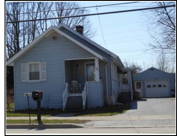
143 Pearl St 180200 84.013-1-17

Neighborhood: 500 Property Class: 210 - 1 Family Res Sale Date: 6/27/2024 Sale Price: $ 20,000 Prelim 2025 Land Asmt: $ 7,900 Prelim 2025 Asmt: $ 25,000 Building Style: Old Style Exterior Wall: Alum/vinyl Year Built: 1920 Basement Type: Crawl Grade: Economy Condition: Poor SFLA: 862 Sale Price/SFLA: $ 23.20 Number Bedrooms: 2 Number Baths: 2.0