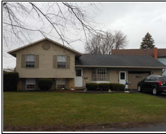
447 South Jackson St 180200 84.019-3-45

Neighborhood: 500 Property Class: 210 - 1 Family Res Sale Date: 8/15/2024 Sale Price: $ 225,000 Prelim 2025 Land Asmt: $ 17,600 Prelim 2025 Asmt: $ 205,000 Building Style: Ranch Exterior Wall: Alum/vinyl Year Built: 1987 Basement Type: Partial Grade: Average Condition: Normal SFLA: 1,728 Sale Price/SFLA: $ 130.21 Number Bedrooms: 3 Number Baths: 1.5