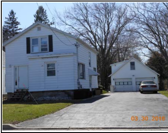
6 Denio St 180200 71.082-1-3.1

Neighborhood: 300 Property Class: 210 - 1 Family Res Sale Date: 7/6/2023 Sale Price: $ 169,000 Prelim 2025 Land Asmt: $ 13,500 Prelim 2025 Asmt: $ 190,000 Building Style: Old Style Exterior Wall: Alum/vinyl Year Built: 1880 Basement Type: Full Grade: Average Condition: Normal SFLA: 1,155 Sale Price/SFLA: $ 146.32 Number Bedrooms: 3 Number Baths: 1.0