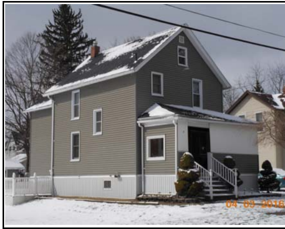
12 Chase Park 180200 84.051-1-25

Neighborhood: 700 Property Class: 210 - 1 Family Res Sale Date: 5/6/2024 Sale Price: $ 60,000 Prelim 2025 Land Asmt: $ 7,300 Prelim 2025 Asmt: $ 72,000 Building Style: Old Style Exterior Wall: Alum/vinyl Year Built: 1900 Basement Type: Full Grade: Average Condition: Poor SFLA: 1,192 Sale Price/SFLA: $ 50.34 Number Bedrooms: 3 Number Baths: 1.0