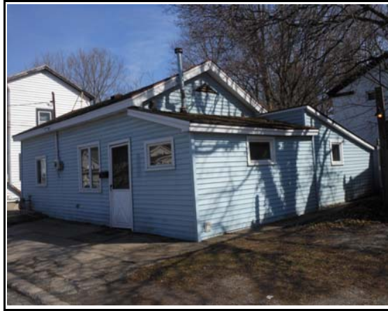
109 Watson St 180200 84.065-1-2

Neighborhood: 500 Property Class: 210 - 1 Family Res Sale Date: 11/21/2023 Sale Price: $ 20,000 Prelim 2025 Land Asmt: $ 7,900 Prelim 2025 Asmt: $ 25,000 Building Style: Old Style Exterior Wall: Alum/vinyl Year Built: 1920 Basement Type: Crawl Grade: Economy Condition: Poor SFLA: 862 Sale Price/SFLA: $ 23.20 Number Bedrooms: 2 Number Baths: 2.0