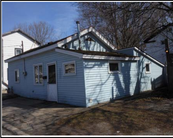
109 Watson St 180200 84.065-1-2

Neighborhood: 500 Property Class: 210 - 1 Family Res Sale Date: 11/21/2023 Sale Price: $ 20,000 Prelim 2025 Land Asmt: $ 7,900 Prelim 2025 Asmt: $ 25,000 Building Style: Old Style Exterior Wall: Alum/vinyl Year Built: 1920 Basement Type: Crawl Grade: Economy Condition: Poor SFLA: 862 Sale Price/SFLA: $ 23.20 Number Bedrooms: 2 Number Baths: 2.0