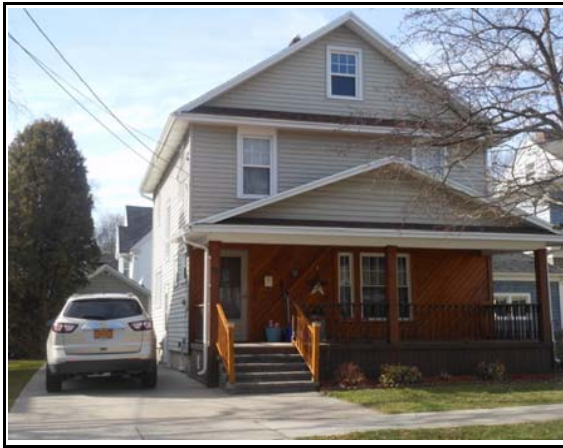
21 Lewis Ave 180200 84.032-2-9

Neighborhood: 200 Property Class: 210 - 1 Family Res Sale Date: 3/8/2024 Sale Price: $ 150,000 Prelim 2025 Land Asmt: $ 12,300 Prelim 2025 Asmt: $ 165,000 Building Style: Old Style Exterior Wall: Alum/vinyl Year Built: 1900 Basement Type: Full Grade: Average Condition: Normal SFLA: 1,392 Sale Price/SFLA: $ 107.76 Number Bedrooms: 3 Number Baths: 1.5