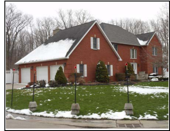
383 Garden Dr 180200 72.017-3-5

Neighborhood: 100 Property Class: 210 - 1 Family Res Sale Date: 8/25/2023 Sale Price: $ 300,000 Prelim 2025 Land Asmt: $ 32,800 Prelim 2025 Asmt: $ 331,000 Building Style: Colonial Exterior Wall: Wood Year Built: 1971 Basement Type: Full Grade: Average Condition: Normal SFLA: 2,280 Sale Price/SFLA: $ 131.58 Number Bedrooms: 4 Number Baths: 2.5