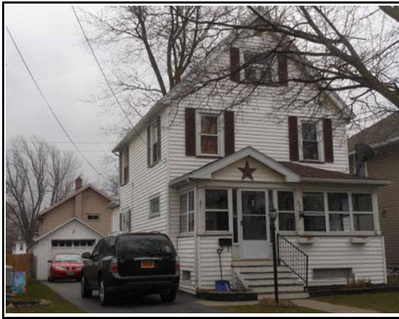
52 Union St 180200 84.023-1-11

Neighborhood: 300 Property Class: 210 - 1 Family Res Sale Date: 10/23/2023 Sale Price: $ 165,000 Prelim 2025 Land Asmt: $ 9,000 Prelim 2025 Asmt: $ 178,000 Building Style: Old Style Exterior Wall: Alum/vinyl Year Built: 1930 Basement Type: Full Grade: Average Condition: Normal SFLA: 1,276 Sale Price/SFLA: $ 129.31 Number Bedrooms: 3 Number Baths: 1.5