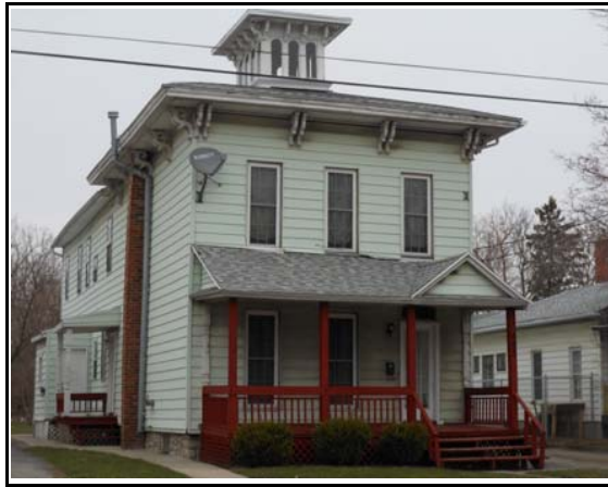
403 Ellicott St 180200 84.015-3-21