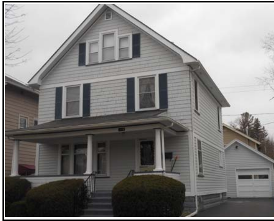
41 Kingsbury Ave 180200 84.023-1-21

Neighborhood: 200 Property Class: 210 - 1 Family Res Sale Date: 3/8/2024 Sale Price: $ 150,000 Prelim 2025 Land Asmt: $ 12,300 Prelim 2025 Asmt: $ 165,000 Building Style: Old Style Exterior Wall: Alum/vinyl Year Built: 1900 Basement Type: Full Grade: Average Condition: Normal SFLA: 1,392 Sale Price/SFLA: $ 107.76 Number Bedrooms: 3 Number Baths: 1.5