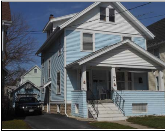
53 Montclair Ave 180200 84.024-1-51

Neighborhood: 300 Property Class: 210 - 1 Family Res Sale Date: 4/21/2023 Sale Price: $ 120,000 Prelim 2025 Land Asmt: $ 8,800 Prelim 2025 Asmt: $ 135,000 Building Style: Old Style Exterior Wall: Wood Year Built: 1920 Basement Type: Full Grade: Average Condition: Normal SFLA: 1,232 Sale Price/SFLA: $ 97.40 Number Bedrooms: 3 Number Baths: 1.0