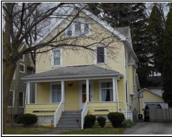
162 Ross St 180200 84.035-1-73

Neighborhood: 300 Property Class: 210 - 1 Family Res Sale Date: 7/2/2024 Sale Price: $ 86,100 Prelim 2025 Land Asmt: $ 9,500 Prelim 2025 Asmt: $ 136,000 Building Style: Old Style Exterior Wall: Wood Year Built: 1900 Basement Type: Full Grade: Average Condition: Poor SFLA: 1,547 Sale Price/SFLA: $ 55.66 Number Bedrooms: 4 Number Baths: 1.5