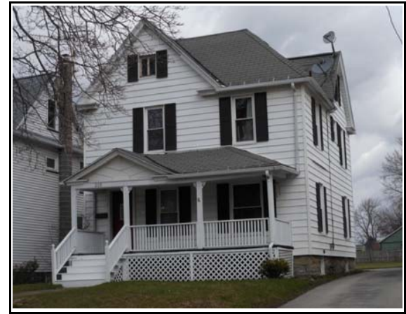
215 North St 180200 84.034-3-61

Neighborhood: 300 Property Class: 210 - 1 Family Res Sale Date: 9/13/2024 Sale Price: $ 169,000 Prelim 2025 Land Asmt: $ 9,500 Prelim 2025 Asmt: $ 124,000 Building Style: Old Style Exterior Wall: Alum/vinyl Year Built: 1900 Basement Type: Full Grade: Average Condition: Normal SFLA: 1,344 Sale Price/SFLA: $ 125.74 Number Bedrooms: 4 Number Baths: 1.0