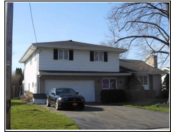
64 Roosevelt Ave 180200 84.009-2-38

Neighborhood: 500 Property Class: 210 - 1 Family Res Sale Date: 9/23/2024 Sale Price: $ 190,000 Prelim 2025 Land Asmt: $ 13,600 Prelim 2025 Asmt: $ 172,000 Building Style: Split Level Exterior Wall: Alum/vinyl Year Built: 1972 Basement Type: Partial Grade: Average Condition: Normal SFLA: 1,214 Sale Price/SFLA: $ 156.51 Number Bedrooms: 3 Number Baths: 1.5