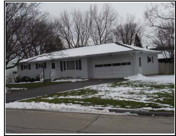
2 Fordham Dr 180200 84.012-3-18

Neighborhood: 200 Property Class: 210 - 1 Family Res Sale Date: 7/8/2024 Sale Price: $ 167,750 Prelim 2025 Land Asmt: $ 15,200 Prelim 2025 Asmt: $ 174,000 Building Style: Ranch Exterior Wall: Alum/vinyl Year Built: 1920 Basement Type: Full Grade: Average Condition: Normal SFLA: 1,088 Sale Price/SFLA: $ 154.18 Number Bedrooms: 3 Number Baths: 1.0