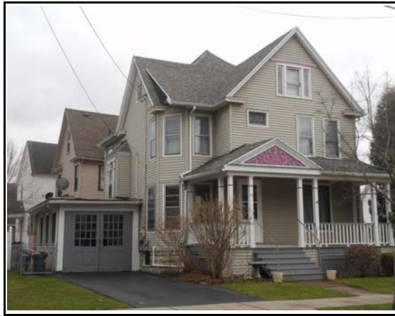
22 Washington Ave 180200 84.040-2-4

Neighborhood: 300 Property Class: 210 - 1 Family Res Sale Date: 2/8/2024 Sale Price: $ 60,000 Prelim 2025 Land Asmt: $ 9,300 Prelim 2025 Asmt: $ 113,000 Building Style: Old Style Exterior Wall: Wood Year Built: 1890 Basement Type: Full Grade: Average Condition: Normal SFLA: 1,776 Sale Price/SFLA: $ 33.78 Number Bedrooms: 4 Number Baths: 1.0