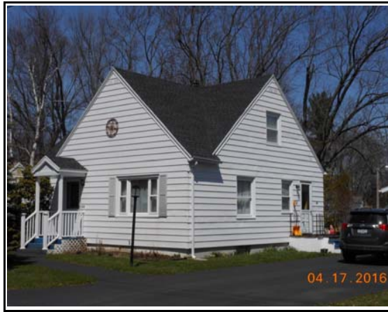
23 Adams St 180200 84.046-1-6

Neighborhood: 500 Property Class: 210 - 1 Family Res Sale Date: 9/30/2024 Sale Price: $ 170,000 Prelim 2025 Land Asmt: $ 14,800 Prelim 2025 Asmt: $ 153,000 Building Style: Cape Cod Exterior Wall: Alum/vinyl Year Built: 1935 Basement Type: Full Grade: Average Condition: Normal SFLA: 1,214 Sale Price/SFLA: $ 140.03 Number Bedrooms: 1 Number Baths: 1.0