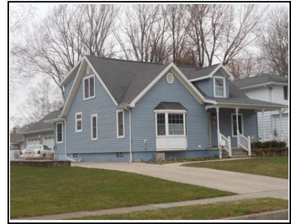
31 Woodrow Rd 180200 84.005-1-10

Neighborhood: 400 Property Class: 210 - 1 Family Res Sale Date: 9/13/2024 Sale Price: $ 240,000 Prelim 2025 Land Asmt: $ 25,100 Prelim 2025 Asmt: $ 232,000 Building Style: Cape Cod Exterior Wall: Alum/vinyl Year Built: 1953 Basement Type: Full Grade: Average Condition: Normal SFLA: 1,525 Sale Price/SFLA: $ 157.38 Number Bedrooms: 2 Number Baths: 2.0