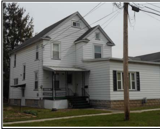
229 Liberty St 180200 84.074-1-47

Neighborhood: 500 Property Class: 210 - 1 Family Res Sale Date: 1/22/2024 Sale Price: $ 162,500 Prelim 2025 Land Asmt: $ 14,200 Prelim 2025 Asmt: $ 158,000 Building Style: Old Style Exterior Wall: Wood Year Built: 1890 Basement Type: Full Grade: Average Condition: Normal SFLA: 1,624 Sale Price/SFLA: $ 100.06 Number Bedrooms: 4 Number Baths: 1.5