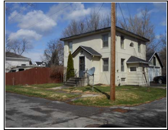
11 Bryant St 180200 84.008-1-88

Neighborhood: 200 Property Class: 210 - 1 Family Res Sale Date: 1/10/2024 Sale Price: $ 90,000 Prelim 2025 Land Asmt: $ 11,500 Prelim 2025 Asmt: $ 141,000 Building Style: Old Style Exterior Wall: Wood Year Built: 1900 Basement Type: Full Grade: Average Condition: Normal SFLA: 1,120 Sale Price/SFLA: $ 80.36 Number Bedrooms: 3 Number Baths: 1.0