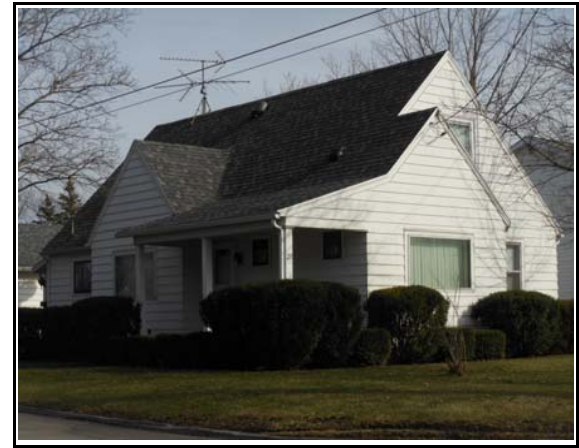
28 Garfield Ave 180200 84.073-2-59

Neighborhood: 500 Property Class: 210 - 1 Family Res Sale Date: 5/8/2023 Sale Price: $ 165,000 Prelim 2025 Land Asmt: $ 14,200 Prelim 2025 Asmt: $ 182,000 Building Style: Cape Cod Exterior Wall: Alum/vinyl Year Built: 1955 Basement Type: Full Grade: Average Condition: Normal SFLA: 1,368 Sale Price/SFLA: $ 120.61 Number Bedrooms: 4 Number Baths: 1.5