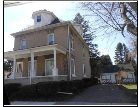
5 Allen St 180200 84.031-3-7

Neighborhood: 300 Property Class: 210 - 1 Family Res Sale Date: 3/1/2024 Sale Price: $ 211,000 Prelim 2025 Land Asmt: $ 10,300 Prelim 2025 Asmt: $ 232,000 Building Style: Old Style Exterior Wall: Alum/vinyl Year Built: 1929 Basement Type: Full Grade: Average Condition: Normal SFLA: 1,904 Sale Price/SFLA: $ 110.82 Number Bedrooms: 4 Number Baths: 1.5