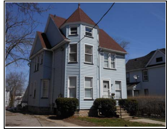
15 Highland Park 180200 84.065-1-26

Neighborhood: 500 Property Class: 220 - 2 Family Res Sale Date: 3/8/2024 Sale Price: $ 178,000 Prelim 2025 Land Asmt: $ 14,500 Prelim 2025 Asmt: $ 152,000 Building Style: Old Style Exterior Wall: Alum/vinyl Year Built: 1890 Basement Type: Full Grade: Average Condition: Good SFLA: 1,764 Sale Price/SFLA: $ 100.91 Number Bedrooms: 4 Number Baths: 2.0