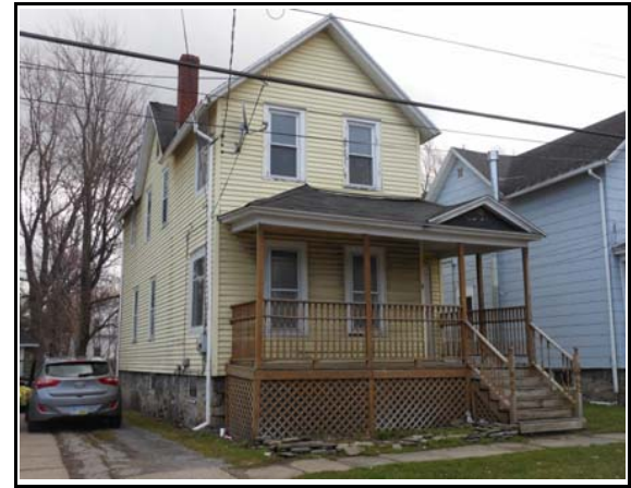
8 Tracy Ave 180200 84.042-1-36

Neighborhood: 300 Property Class: 210 - 1 Family Res Sale Date: 6/7/2024 Sale Price: $ 50,000 Prelim 2025 Land Asmt: $ 6,100 Prelim 2025 Asmt: $ 63,000 Building Style: Old Style Exterior Wall: Wood Year Built: 1925 Basement Type: Partial Grade: Average Condition: Poor SFLA: 1,265 Sale Price/SFLA: $ 39.53 Number Bedrooms: 3 Number Baths: 1.0