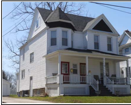
12 Highland Park 180200 84.065-2-7

Neighborhood: 500 Property Class: 220 - 2 Family Res Sale Date: 5/24/2023 Sale Price: $ 109,900 Prelim 2025 Land Asmt: $ 15,400 Prelim 2025 Asmt: $ 116,000 Building Style: Old Style Exterior Wall: Alum/vinyl Year Built: 1900 Basement Type: Full Grade: Average Condition: Fair SFLA: 1,936 Sale Price/SFLA: $ 56.77 Number Bedrooms: 3 Number Baths: 2.0