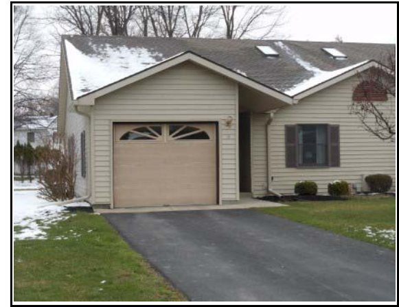
16 North Pointe Dr 180200 84.008-2-75

Neighborhood: 100 Property Class: 210 - 1 Family Res Sale Date: 12/13/2023 Sale Price: $ 235,000 Prelim 2025 Land Asmt: $ 9,900 Prelim 2025 Asmt: $ 191,000 Building Style: Town House Exterior Wall: Alum/vinyl Year Built: 1990 Basement Type: Full Grade: Average Condition: Normal SFLA: 1,236 Sale Price/SFLA: $ 190.13 Number Bedrooms: 2 Number Baths: 2.0