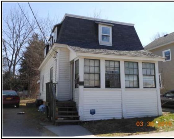
22 Hutchins Pl 180200 84.041-1-56

Neighborhood: 700 Property Class: 210 - 1 Family Res Sale Date: 1/11/2023 Sale Price: $ 60,000 Prelim 2025 Land Asmt: $ 7,000 Prelim 2025 Asmt: $ 80,000 Building Style: Old Style Exterior Wall: Alum/vinyl Year Built: 1900 Basement Type: Full Grade: Average Condition: Poor SFLA: 1,080 Sale Price/SFLA: $ 55.56 Number Bedrooms: 4 Number Baths: 1.0