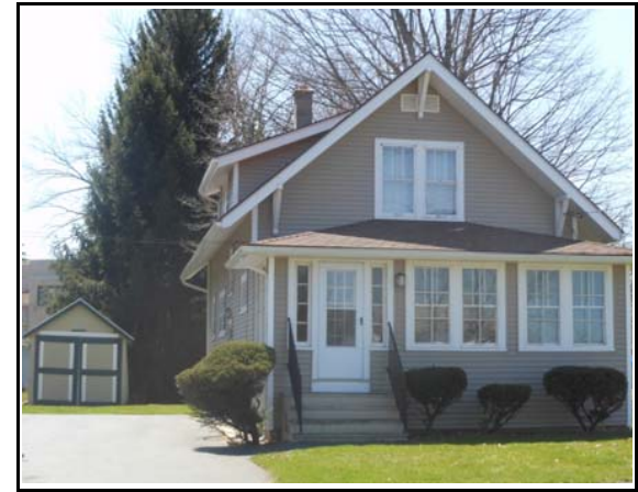
113 South Main St 180200 84.010-1-2

Neighborhood: 500 Property Class: 210 - 1 Family Res Sale Date: 10/25/2024 Sale Price: $ 170,000 Prelim 2025 Land Asmt: $ 12,200 Prelim 2025 Asmt: $ 159,000 Building Style: Old Style Exterior Wall: Alum/vinyl Year Built: 1900 Basement Type: Full Grade: Average Condition: Fair SFLA: 1,056 Sale Price/SFLA: $ 160.98 Number Bedrooms: 3 Number Baths: 1.0