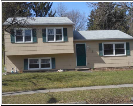
7 Gateway Dr 180200 71.018-2-33

Neighborhood: 200 Property Class: 210 - 1 Family Res Sale Date: 7/31/2023 Sale Price: $ 180,000 Prelim 2025 Land Asmt: $ 17,700 Prelim 2025 Asmt: $ 206,000 Building Style: Split Level Exterior Wall: Composition Year Built: 1970 Basement Type: Partial Grade: Average Condition: Normal SFLA: 1,280 Sale Price/SFLA: $ 140.63 Number Bedrooms: 3 Number Baths: 1.0