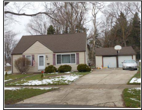
2 Crescent Ct 180200 85.009-2-53

Neighborhood: 200 Property Class: 210 - 1 Family Res Sale Date: 6/27/2024 Sale Price: $ 118,000 Prelim 2025 Land Asmt: $ 18,200 Prelim 2025 Asmt: $ 124,000 Building Style: Cape Cod Exterior Wall: Alum/vinyl Year Built: 1941 Basement Type: Crawl Grade: Average Condition: Normal SFLA: 1,080 Sale Price/SFLA: $ 109.26 Number Bedrooms: 3 Number Baths: 1.0