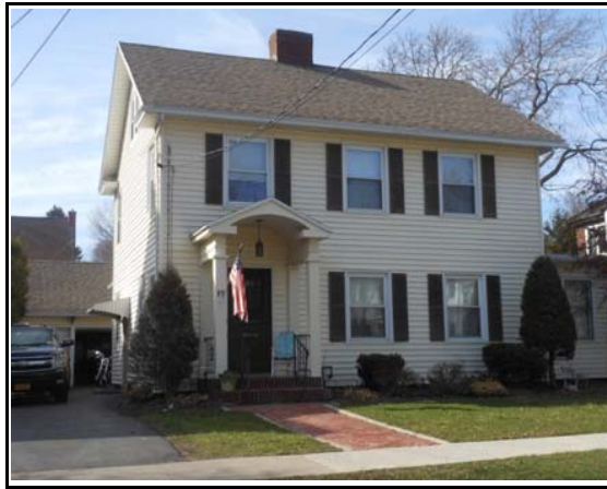
17 Lewis Ave 180200 84.032-2-11

Neighborhood: 200 Property Class: 210 - 1 Family Res Sale Date: 8/20/2024 Sale Price: $ 240,500 Prelim 2025 Land Asmt: $ 15,300 Prelim 2025 Asmt: $ 187,000 Building Style: Old Style Exterior Wall: Wood Year Built: 1910 Basement Type: Partial Grade: Average Condition: Normal SFLA: 1,654 Sale Price/SFLA: $ 145.41 Number Bedrooms: 4 Number Baths: 1.5