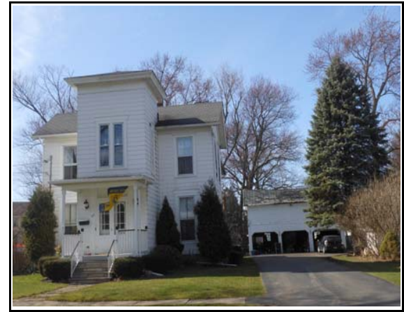
23 Prospect Ave 180200 84.032-1-26

Neighborhood: 200 Property Class: 220 - 2 Family Res Sale Date: 12/2/2024 Sale Price: $ 224,000 Prelim 2025 Land Asmt: $ 22,000 Prelim 2025 Asmt: $ 191,000 Building Style: Old Style Exterior Wall: Alum/vinyl Year Built: 1870 Basement Type: Full Grade: Average Condition: Normal SFLA: 2,276 Sale Price/SFLA: $ 98.42 Number Bedrooms: 4 Number Baths: 3.0