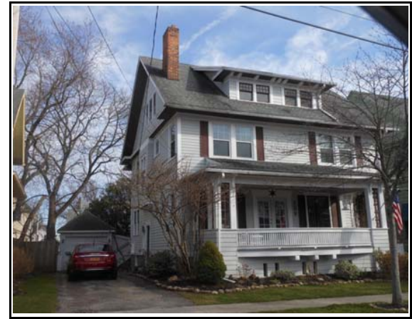
24 Thomas Ave 180200 84.040-2-81