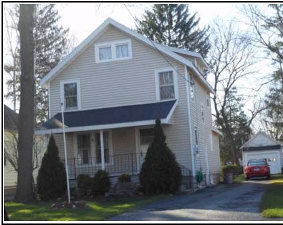
2 Roosevelt Ave 180200 84.038-1-44

Neighborhood: 500 Property Class: 210 - 1 Family Res Sale Date: 3/27/2024 Sale Price: $ 150,000 Prelim 2025 Land Asmt: $ 11,200 Prelim 2025 Asmt: $ 163,000 Building Style: Old Style Exterior Wall: Wood Year Built: 1930 Basement Type: Full Grade: Average Condition: Normal SFLA: 1,264 Sale Price/SFLA: $ 118.67 Number Bedrooms: 3 Number Baths: 1.0