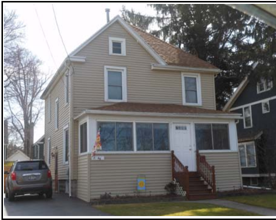
46 Lyon St 180200 84.024-1-57

Neighborhood: 300 Property Class: 210 - 1 Family Res Sale Date: 7/17/2023 Sale Price: $ 157,850 Prelim 2025 Land Asmt: $ 12,100 Prelim 2025 Asmt: $ 170,000 Building Style: Old Style Exterior Wall: Alum/vinyl Year Built: 1900 Basement Type: Full Grade: Average Condition: Normal SFLA: 1,344 Sale Price/SFLA: $ 117.45 Number Bedrooms: 3 Number Baths: 1.0