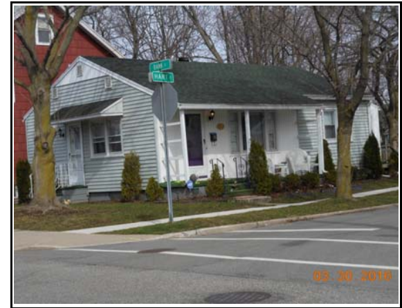
248 Bank St 180200 71.082-1-18

Neighborhood: 300 Property Class: 210 - 1 Family Res Sale Date: 9/4/2024 Sale Price: $ 185,000 Prelim 2025 Land Asmt: $ 12,100 Prelim 2025 Asmt: $ 167,000 Building Style: Ranch Exterior Wall: Alum/vinyl Year Built: 1960 Basement Type: Full Grade: Average Condition: Normal SFLA: 944 Sale Price/SFLA: $ 195.97 Number Bedrooms: 3 Number Baths: 1.0