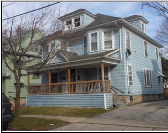
20 Thomas Ave 180200 84.040-2-83

Neighborhood: 300 Property Class: 220 - 2 Family Res Sale Date: 6/20/2024 Sale Price: $ 119,000 Prelim 2025 Land Asmt: $ 10,200 Prelim 2025 Asmt: $ 125,000 Building Style: Old Style Exterior Wall: Wood Year Built: 1910 Basement Type: Full Grade: Average Condition: Normal SFLA: 2,310 Sale Price/SFLA: $ 51.52 Number Bedrooms: 6 Number Baths: 2.0