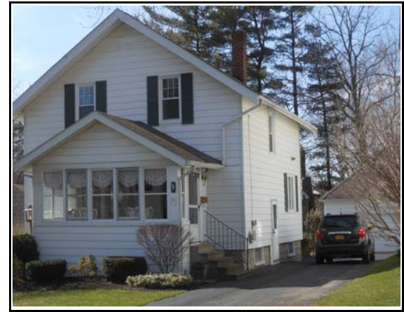
51 Prospect Ave 180200 84.024-1-10

Neighborhood: 200 Property Class: 210 - 1 Family Res Sale Date: 5/3/2024 Sale Price: $ 193,000 Prelim 2025 Land Asmt: $ 17,300 Prelim 2025 Asmt: $ 172,000 Building Style: Old Style Exterior Wall: Alum/vinyl Year Built: 1880 Basement Type: Partial Grade: Average Condition: Normal SFLA: 1,215 Sale Price/SFLA: $ 158.85 Number Bedrooms: 2 Number Baths: 1.0