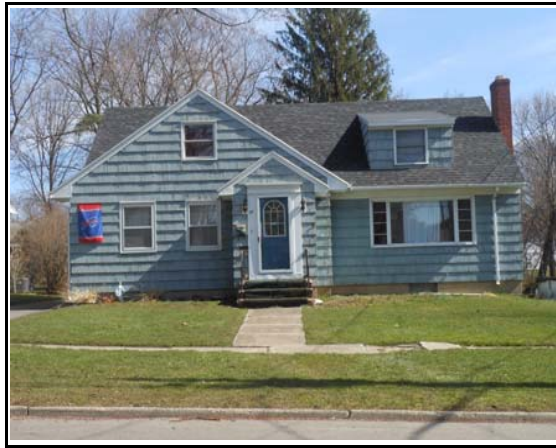
38 Prospect Ave 180200 84.006-4-60

Neighborhood: 200 Property Class: 210 - 1 Family Res Sale Date: 11/27/2024 Sale Price: $ 185,000 Prelim 2025 Land Asmt: $ 15,600 Prelim 2025 Asmt: $ 179,000 Building Style: Cape Cod Exterior Wall: Alum/vinyl Year Built: 1950 Basement Type: Full Grade: Average Condition: Normal SFLA: 1,719 Sale Price/SFLA: $ 107.62 Number Bedrooms: 3 Number Baths: 1.0