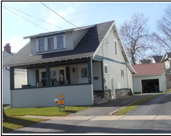
33 Prospect Ave 180200 84.032-1-22

Neighborhood: 200 Property Class: 210 - 1 Family Res Sale Date: 1/9/2024 Sale Price: $ 194,920 Prelim 2025 Land Asmt: $ 13,900 Prelim 2025 Asmt: $ 211,000 Building Style: Old Style Exterior Wall: Wood Year Built: 1925 Basement Type: Full Grade: Average Condition: Normal SFLA: 1,327 Sale Price/SFLA: $ 146.89 Number Bedrooms: 3 Number Baths: 1.5