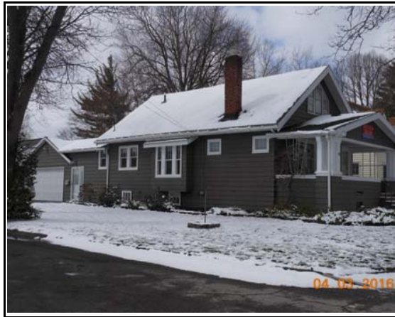
39 Trumbull Pkwy 180200 84.051-2-7

Neighborhood: 700 Property Class: 210 - 1 Family Res Sale Date: 2/14/2024 Sale Price: $ 125,000 Prelim 2025 Land Asmt: $ 17,000 Prelim 2025 Asmt: $ 143,000 Building Style: Ranch Exterior Wall: Alum/vinyl Year Built: 1980 Basement Type: Full Grade: Average Condition: Normal SFLA: 936 Sale Price/SFLA: $ 133.55 Number Bedrooms: 3 Number Baths: 1.0