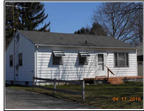
13 Northern Blvd 180200 71.020-1-57

Neighborhood: 200 Property Class: 210 - 1 Family Res Sale Date: 9/27/2024 Sale Price: $ 139,900 Prelim 2025 Land Asmt: $ 19,000 Prelim 2025 Asmt: $ 127,000 Building Style: Ranch Exterior Wall: Alum/vinyl Year Built: 1952 Basement Type: Full Grade: Average Condition: Normal SFLA: 768 Sale Price/SFLA: $ 182.16 Number Bedrooms: 2 Number Baths: 1.0