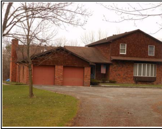
111 Clifton Ave 180200 97.008-1-23.1

Neighborhood: 500 Property Class: 210 - 1 Family Res Sale Date: 2/27/2024 Sale Price: $ 365,000 Prelim 2025 Land Asmt: $ 18,900 Prelim 2025 Asmt: $ 294,000 Building Style: Split Level Exterior Wall: Brick Year Built: 1972 Basement Type: Full Grade: Average Condition: Normal SFLA: 3,753 Sale Price/SFLA: $ 97.26 Number Bedrooms: 5 Number Baths: 2.5