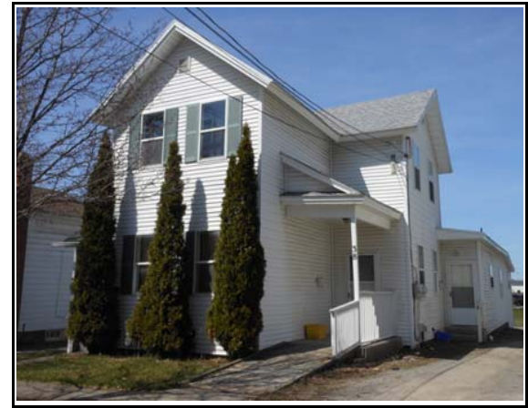
38 Maple St 180200 84.064-1-2

Neighborhood: 500 Property Class: 220 - 2 Family Res Sale Date: 6/18/2024 Sale Price: $ 71,000 Prelim 2025 Land Asmt: $ 15,600 Prelim 2025 Asmt: $ 101,000 Building Style: Old Style Exterior Wall: Alum/vinyl Year Built: 1890 Basement Type: Partial Grade: Average Condition: Poor SFLA: 2,270 Sale Price/SFLA: $ 31.28 Number Bedrooms: 4 Number Baths: 2.0