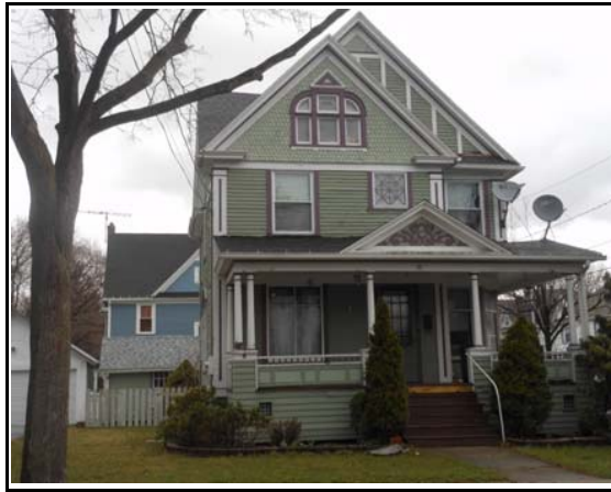
11 Washington Ave 180200 84.032-2-47

Neighborhood: 300 Property Class: 210 - 1 Family Res Sale Date: 10/6/2024 Sale Price: $ 169,500 Prelim 2025 Land Asmt: $ 12,400 Prelim 2025 Asmt: $ 148,000 Building Style: Old Style Exterior Wall: Alum/vinyl Year Built: 1920 Basement Type: Full Grade: Average Condition: Normal SFLA: 1,560 Sale Price/SFLA: $ 108.65 Number Bedrooms: 3 Number Baths: 1.0