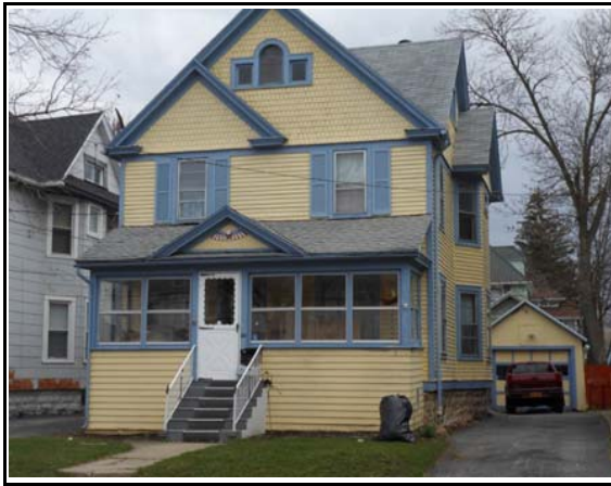
136 Ross St 180200 84.043-1-79

Neighborhood: 300 Property Class: 210 - 1 Family Res Sale Date: 5/10/2023 Sale Price: $ 145,000 Prelim 2025 Land Asmt: $ 8,800 Prelim 2025 Asmt: $ 157,000 Building Style: Old Style Exterior Wall: Alum/vinyl Year Built: 1900 Basement Type: Full Grade: Average Condition: Normal SFLA: 1,452 Sale Price/SFLA: $ 99.86 Number Bedrooms: 4 Number Baths: 1.0