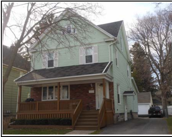
19 Lincoln Ave 180200 84.032-2-37

Neighborhood: 200 Property Class: 220 - 2 Family Res Sale Date: 10/20/2023 Sale Price: $ 179,900 Prelim 2025 Land Asmt: $ 11,500 Prelim 2025 Asmt: $ 194,000 Building Style: Old Style Exterior Wall: Alum/vinyl Year Built: 1900 Basement Type: Partial Grade: Average Condition: Normal SFLA: 1,812 Sale Price/SFLA: $ 99.28 Number Bedrooms: 4 Number Baths: 3.0