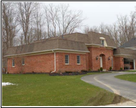
1 Carolwood Dr 180200 72.017-3-12

Neighborhood: 100 Property Class: 210 - 1 Family Res Sale Date: 8/21/2024 Sale Price: $ 425,000 Prelim 2025 Land Asmt: $ 41,600 Prelim 2025 Asmt: $ 412,000 Building Style: Contemp Exterior Wall: Brick Year Built: 1999 Basement Type: Partial Grade: Good Condition: Normal SFLA: 3,092 Sale Price/SFLA: $ 137.45 Number Bedrooms: 4 Number Baths: 2.5