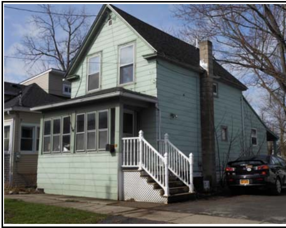
65 Columbia Ave 180200 84.035-1-34

Neighborhood: 300 Property Class: 210 - 1 Family Res Sale Date: 11/27/2024 Sale Price: $ 142,000 Prelim 2025 Land Asmt: $ 6,100 Prelim 2025 Asmt: $ 127,000 Building Style: Old Style Exterior Wall: Wood Year Built: 1900 Basement Type: Full Grade: Average Condition: Normal SFLA: 864 Sale Price/SFLA: $ 164.35 Number Bedrooms: 2 Number Baths: 1.0