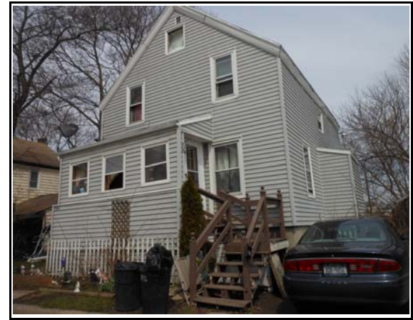
11 Hall St 180200 84.066-2-22

Neighborhood: 600 Property Class: 210 - 1 Family Res Sale Date: 5/3/2023 Sale Price: $ 139,900 Prelim 2025 Land Asmt: $ 11,800 Prelim 2025 Asmt: $ 143,000 Building Style: Old Style Exterior Wall: Alum/vinyl Year Built: 1900 Basement Type: Full Grade: Average Condition: Normal SFLA: 1,232 Sale Price/SFLA: $ 113.56 Number Bedrooms: 3 Number Baths: 1.0