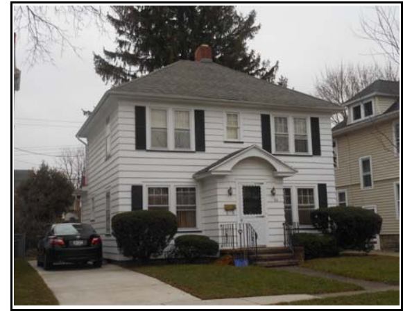
30 Kingsbury Ave 180200 84.023-2-29

Neighborhood: 200 Property Class: 210 - 1 Family Res Sale Date: 3/6/2024 Sale Price: $ 228,000 Prelim 2025 Land Asmt: $ 14,000 Prelim 2025 Asmt: $ 178,000 Building Style: Old Style Exterior Wall: Alum/vinyl Year Built: 1925 Basement Type: Full Grade: Average Condition: Normal SFLA: 1,472 Sale Price/SFLA: $ 154.89 Number Bedrooms: 3 Number Baths: 1.0