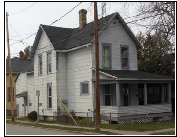
110 Jackson St 180200 84.057-1-36

Neighborhood: 500 Property Class: 220 - 2 Family Res Sale Date: 1/10/2023 Sale Price: $ 78,000 Prelim 2025 Land Asmt: $ 8,700 Prelim 2025 Asmt: $ 99,000 Building Style: Old Style Exterior Wall: Wood Year Built: 1880 Basement Type: Full Grade: Average Condition: Fair SFLA: 1,613 Sale Price/SFLA: $ 48.36 Number Bedrooms: 3 Number Baths: 2.0