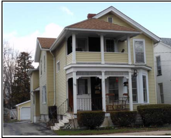
119 Summit St 180200 84.042-1-12

Neighborhood: 300 Property Class: 230 - 3 Family Res Sale Date: 3/21/2024 Sale Price: $ 72,000 Prelim 2025 Land Asmt: $ 10,200 Prelim 2025 Asmt: $ 99,000 Building Style: Old Style Exterior Wall: Wood Year Built: 1920 Basement Type: Full Grade: Average Condition: Poor SFLA: 1,926 Sale Price/SFLA: $ 37.38 Number Bedrooms: 4 Number Baths: 3.0