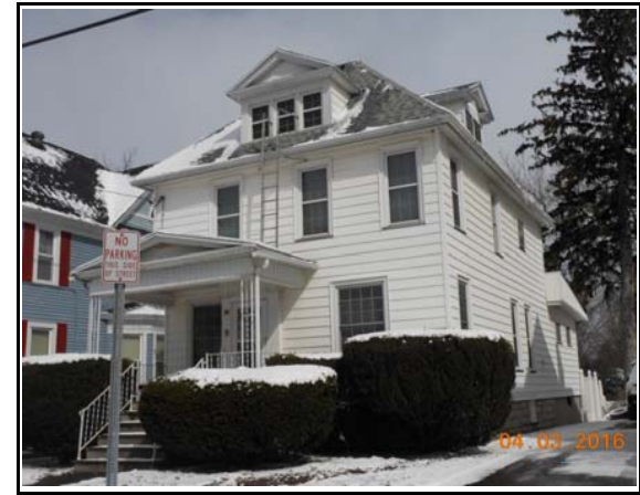
13 Fisher Park 180200 84.051-1-24

Neighborhood: 700 Property Class: 220 - 2 Family Res Sale Date: 2/28/2024 Sale Price: $ 100,000 Prelim 2025 Land Asmt: $ 12,700 Prelim 2025 Asmt: $ 110,000 Building Style: Old Style Exterior Wall: Wood Year Built: 1910 Basement Type: Full Grade: Average Condition: Fair SFLA: 1,908 Sale Price/SFLA: $ 52.41 Number Bedrooms: 4 Number Baths: 2.0