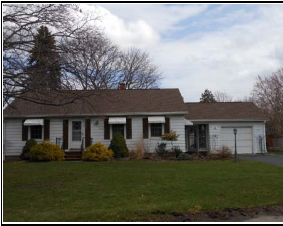
15 Farwell Dr 180200 84.008-1-67

Neighborhood: 200 Property Class: 210 - 1 Family Res Sale Date: 9/27/2024 Sale Price: $ 209,000 Prelim 2025 Land Asmt: $ 18,300 Prelim 2025 Asmt: $ 210,000 Building Style: Ranch Exterior Wall: Alum/vinyl Year Built: 1955 Basement Type: Full Grade: Average Condition: Normal SFLA: 1,380 Sale Price/SFLA: $ 151.45 Number Bedrooms: 2 Number Baths: 1.5