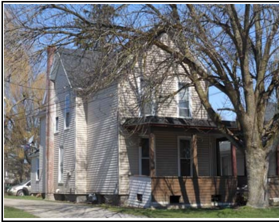
16 Walnut St 180200 84.048-1-44

Neighborhood: 500 Property Class: 220 - 2 Family Res Sale Date: 1/12/2023 Sale Price: $ 85,000 Prelim 2025 Land Asmt: $ 12,200 Prelim 2025 Asmt: $ 93,000 Building Style: Old Style Exterior Wall: Alum/vinyl Year Built: 1900 Basement Type: Full Grade: Average Condition: Poor SFLA: 2,090 Sale Price/SFLA: $ 40.67 Number Bedrooms: 3 Number Baths: 2.0