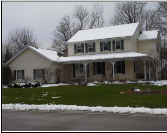
207 Naramore Dr 180200 85.005-1-74

Neighborhood: 100 Property Class: 210 - 1 Family Res Sale Date: 6/12/2023 Sale Price: $ 392,000 Prelim 2025 Land Asmt: $ 35,700 Prelim 2025 Asmt: $ 435,000 Building Style: Colonial Exterior Wall: Alum/vinyl Year Built: 1988 Basement Type: Partial Grade: Average Condition: Normal SFLA: 2,268 Sale Price/SFLA: $ 172.84 Number Bedrooms: 4 Number Baths: 3.0