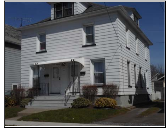
9 Olyn St 180200 84.031-3-45

Neighborhood: 300 Property Class: 220 - 2 Family Res Sale Date: 10/30/2024 Sale Price: $ 112,000 Prelim 2025 Land Asmt: $ 10,400 Prelim 2025 Asmt: $ 123,000 Building Style: Old Style Exterior Wall: Alum/vinyl Year Built: 1890 Basement Type: Full Grade: Average Condition: Fair SFLA: 1,940 Sale Price/SFLA: $ 57.73 Number Bedrooms: 4 Number Baths: 2.0