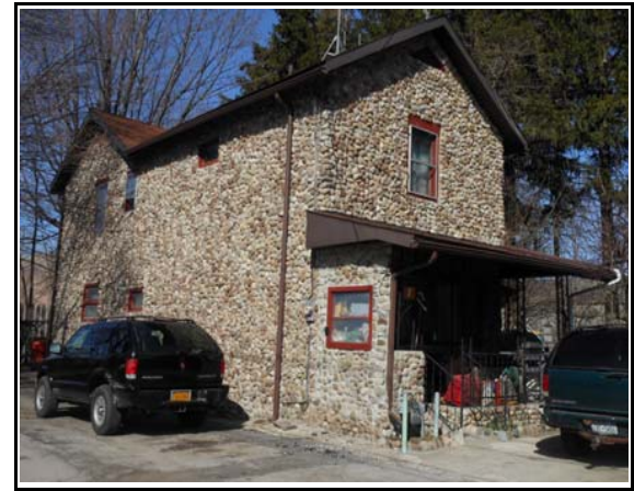
1 Thorp St 180200 84.057-1-6

Neighborhood: 500 Property Class: 210 - 1 Family Res Sale Date: 2/23/2024 Sale Price: $ 124,900 Prelim 2025 Land Asmt: $ 11,800 Prelim 2025 Asmt: $ 122,000 Building Style: Old Style Exterior Wall: Alum/vinyl Year Built: 1900 Basement Type: Full Grade: Average Condition: Normal SFLA: 1,662 Sale Price/SFLA: $ 75.15 Number Bedrooms: 4 Number Baths: 1.5