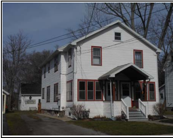
61 1/2 Lyon St 180200 84.006-2-65

Neighborhood: 300 Property Class: 220 - 2 Family Res Sale Date: 1/19/2024 Sale Price: $ 150,000 Prelim 2025 Land Asmt: $ 16,700 Prelim 2025 Asmt: $ 164,000 Building Style: Old Style Exterior Wall: Alum/vinyl Year Built: 1930 Basement Type: Partial Grade: Average Condition: Normal SFLA: 2,208 Sale Price/SFLA: $ 67.93 Number Bedrooms: 4 Number Baths: 2.0