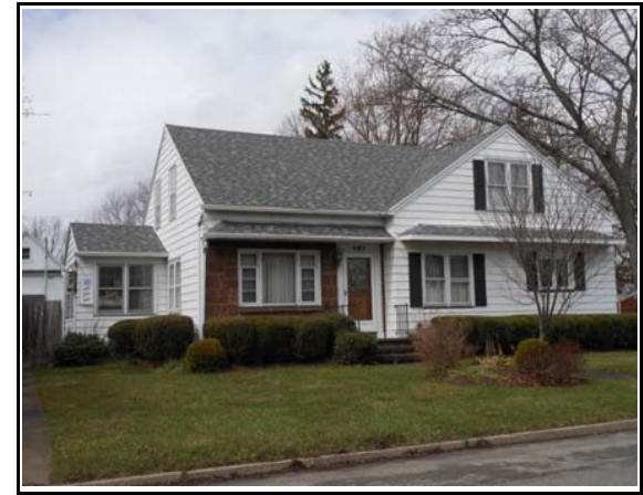
151 Vine St 180200 84.035-1-14

Neighborhood: 200 Property Class: 210 - 1 Family Res Sale Date: 5/10/2024 Sale Price: $ 180,000 Prelim 2025 Land Asmt: $ 17,000 Prelim 2025 Asmt: $ 174,000 Building Style: Cape Cod Exterior Wall: Wood Year Built: 1950 Basement Type: Full Grade: Average Condition: Normal SFLA: 1,848 Sale Price/SFLA: $ 97.40 Number Bedrooms: 3 Number Baths: 1.5