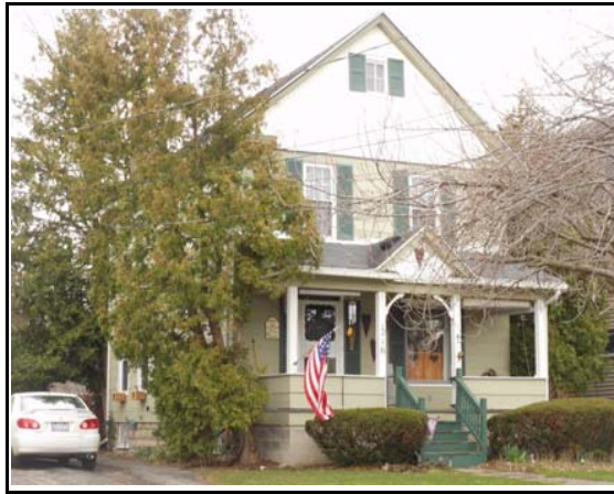
216 Ross St 180200 84.035-1-87

Neighborhood: 200 Property Class: 210 - 1 Family Res Sale Date: 5/16/2023 Sale Price: $ 225,000 Prelim 2025 Land Asmt: $ 15,900 Prelim 2025 Asmt: $ 251,000 Building Style: Colonial Exterior Wall: Alum/vinyl Year Built: 1950 Basement Type: Full Grade: Average Condition: Normal SFLA: 2,508 Sale Price/SFLA: $ 89.71 Number Bedrooms: 5 Number Baths: 2.0