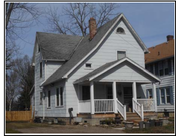
63 Lyon St 180200 84.006-2-64

Neighborhood: 300 Property Class: 210 - 1 Family Res Sale Date: 8/7/2024 Sale Price: $ 97,000 Prelim 2025 Land Asmt: $ 11,200 Prelim 2025 Asmt: $ 149,000 Building Style: Old Style Exterior Wall: Wood Year Built: 1870 Basement Type: Full Grade: Average Condition: Fair SFLA: 1,364 Sale Price/SFLA: $ 71.11 Number Bedrooms: 3 Number Baths: 1.0