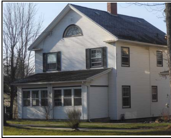
1 Richmond Ave 180200 84.006-4-5

Neighborhood: 300 Property Class: 210 - 1 Family Res Sale Date: 11/20/2023 Sale Price: $ 80,487 Prelim 2025 Land Asmt: $ 11,200 Prelim 2025 Asmt: $ 123,000 Building Style: Old Style Exterior Wall: Alum/vinyl Year Built: 1915 Basement Type: Full Grade: Average Condition: Poor SFLA: 1,876 Sale Price/SFLA: $ 42.90 Number Bedrooms: 4 Number Baths: 1.5