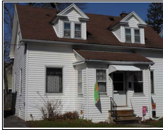
21 Manhattan Ave 180200 84.035-1-61

Neighborhood: 300 Property Class: 210 - 1 Family Res Sale Date: 6/27/2024 Sale Price: $ 162,000 Prelim 2025 Land Asmt: $ 6,100 Prelim 2025 Asmt: $ 111,000 Building Style: Old Style Exterior Wall: Composition Year Built: 1880 Basement Type: Full Grade: Average Condition: Normal SFLA: 1,092 Sale Price/SFLA: $ 148.35 Number Bedrooms: 2 Number Baths: 1.0