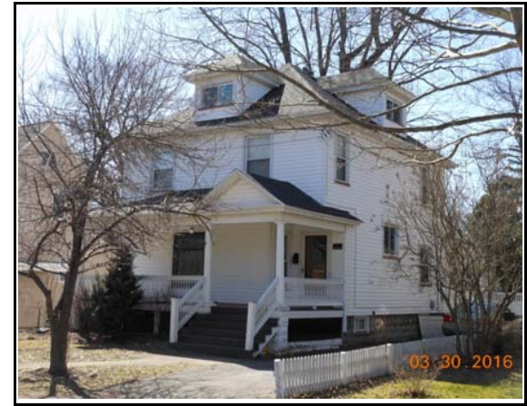
4 Park Ave 180200 84.032-2-3

Neighborhood: 200 Property Class: 210 - 1 Family Res Sale Date: 8/15/2023 Sale Price: $ 120,000 Prelim 2025 Land Asmt: $ 15,300 Prelim 2025 Asmt: $ 140,000 Building Style: Old Style Exterior Wall: Alum/vinyl Year Built: 1905 Basement Type: Full Grade: Average Condition: Normal SFLA: 1,628 Sale Price/SFLA: $ 73.71 Number Bedrooms: 4 Number Baths: 1.5