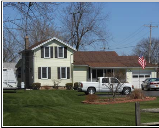
168 South Main St 180200 84.005-2-38

Neighborhood: 500 Property Class: 210 - 1 Family Res Sale Date: 4/11/2023 Sale Price: $ 91,500 Prelim 2025 Land Asmt: $ 7,800 Prelim 2025 Asmt: $ 101,000 Building Style: Old Style Exterior Wall: Composition Year Built: 1900 Basement Type: Partial Grade: Average Condition: Fair SFLA: 1,320 Sale Price/SFLA: $ 69.32 Number Bedrooms: 3 Number Baths: 1.5