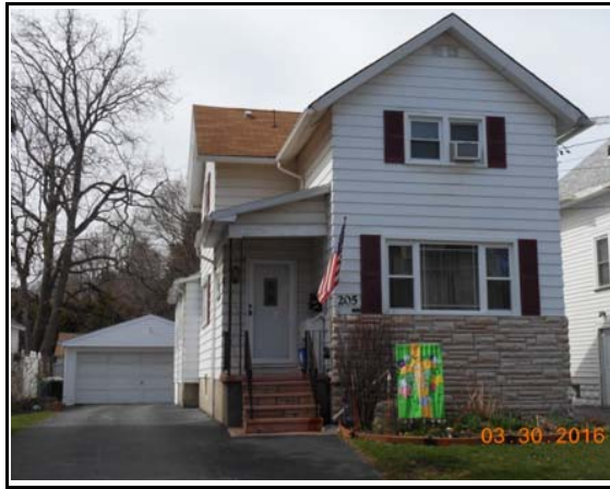
205 Bank St 180200 84.025-1-27

Neighborhood: 300 Property Class: 210 - 1 Family Res Sale Date: 11/16/2023 Sale Price: $ 158,000 Prelim 2025 Land Asmt: $ 10,900 Prelim 2025 Asmt: $ 151,000 Building Style: Old Style Exterior Wall: Alum/vinyl Year Built: 1900 Basement Type: Full Grade: Average Condition: Normal SFLA: 1,482 Sale Price/SFLA: $ 106.61 Number Bedrooms: 2 Number Baths: 1.5