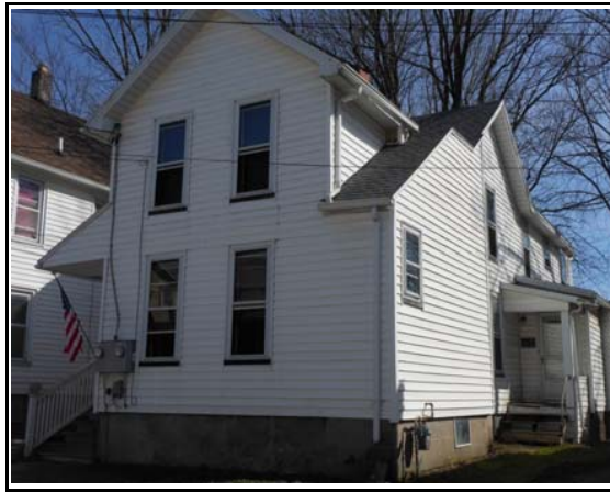
3 Watson St 180200 84.065-1-10

Neighborhood: 500 Property Class: 210 - 1 Family Res Sale Date: 8/15/2024 Sale Price: $ 258,400 Prelim 2025 Land Asmt: $ 18,200 Prelim 2025 Asmt: $ 223,000 Building Style: Old Style Exterior Wall: Alum/vinyl Year Built: 1874 Basement Type: Full Grade: Average Condition: Normal SFLA: 2,238 Sale Price/SFLA: $ 115.46 Number Bedrooms: 5 Number Baths: 2.0