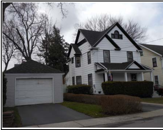
1 Hull Park 180200 84.042-2-52

Neighborhood: 300 Property Class: 210 - 1 Family Res Sale Date: 9/10/2024 Sale Price: $ 113,400 Prelim 2025 Land Asmt: $ 9,000 Prelim 2025 Asmt: $ 124,000 Building Style: Old Style Exterior Wall: Alum/vinyl Year Built: 1907 Basement Type: Full Grade: Average Condition: Normal SFLA: 1,688 Sale Price/SFLA: $ 67.18 Number Bedrooms: 4 Number Baths: 1.5