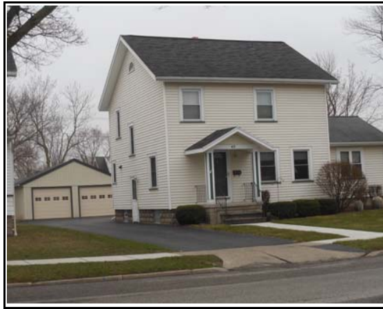
40 Redfield Pkwy 180200 84.005-1-66

Neighborhood: 400 Property Class: 210 - 1 Family Res Sale Date: 12/10/2024 Sale Price: $ 190,000 Prelim 2025 Land Asmt: $ 47,000 Prelim 2025 Asmt: $ 156,000 Building Style: Old Style Exterior Wall: Alum/vinyl Year Built: 1928 Basement Type: Full Grade: Average Condition: Normal SFLA: 1,528 Sale Price/SFLA: $ 124.35 Number Bedrooms: 3 Number Baths: 2.0