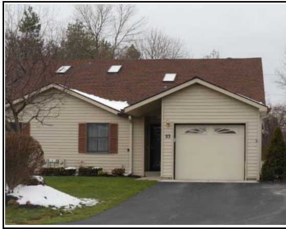
23 North Pointe Dr 180200 84.008-2-87

Neighborhood: 100 Property Class: 210 - 1 Family Res Sale Date: 10/25/2024 Sale Price: $ 175,000 Prelim 2025 Land Asmt: $ 9,900 Prelim 2025 Asmt: $ 191,000 Building Style: Town House Exterior Wall: Alum/vinyl Year Built: 1990 Basement Type: Full Grade: Average Condition: Normal SFLA: 1,236 Sale Price/SFLA: $ 141.59 Number Bedrooms: 2 Number Baths: 2.0