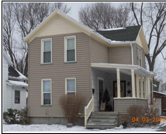
7 Chase Park 180200 84.051-1-8

Neighborhood: 700 Property Class: 210 - 1 Family Res Sale Date: 9/29/2023 Sale Price: $ 51,000 Prelim 2025 Land Asmt: $ 8,300 Prelim 2025 Asmt: $ 58,000 Building Style: Old Style Exterior Wall: Alum/vinyl Year Built: 1880 Basement Type: Full Grade: Economy Condition: Poor SFLA: 1,512 Sale Price/SFLA: $ 33.73 Number Bedrooms: 5 Number Baths: 2.0