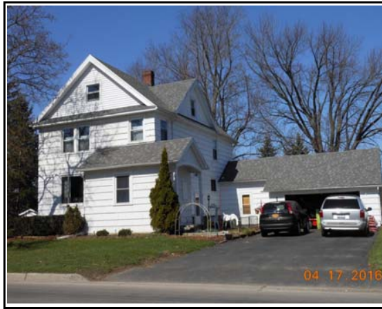
20 River St 180200 84.005-2-54

Neighborhood: 500 Property Class: 220 - 2 Family Res Sale Date: 12/20/2024 Sale Price: $ 172,000 Prelim 2025 Land Asmt: $ 12,600 Prelim 2025 Asmt: $ 161,500 Building Style: Old Style Exterior Wall: Alum/vinyl Year Built: 1880 Basement Type: Full Grade: Average Condition: Normal SFLA: 1,772 Sale Price/SFLA: $ 97.07 Number Bedrooms: 3 Number Baths: 2.0