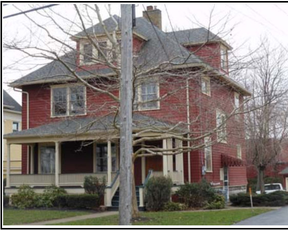
25 Ross St 180200 84.011-2-31

Neighborhood: 700 Property Class: 210 - 1 Family Res Sale Date: 7/28/2023 Sale Price: $ 260,000 Prelim 2025 Land Asmt: $ 17,000 Prelim 2025 Asmt: $ 274,000 Building Style: Old Style Exterior Wall: Wood Year Built: 1925 Basement Type: Full Grade: Average Condition: Normal SFLA: 2,336 Sale Price/SFLA: $ 111.30 Number Bedrooms: 4 Number Baths: 2.0