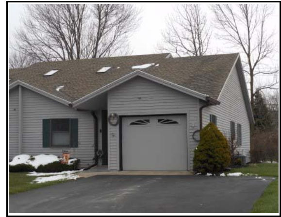
2 North Pointe Dr 180200 84.008-2-68

Neighborhood: 100 Property Class: 210 - 1 Family Res Sale Date: 10/10/2024 Sale Price: $ 209,900 Prelim 2025 Land Asmt: $ 9,900 Prelim 2025 Asmt: $ 198,000 Building Style: Town House Exterior Wall: Alum/vinyl Year Built: 1993 Basement Type: Full Grade: Average Condition: Normal SFLA: 1,348 Sale Price/SFLA: $ 155.71 Number Bedrooms: 2 Number Baths: 2.0