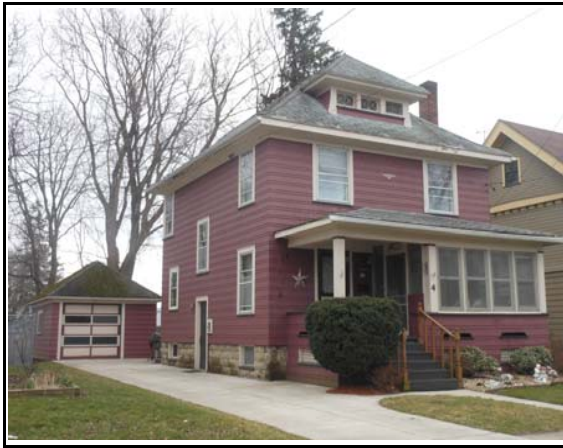
4 Vernon Ave 180200 84.006-3-46

Neighborhood: 200 Property Class: 210 - 1 Family Res Sale Date: 9/30/2024 Sale Price: $ 145,000 Prelim 2025 Land Asmt: $ 13,900 Prelim 2025 Asmt: $ 149,000 Building Style: Old Style Exterior Wall: Wood Year Built: 1925 Basement Type: Full Grade: Average Condition: Normal SFLA: 1,470 Sale Price/SFLA: $ 98.64 Number Bedrooms: 4 Number Baths: 1.0