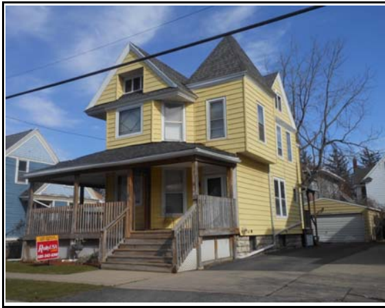
10 Dellinger Ave 180200 84.040-2-59

Neighborhood: 300 Property Class: 210 - 1 Family Res Sale Date: 11/20/2023 Sale Price: $ 80,487 Prelim 2025 Land Asmt: $ 11,200 Prelim 2025 Asmt: $ 123,000 Building Style: Old Style Exterior Wall: Alum/vinyl Year Built: 1915 Basement Type: Full Grade: Average Condition: Poor SFLA: 1,876 Sale Price/SFLA: $ 42.90 Number Bedrooms: 4 Number Baths: 1.5