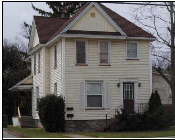
336 Ellicott St 180200 84.066-2-33

Neighborhood: 600 Property Class: 210 - 1 Family Res Sale Date: 4/6/2023 Sale Price: $ 155,000 Prelim 2025 Land Asmt: $ 14,200 Prelim 2025 Asmt: $ 160,000 Building Style: Old Style Exterior Wall: Alum/vinyl Year Built: 1910 Basement Type: Full Grade: Average Condition: Normal SFLA: 1,428 Sale Price/SFLA: $ 108.54 Number Bedrooms: 3 Number Baths: 1.5