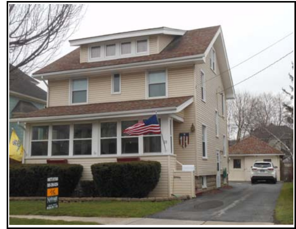
21 Vernon Ave 180200 84.023-2-24

Neighborhood: 200 Property Class: 210 - 1 Family Res Sale Date: 2/23/2023 Sale Price: $ 147,500 Prelim 2025 Land Asmt: $ 14,600 Prelim 2025 Asmt: $ 160,000 Building Style: Old Style Exterior Wall: Alum/vinyl Year Built: 1920 Basement Type: Full Grade: Average Condition: Normal SFLA: 1,660 Sale Price/SFLA: $ 88.86 Number Bedrooms: 3 Number Baths: 1.0