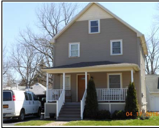
13 Brooklyn Ave 180200 84.047-2-65

Neighborhood: 500 Property Class: 210 - 1 Family Res Sale Date: 4/12/2024 Sale Price: $ 145,000 Prelim 2025 Land Asmt: $ 18,000 Prelim 2025 Asmt: $ 144,000 Building Style: Old Style Exterior Wall: Alum/vinyl Year Built: 1920 Basement Type: Partial Grade: Average Condition: Normal SFLA: 891 Sale Price/SFLA: $ 162.74 Number Bedrooms: 3 Number Baths: 1.0