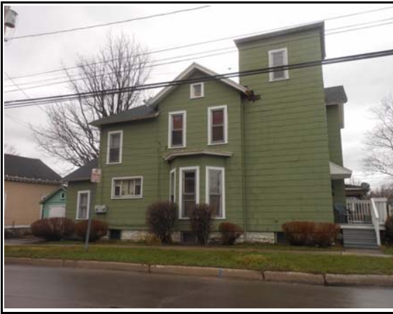
101 State St 180200 84.041-1-38

Neighborhood: 700 Property Class: 220 - 2 Family Res Sale Date: 5/24/2023 Sale Price: $ 84,000 Prelim 2025 Land Asmt: $ 9,300 Prelim 2025 Asmt: $ 103,000 Building Style: Old Style Exterior Wall: Wood Year Built: 1880 Basement Type: Full Grade: Average Condition: Poor SFLA: 2,216 Sale Price/SFLA: $ 37.91 Number Bedrooms: 4 Number Baths: 2.0