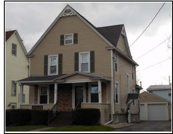
218 Ross St 180200 84.035-1-88

Neighborhood: 200 Property Class: 210 - 1 Family Res Sale Date: 10/12/2023 Sale Price: $ 135,000 Prelim 2025 Land Asmt: $ 11,600 Prelim 2025 Asmt: $ 147,000 Building Style: Old Style Exterior Wall: Wood Year Built: 1900 Basement Type: Full Grade: Average Condition: Normal SFLA: 1,344 Sale Price/SFLA: $ 100.45 Number Bedrooms: 4 Number Baths: 1.0