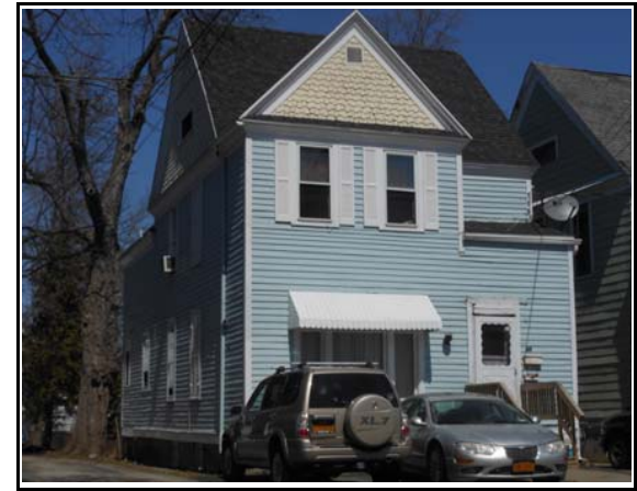
46 South Main St 180200 84.039-2-12

Neighborhood: 500 Property Class: 210 - 1 Family Res Sale Date: 10/27/2023 Sale Price: $ 155,000 Prelim 2025 Land Asmt: $ 19,300 Prelim 2025 Asmt: $ 162,000 Building Style: Old Style Exterior Wall: Alum/vinyl Year Built: 1912 Basement Type: Full Grade: Average Condition: Normal SFLA: 1,920 Sale Price/SFLA: $ 80.73 Number Bedrooms: 4 Number Baths: 1.5