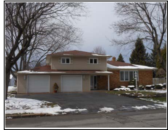
15 Naramore Dr 180200 84.008-2-4

Neighborhood: 100 Property Class: 210 - 1 Family Res Sale Date: 3/3/2023 Sale Price: $ 220,000 Prelim 2025 Land Asmt: $ 29,700 Prelim 2025 Asmt: $ 247,000 Building Style: R. Ranch Exterior Wall: Alum/vinyl Year Built: 1968 Basement Type: Full Grade: Average Condition: Normal SFLA: 1,911 Sale Price/SFLA: $ 115.12 Number Bedrooms: 4 Number Baths: 2.0