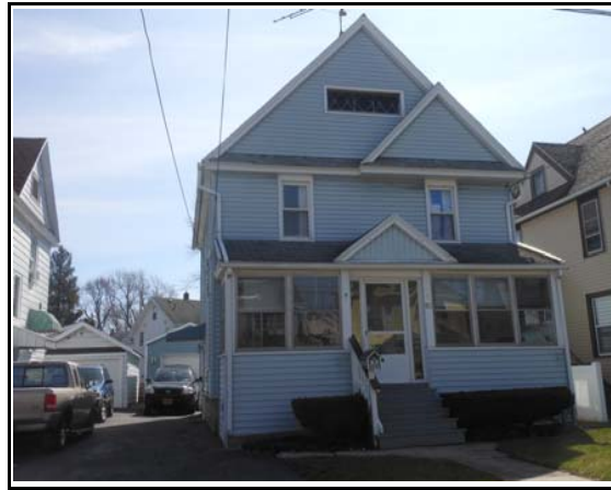
52 Montclair Ave 180200 84.024-1-44

Neighborhood: 300 Property Class: 210 - 1 Family Res Sale Date: 2/2/2024 Sale Price: $ 65,000 Prelim 2025 Land Asmt: $ 10,300 Prelim 2025 Asmt: $ 70,000 Building Style: Old Style Exterior Wall: Alum/vinyl Year Built: 1900 Basement Type: Full Grade: Average Condition: Poor SFLA: 1,400 Sale Price/SFLA: $ 46.43 Number Bedrooms: 4 Number Baths: 1.5