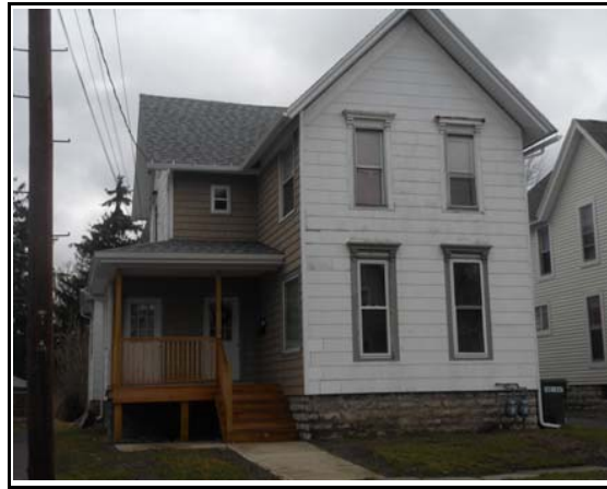
305 Washington Ave 180200 84.042-2-44

Neighborhood: 300 Property Class: 210 - 1 Family Res Sale Date: 1/20/2023 Sale Price: $ 125,000 Prelim 2025 Land Asmt: $ 16,200 Prelim 2025 Asmt: $ 152,000 Building Style: Old Style Exterior Wall: Alum/vinyl Year Built: 1900 Basement Type: Partial Grade: Average Condition: Fair SFLA: 2,502 Sale Price/SFLA: $ 49.96 Number Bedrooms: 4 Number Baths: 2.0