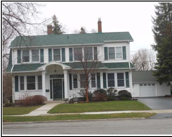
2 Redfield Pkwy 180200 84.005-1-52

Neighborhood: 400 Property Class: 210 - 1 Family Res Sale Date: 8/11/2023 Sale Price: $ 220,000 Prelim 2025 Land Asmt: $ 29,000 Prelim 2025 Asmt: $ 242,000 Building Style: Colonial Exterior Wall: Alum/vinyl Year Built: 1930 Basement Type: Full Grade: Good Condition: Normal SFLA: 1,752 Sale Price/SFLA: $ 125.57 Number Bedrooms: 4 Number Baths: 1.0