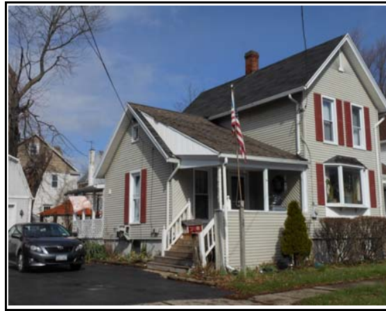
27 Columbia Ave 180200 84.043-1-33

Neighborhood: 300 Property Class: 210 - 1 Family Res Sale Date: 11/27/2024 Sale Price: $ 142,000 Prelim 2025 Land Asmt: $ 6,100 Prelim 2025 Asmt: $ 127,000 Building Style: Old Style Exterior Wall: Wood Year Built: 1900 Basement Type: Full Grade: Average Condition: Normal SFLA: 864 Sale Price/SFLA: $ 164.35 Number Bedrooms: 2 Number Baths: 1.0