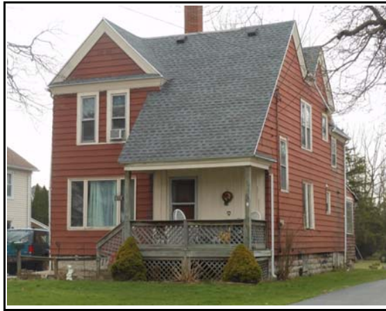
138 Jackson St 180200 84.015-2-16

Neighborhood: 500 Property Class: 210 - 1 Family Res Sale Date: 8/21/2024 Sale Price: $ 110,000 Prelim 2025 Land Asmt: $ 15,000 Prelim 2025 Asmt: $ 92,000 Building Style: Old Style Exterior Wall: Alum/vinyl Year Built: 1900 Basement Type: Full Grade: Average Condition: Fair SFLA: 1,992 Sale Price/SFLA: $ 55.22 Number Bedrooms: 5 Number Baths: 2.0