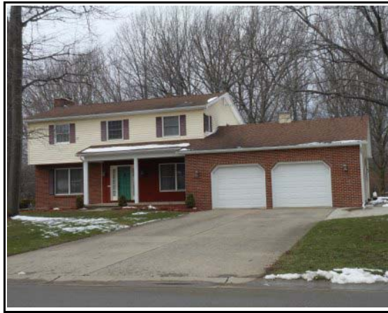
115 Naramore Dr 180200 85.005-1-51

Neighborhood: 100 Property Class: 210 - 1 Family Res Sale Date: 6/12/2023 Sale Price: $ 392,000 Prelim 2025 Land Asmt: $ 35,700 Prelim 2025 Asmt: $ 435,000 Building Style: Colonial Exterior Wall: Alum/vinyl Year Built: 1988 Basement Type: Partial Grade: Average Condition: Normal SFLA: 2,268 Sale Price/SFLA: $ 172.84 Number Bedrooms: 4 Number Baths: 3.0