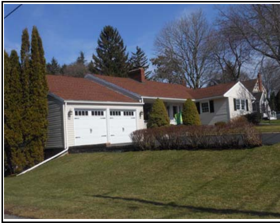
10 Buxton Ave 180200 84.006-2-26

Neighborhood: 200 Property Class: 210 - 1 Family Res Sale Date: 6/8/2023 Sale Price: $ 182,500 Prelim 2025 Land Asmt: $ 20,100 Prelim 2025 Asmt: $ 200,000 Building Style: Ranch Exterior Wall: Alum/vinyl Year Built: 1951 Basement Type: Full Grade: Average Condition: Good SFLA: 932 Sale Price/SFLA: $ 195.82 Number Bedrooms: 2 Number Baths: 1.5