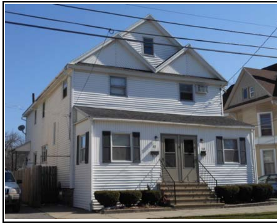
10-12 South Main St 180200 84.048-1-69

Neighborhood: 500 Property Class: 210 - 1 Family Res Sale Date: 2/6/2023 Sale Price: $ 100,000 Prelim 2025 Land Asmt: $ 17,100 Prelim 2025 Asmt: $ 102,000 Building Style: Old Style Exterior Wall: Alum/vinyl Year Built: 1870 Basement Type: Partial Grade: Economy Condition: Poor SFLA: 2,569 Sale Price/SFLA: $ 38.93 Number Bedrooms: 5 Number Baths: 3.5