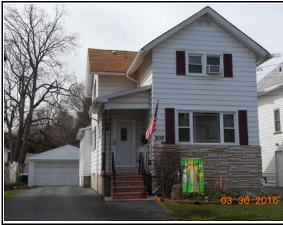
205 Bank St 180200 84.025-1-27

Neighborhood: 300 Property Class: 210 - 1 Family Res Sale Date: 11/16/2023 Sale Price: $ 158,000 Prelim 2025 Land Asmt: $ 10,900 Prelim 2025 Asmt: $ 151,000 Building Style: Old Style Exterior Wall: Alum/vinyl Year Built: 1900 Basement Type: Full Grade: Average Condition: Normal SFLA: 1,482 Sale Price/SFLA: $ 106.61 Number Bedrooms: 2 Number Baths: 1.5