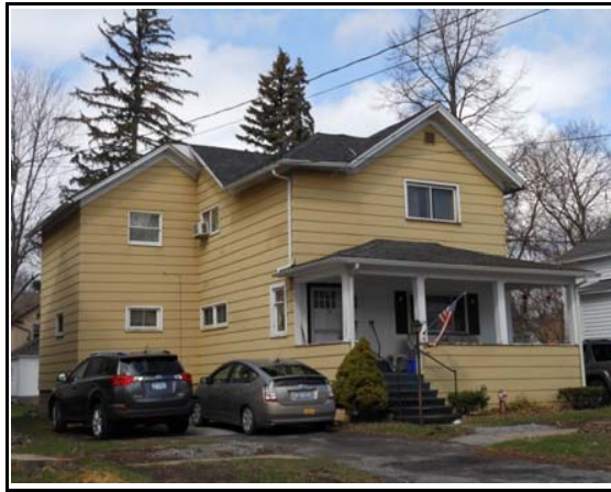
159 Summit St 180200 84.034-1-25

Neighborhood: 300 Property Class: 220 - 2 Family Res Sale Date: 6/20/2024 Sale Price: $ 119,000 Prelim 2025 Land Asmt: $ 10,200 Prelim 2025 Asmt: $ 125,000 Building Style: Old Style Exterior Wall: Wood Year Built: 1910 Basement Type: Full Grade: Average Condition: Normal SFLA: 2,310 Sale Price/SFLA: $ 51.52 Number Bedrooms: 6 Number Baths: 2.0