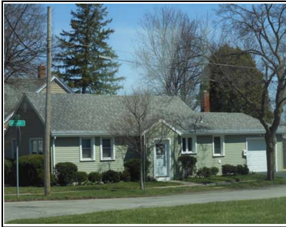
246 State St 180200 71.082-1-62

Neighborhood: 300 Property Class: 210 - 1 Family Res Sale Date: 9/24/2024 Sale Price: $ 140,000 Prelim 2025 Land Asmt: $ 9,500 Prelim 2025 Asmt: $ 122,000 Building Style: Ranch Exterior Wall: Stucco Year Built: 1947 Basement Type: Crawl Grade: Average Condition: Normal SFLA: 928 Sale Price/SFLA: $ 150.86 Number Bedrooms: 2 Number Baths: 1.0