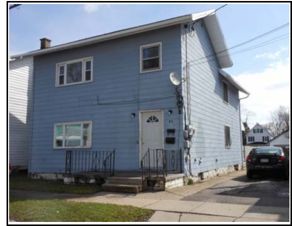
22 Columbia Ave 180200 84.043-1-25

Neighborhood: 300 Property Class: 210 - 1 Family Res Sale Date: 12/20/2024 Sale Price: $ 165,000 Prelim 2025 Land Asmt: $ 9,500 Prelim 2025 Asmt: $ 136,000 Building Style: Old Style Exterior Wall: Wood Year Built: 1900 Basement Type: Full Grade: Average Condition: Normal SFLA: 1,547 Sale Price/SFLA: $ 106.66 Number Bedrooms: 4 Number Baths: 1.5