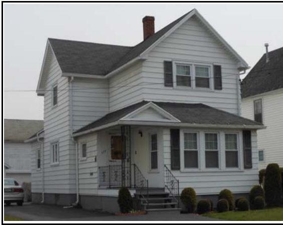
117 Hutchins St 180200 84.082-1-31

Neighborhood: 500 Property Class: 210 - 1 Family Res Sale Date: 4/24/2023 Sale Price: $ 120,000 Prelim 2025 Land Asmt: $ 11,700 Prelim 2025 Asmt: $ 128,000 Building Style: Old Style Exterior Wall: Alum/vinyl Year Built: 1880 Basement Type: Full Grade: Average Condition: Normal SFLA: 1,441 Sale Price/SFLA: $ 83.28 Number Bedrooms: 3 Number Baths: 1.0