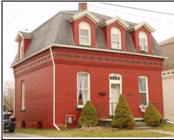
11 James St 180200 97.007-1-14

Neighborhood: 500 Property Class: 210 - 1 Family Res Sale Date: 7/24/2023 Sale Price: $ 119,000 Prelim 2025 Land Asmt: $ 8,500 Prelim 2025 Asmt: $ 125,000 Building Style: Old Style Exterior Wall: Alum/vinyl Year Built: 1920 Basement Type: Full Grade: Average Condition: Normal SFLA: 1,144 Sale Price/SFLA: $ 104.02 Number Bedrooms: 3 Number Baths: 1.0