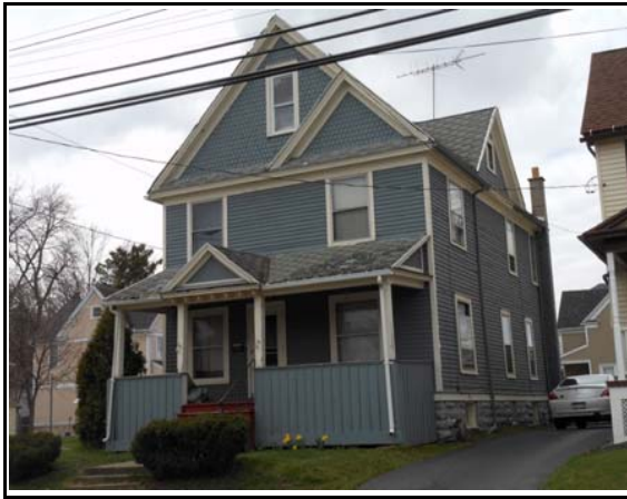
131 Ross St 180200 84.034-3-28

Neighborhood: 300 Property Class: 210 - 1 Family Res Sale Date: 2/8/2024 Sale Price: $ 60,000 Prelim 2025 Land Asmt: $ 9,300 Prelim 2025 Asmt: $ 113,000 Building Style: Old Style Exterior Wall: Wood Year Built: 1890 Basement Type: Full Grade: Average Condition: Normal SFLA: 1,776 Sale Price/SFLA: $ 33.78 Number Bedrooms: 4 Number Baths: 1.0