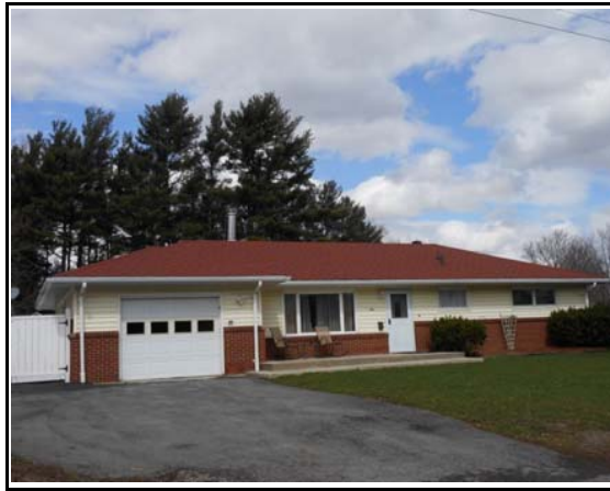
1 Farwell Dr 180200 84.008-1-74

Neighborhood: 200 Property Class: 210 - 1 Family Res Sale Date: 9/27/2024 Sale Price: $ 209,000 Prelim 2025 Land Asmt: $ 18,300 Prelim 2025 Asmt: $ 210,000 Building Style: Ranch Exterior Wall: Alum/vinyl Year Built: 1955 Basement Type: Full Grade: Average Condition: Normal SFLA: 1,380 Sale Price/SFLA: $ 151.45 Number Bedrooms: 2 Number Baths: 1.5