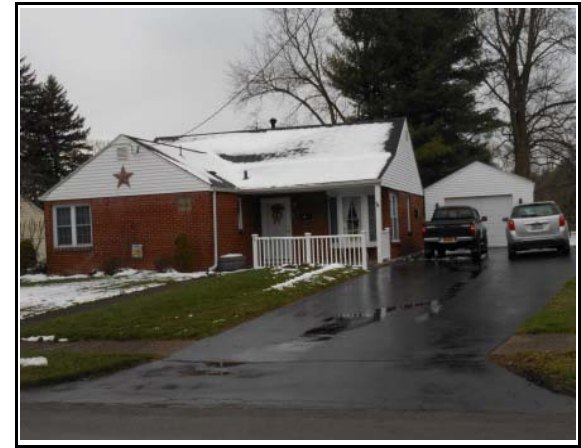
3 Grandview Ter 180200 85.009-2-46

Neighborhood: 200 Property Class: 210 - 1 Family Res Sale Date: 2/1/2023 Sale Price: $ 130,000 Prelim 2025 Land Asmt: $ 16,400 Prelim 2025 Asmt: $ 158,000 Building Style: Ranch Exterior Wall: Alum/vinyl Year Built: 1962 Basement Type: Full Grade: Average Condition: Normal SFLA: 1,040 Sale Price/SFLA: $ 125.00 Number Bedrooms: 2 Number Baths: 1.5