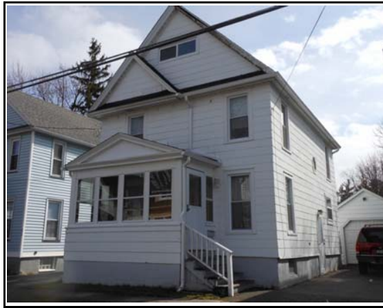
58 Columbia Ave 180200 84.035-1-29

Neighborhood: 300 Property Class: 210 - 1 Family Res Sale Date: 7/6/2023 Sale Price: $ 169,000 Prelim 2025 Land Asmt: $ 13,500 Prelim 2025 Asmt: $ 190,000 Building Style: Old Style Exterior Wall: Alum/vinyl Year Built: 1880 Basement Type: Full Grade: Average Condition: Normal SFLA: 1,155 Sale Price/SFLA: $ 146.32 Number Bedrooms: 3 Number Baths: 1.0