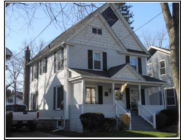
14 Franklin St 180200 84.047-2-22

Neighborhood: 500 Property Class: 210 - 1 Family Res Sale Date: 3/8/2024 Sale Price: $ 190,000 Prelim 2025 Land Asmt: $ 18,000 Prelim 2025 Asmt: $ 197,000 Building Style: Old Style Exterior Wall: Alum/vinyl Year Built: 1910 Basement Type: Partial Grade: Average Condition: Normal SFLA: 1,320 Sale Price/SFLA: $ 143.94 Number Bedrooms: 2 Number Baths: 1.5