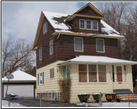
113 Trumbull Pkwy 180200 84.043-2-33

Neighborhood: 200 Property Class: 210 - 1 Family Res Sale Date: 6/3/2024 Sale Price: $ 189,900 Prelim 2025 Land Asmt: $ 19,600 Prelim 2025 Asmt: $ 171,000 Building Style: Old Style Exterior Wall: Wood Year Built: 1915 Basement Type: Full Grade: Average Condition: Normal SFLA: 1,232 Sale Price/SFLA: $ 154.14 Number Bedrooms: 2 Number Baths: 1.0