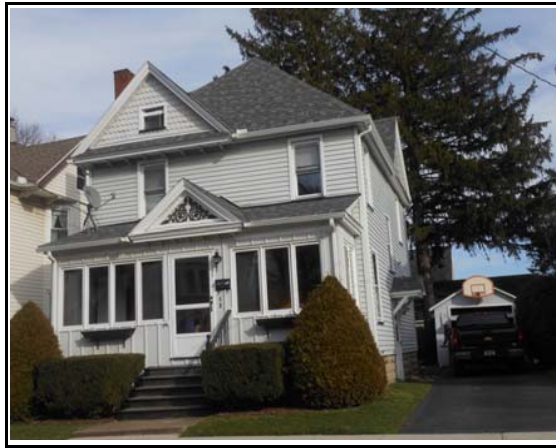
6 Lincoln Ave 180200 84.032-2-24

Neighborhood: 200 Property Class: 210 - 1 Family Res Sale Date: 9/20/2024 Sale Price: $ 180,000 Prelim 2025 Land Asmt: $ 15,600 Prelim 2025 Asmt: $ 174,000 Building Style: Old Style Exterior Wall: Wood Year Built: 1928 Basement Type: Full Grade: Average Condition: Normal SFLA: 1,320 Sale Price/SFLA: $ 136.36 Number Bedrooms: 3 Number Baths: 1.5