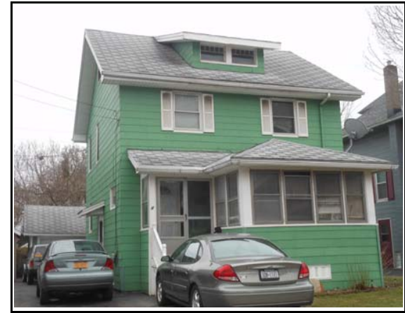
4 Union St 180200 84.031-1-37

Neighborhood: 300 Property Class: 210 - 1 Family Res Sale Date: 8/12/2023 Sale Price: $ 93,500 Prelim 2025 Land Asmt: $ 12,000 Prelim 2025 Asmt: $ 125,000 Building Style: Old Style Exterior Wall: Wood Year Built: 1880 Basement Type: Partial Grade: Average Condition: Fair SFLA: 1,248 Sale Price/SFLA: $ 74.92 Number Bedrooms: 3 Number Baths: 1.5