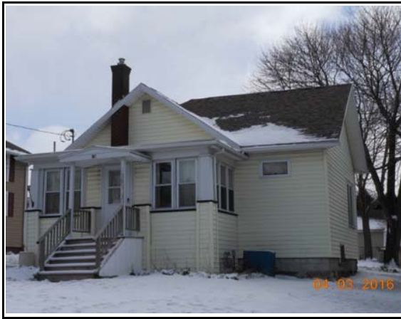
10 Trumbull Pkwy 180200 84.012-3-62

Neighborhood: 700 Property Class: 210 - 1 Family Res Sale Date: 8/9/2023 Sale Price: $ 130,000 Prelim 2025 Land Asmt: $ 14,700 Prelim 2025 Asmt: $ 142,000 Building Style: Old Style Exterior Wall: Alum/vinyl Year Built: 1925 Basement Type: Full Grade: Average Condition: Normal SFLA: 911 Sale Price/SFLA: $ 142.70 Number Bedrooms: 1 Number Baths: 1.0