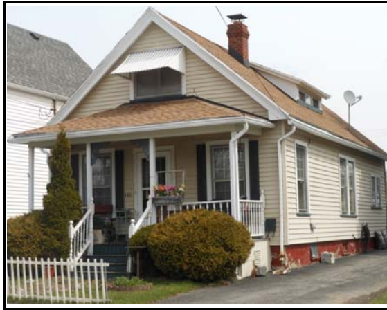
121 Hutchins St 180200 84.082-1-30

Neighborhood: 500 Property Class: 210 - 1 Family Res Sale Date: 2/27/2024 Sale Price: $ 365,000 Prelim 2025 Land Asmt: $ 18,900 Prelim 2025 Asmt: $ 294,000 Building Style: Split Level Exterior Wall: Brick Year Built: 1972 Basement Type: Full Grade: Average Condition: Normal SFLA: 3,753 Sale Price/SFLA: $ 97.26 Number Bedrooms: 5 Number Baths: 2.5