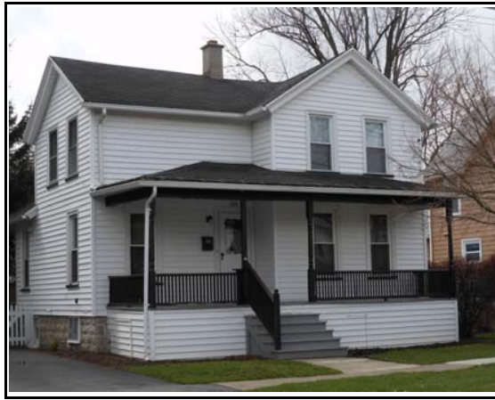
120 North St 180200 84.034-1-17

Neighborhood: 300 Property Class: 220 - 2 Family Res Sale Date: 9/25/2024 Sale Price: $ 129,000 Prelim 2025 Land Asmt: $ 10,600 Prelim 2025 Asmt: $ 132,000 Building Style: Old Style Exterior Wall: Alum/vinyl Year Built: 1910 Basement Type: Full Grade: Average Condition: Normal SFLA: 1,428 Sale Price/SFLA: $ 90.34 Number Bedrooms: 3 Number Baths: 2.0