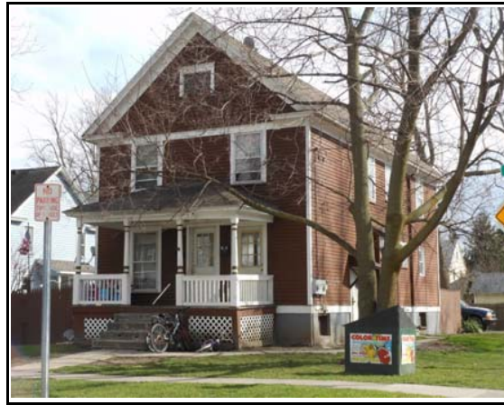
20 East Ave 180200 84.043-3-15

Neighborhood: 700 Property Class: 220 - 2 Family Res Sale Date: 5/31/2024 Sale Price: $ 164,900 Prelim 2025 Land Asmt: $ 14,000 Prelim 2025 Asmt: $ 143,000 Building Style: Old Style Exterior Wall: Alum/vinyl Year Built: 1900 Basement Type: Full Grade: Average Condition: Normal SFLA: 1,757 Sale Price/SFLA: $ 93.85 Number Bedrooms: 3 Number Baths: 2.0