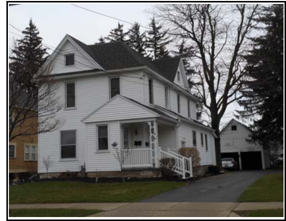
224 State St 180200 84.025-1-53

Neighborhood: 300 Property Class: 210 - 1 Family Res Sale Date: 3/1/2024 Sale Price: $ 170,000 Prelim 2025 Land Asmt: $ 12,800 Prelim 2025 Asmt: $ 183,000 Building Style: Old Style Exterior Wall: Alum/vinyl Year Built: 1915 Basement Type: Full Grade: Average Condition: Normal SFLA: 1,976 Sale Price/SFLA: $ 86.03 Number Bedrooms: 4 Number Baths: 1.5