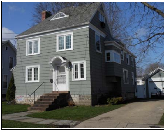
7 Tracy Ave 180200 84.042-1-55

Neighborhood: 300 Property Class: 210 - 1 Family Res Sale Date: 1/10/2023 Sale Price: $ 149,900 Prelim 2025 Land Asmt: $ 15,000 Prelim 2025 Asmt: $ 187,000 Building Style: Old Style Exterior Wall: Wood Year Built: 1930 Basement Type: Full Grade: Average Condition: Fair SFLA: 2,134 Sale Price/SFLA: $ 70.24 Number Bedrooms: 5 Number Baths: 2.5