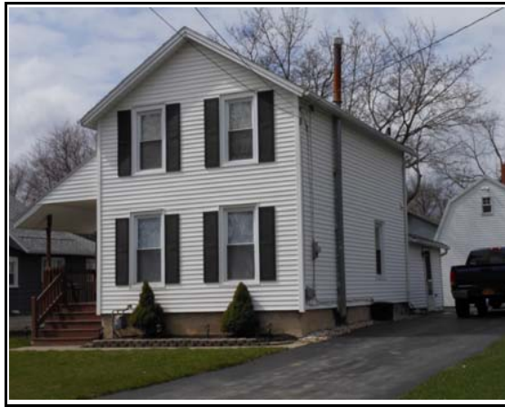
145 Vine St 180200 84.035-1-16

Neighborhood: 200 Property Class: 210 - 1 Family Res Sale Date: 11/2/2023 Sale Price: $ 145,000 Prelim 2025 Land Asmt: $ 16,500 Prelim 2025 Asmt: $ 161,000 Building Style: Old Style Exterior Wall: Alum/vinyl Year Built: 1910 Basement Type: Full Grade: Average Condition: Normal SFLA: 1,208 Sale Price/SFLA: $ 120.03 Number Bedrooms: 3 Number Baths: 1.0