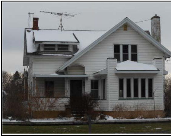
56 Clinton St 180200 85.009-2-1

Neighborhood: 200 Property Class: 210 - 1 Family Res Sale Date: 12/12/2024 Sale Price: $ 277,500 Prelim 2025 Land Asmt: $ 37,800 Prelim 2025 Asmt: $ 262,000 Building Style: Old Style Exterior Wall: Alum/vinyl Year Built: 1894 Basement Type: Full Grade: Average Condition: Normal SFLA: 1,983 Sale Price/SFLA: $ 139.94 Number Bedrooms: 3 Number Baths: 2.0