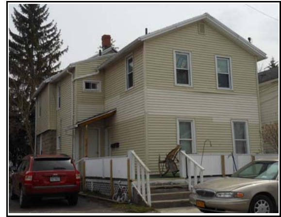
7 Hutchins St 180200 84.066-2-44.1

Neighborhood: 500 Property Class: 220 - 2 Family Res Sale Date: 11/1/2023 Sale Price: $ 95,000 Prelim 2025 Land Asmt: $ 14,300 Prelim 2025 Asmt: $ 99,000 Building Style: Old Style Exterior Wall: Alum/vinyl Year Built: 1890 Basement Type: Full Grade: Average Condition: Fair SFLA: 1,717 Sale Price/SFLA: $ 55.33 Number Bedrooms: 3 Number Baths: 2.0