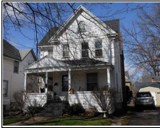
13 Manhattan Ave 180200 84.035-1-65

Neighborhood: 300 Property Class: 210 - 1 Family Res Sale Date: 4/3/2024 Sale Price: $ 149,900 Prelim 2025 Land Asmt: $ 11,200 Prelim 2025 Asmt: $ 146,000 Building Style: Old Style Exterior Wall: Alum/vinyl Year Built: 1900 Basement Type: Full Grade: Average Condition: Normal SFLA: 1,488 Sale Price/SFLA: $ 100.74 Number Bedrooms: 3 Number Baths: 1.0