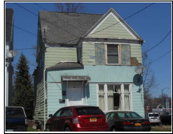
44 South Main St 180200 84.039-2-11

Neighborhood: 500 Property Class: 220 - 2 Family Res Sale Date: 8/31/2023 Sale Price: $ 105,000 Prelim 2025 Land Asmt: $ 14,600 Prelim 2025 Asmt: $ 128,000 Building Style: Old Style Exterior Wall: Alum/vinyl Year Built: 1900 Basement Type: Full Grade: Average Condition: Poor SFLA: 1,946 Sale Price/SFLA: $ 53.96 Number Bedrooms: 3 Number Baths: 2.0