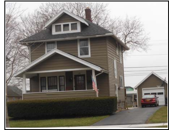
59 Redfield Pkwy 180200 71.017-2-39

Neighborhood: 400 Property Class: 210 - 1 Family Res Sale Date: 7/10/2023 Sale Price: $ 357,100 Prelim 2025 Land Asmt: $ 28,000 Prelim 2025 Asmt: $ 386,000 Building Style: Colonial Exterior Wall: Alum/vinyl Year Built: 1955 Basement Type: Full Grade: Average Condition: Normal SFLA: 2,772 Sale Price/SFLA: $ 128.82 Number Bedrooms: 4 Number Baths: 1.5