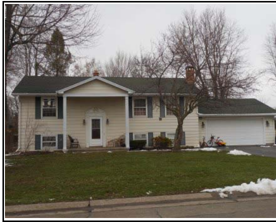
5 Hillside Dr 180200 84.012-2-49

Neighborhood: 100 Property Class: 210 - 1 Family Res Sale Date: 10/16/2023 Sale Price: $ 385,900 Prelim 2025 Land Asmt: $ 31,600 Prelim 2025 Asmt: $ 415,000 Building Style: Ranch Exterior Wall: Brick Year Built: 1988 Basement Type: Full Grade: Good Condition: Good SFLA: 2,094 Sale Price/SFLA: $ 184.29 Number Bedrooms: 3 Number Baths: 2.0