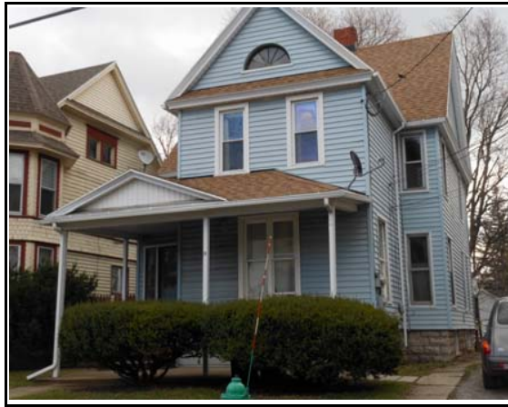
24 Tracy Ave 180200 84.042-1-44

Neighborhood: 300 Property Class: 210 - 1 Family Res Sale Date: 1/10/2023 Sale Price: $ 149,900 Prelim 2025 Land Asmt: $ 15,000 Prelim 2025 Asmt: $ 187,000 Building Style: Old Style Exterior Wall: Wood Year Built: 1930 Basement Type: Full Grade: Average Condition: Fair SFLA: 2,134 Sale Price/SFLA: $ 70.24 Number Bedrooms: 5 Number Baths: 2.5