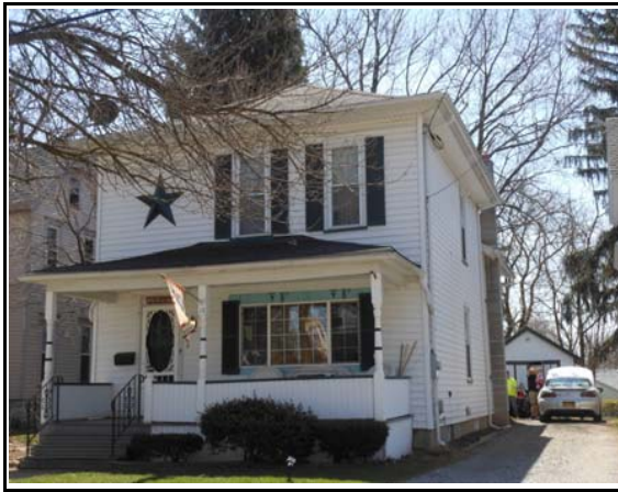
12 Wood St 180200 84.065-2-38

Neighborhood: 500 Property Class: 210 - 1 Family Res Sale Date: 12/18/2023 Sale Price: $ 130,000 Prelim 2025 Land Asmt: $ 15,000 Prelim 2025 Asmt: $ 146,000 Building Style: Old Style Exterior Wall: Alum/vinyl Year Built: 1900 Basement Type: Full Grade: Average Condition: Normal SFLA: 1,760 Sale Price/SFLA: $ 73.86 Number Bedrooms: 3 Number Baths: 2.0