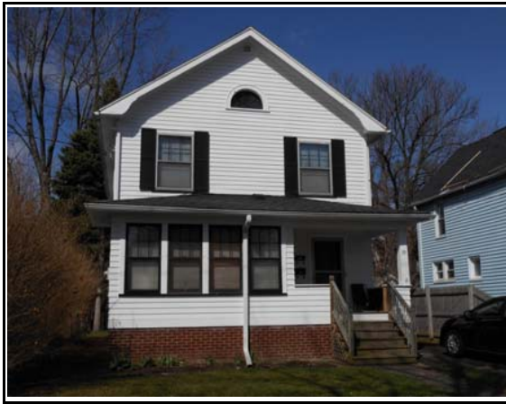
33 Manhattan Ave 180200 84.035-1-57

Neighborhood: 300 Property Class: 220 - 2 Family Res Sale Date: 2/28/2024 Sale Price: $ 160,000 Prelim 2025 Land Asmt: $ 9,500 Prelim 2025 Asmt: $ 119,000 Building Style: Old Style Exterior Wall: Wood Year Built: 1900 Basement Type: Full Grade: Average Condition: Normal SFLA: 2,162 Sale Price/SFLA: $ 74.01 Number Bedrooms: 4 Number Baths: 2.0