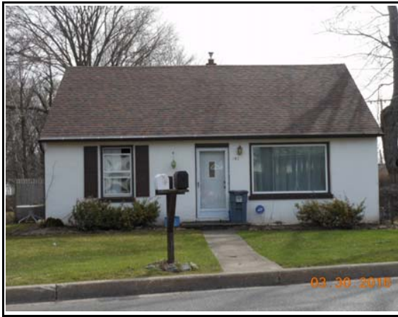
288 Bank St 180200 71.083-1-1

Neighborhood: 200 Property Class: 210 - 1 Family Res Sale Date: 1/17/2023 Sale Price: $ 129,900 Prelim 2025 Land Asmt: $ 17,500 Prelim 2025 Asmt: $ 145,000 Building Style: Cape Cod Exterior Wall: Concrete Year Built: 1953 Basement Type: Slab/pier Grade: Average Condition: Normal SFLA: 1,448 Sale Price/SFLA: $ 89.71 Number Bedrooms: 4 Number Baths: 1.0