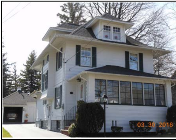
2 Hart St 180200 84.025-1-2

Neighborhood: 200 Property Class: 210 - 1 Family Res Sale Date: 3/3/2023 Sale Price: $ 176,500 Prelim 2025 Land Asmt: $ 11,500 Prelim 2025 Asmt: $ 191,000 Building Style: Old Style Exterior Wall: Wood Year Built: 1910 Basement Type: Full Grade: Average Condition: Normal SFLA: 1,584 Sale Price/SFLA: $ 111.43 Number Bedrooms: 3 Number Baths: 1.0