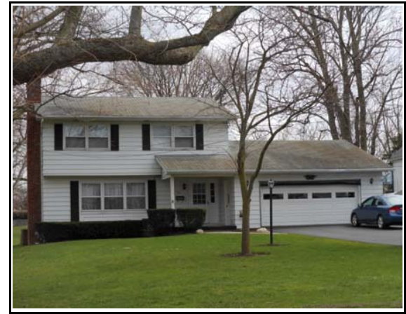
164 Vine St 180200 84.008-1-36

Neighborhood: 200 Property Class: 210 - 1 Family Res Sale Date: 12/8/2023 Sale Price: $ 271,101 Prelim 2025 Land Asmt: $ 18,500 Prelim 2025 Asmt: $ 254,000 Building Style: Colonial Exterior Wall: Alum/vinyl Year Built: 1978 Basement Type: Full Grade: Average Condition: Normal SFLA: 1,732 Sale Price/SFLA: $ 156.52 Number Bedrooms: 4 Number Baths: 1.5