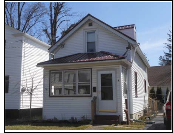
4 Holland Ave 180200 84.039-2-28

Neighborhood: 300 Property Class: 210 - 1 Family Res Sale Date: 12/8/2023 Sale Price: $ 153,000 Prelim 2025 Land Asmt: $ 17,000 Prelim 2025 Asmt: $ 138,000 Building Style: Cape Cod Exterior Wall: Alum/vinyl Year Built: 1951 Basement Type: Full Grade: Average Condition: Normal SFLA: 1,401 Sale Price/SFLA: $ 109.21 Number Bedrooms: 3 Number Baths: 2.0