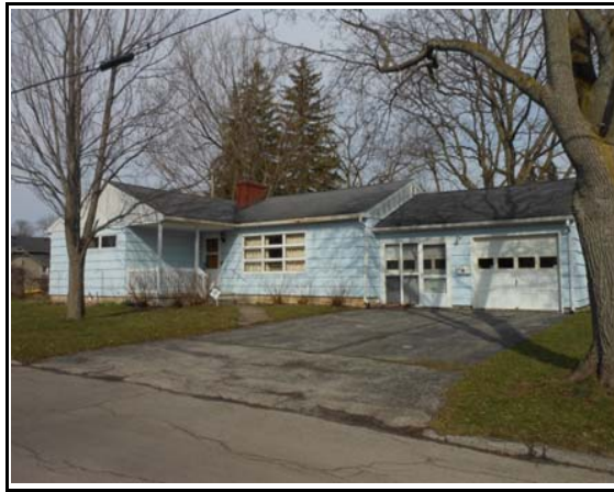
30-32 Warren St 180200 84.073-2-36

Neighborhood: 500 Property Class: 210 - 1 Family Res Sale Date: 1/23/2023 Sale Price: $ 149,000 Prelim 2025 Land Asmt: $ 14,400 Prelim 2025 Asmt: $ 161,000 Building Style: Ranch Exterior Wall: Alum/vinyl Year Built: 1960 Basement Type: Full Grade: Average Condition: Normal SFLA: 1,212 Sale Price/SFLA: $ 122.94 Number Bedrooms: 3 Number Baths: 1.0