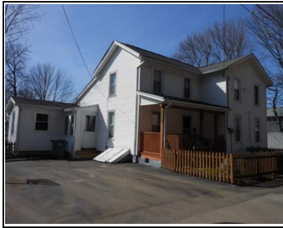
2 Thorp St 180200 84.057-1-5.1

Neighborhood: 500 Property Class: 230 - 3 Family Res Sale Date: 4/17/2024 Sale Price: $ 182,000 Prelim 2025 Land Asmt: $ 13,000 Prelim 2025 Asmt: $ 169,000 Building Style: Old Style Exterior Wall: Alum/vinyl Year Built: 1925 Basement Type: Partial Grade: Average Condition: Normal SFLA: 1,711 Sale Price/SFLA: $ 106.37 Number Bedrooms: 5 Number Baths: 3.0