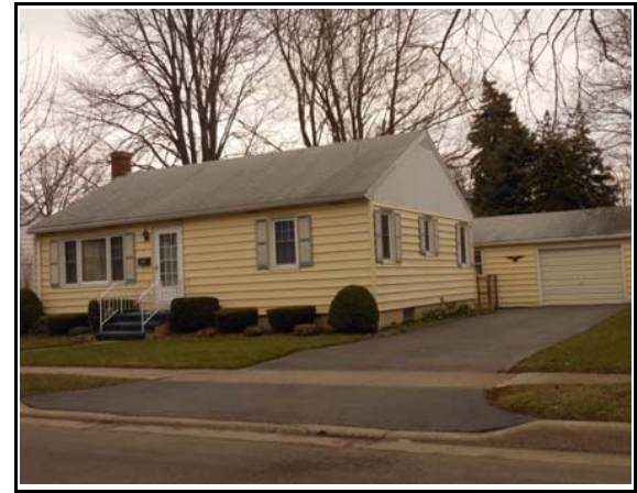
11 Linwood Ave 180200 84.020-3-40

Neighborhood: 500 Property Class: 210 - 1 Family Res Sale Date: 11/18/2024 Sale Price: $ 90,000 Prelim 2025 Land Asmt: $ 16,600 Prelim 2025 Asmt: $ 118,000 Building Style: Ranch Exterior Wall: Alum/vinyl Year Built: 1963 Basement Type: Full Grade: Economy Condition: Fair SFLA: 875 Sale Price/SFLA: $ 102.86 Number Bedrooms: 3 Number Baths: 1.0