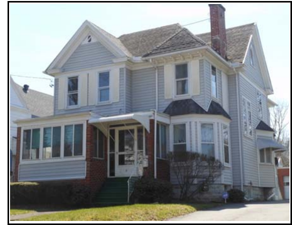
6 Highland Park 180200 84.065-2-4

Neighborhood: 500 Property Class: 210 - 1 Family Res Sale Date: 10/19/2023 Sale Price: $ 115,000 Prelim 2025 Land Asmt: $ 9,700 Prelim 2025 Asmt: $ 121,000 Building Style: Old Style Exterior Wall: Composition Year Built: 1890 Basement Type: Full Grade: Average Condition: Fair SFLA: 2,024 Sale Price/SFLA: $ 56.82 Number Bedrooms: 4 Number Baths: 1.0