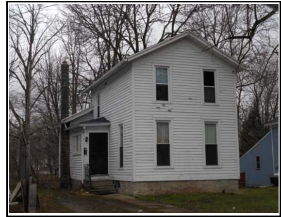
123 State St 180200 84.007-1-15

Neighborhood: 700 Property Class: 210 - 1 Family Res Sale Date: 9/18/2023 Sale Price: $ 135,000 Prelim 2025 Land Asmt: $ 16,800 Prelim 2025 Asmt: $ 142,000 Building Style: Old Style Exterior Wall: Wood Year Built: 1910 Basement Type: Full Grade: Average Condition: Good SFLA: 1,296 Sale Price/SFLA: $ 104.17 Number Bedrooms: 3 Number Baths: 1.0