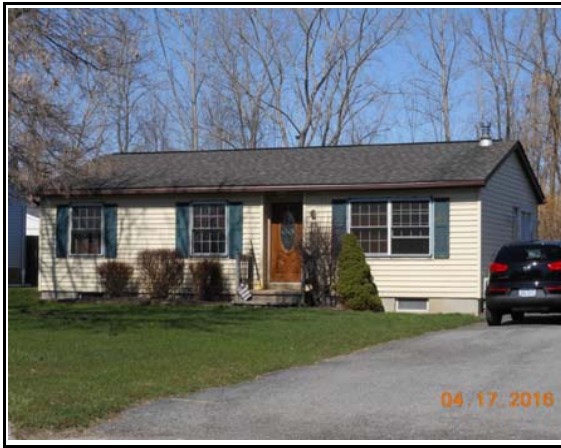
66 River St 180200 84.009-1-21

Neighborhood: 500 Property Class: 210 - 1 Family Res Sale Date: 9/27/2023 Sale Price: $ 165,000 Prelim 2025 Land Asmt: $ 17,300 Prelim 2025 Asmt: $ 177,000 Building Style: Ranch Exterior Wall: Alum/vinyl Year Built: 1988 Basement Type: Full Grade: Average Condition: Normal SFLA: 960 Sale Price/SFLA: $ 171.88 Number Bedrooms: 3 Number Baths: 1.0