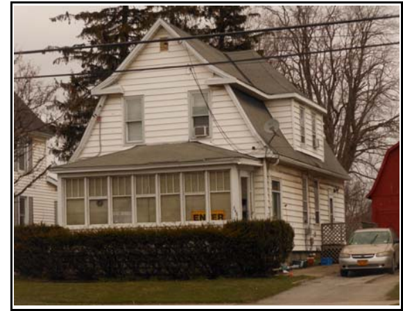
348 West Main St 180200 84.005-2-18

Neighborhood: 300 Property Class: 210 - 1 Family Res Sale Date: 11/20/2023 Sale Price: $ 215,000 Prelim 2025 Land Asmt: $ 14,300 Prelim 2025 Asmt: $ 234,000 Building Style: Old Style Exterior Wall: Wood Year Built: 1900 Basement Type: Full Grade: Average Condition: Good SFLA: 1,628 Sale Price/SFLA: $ 132.06 Number Bedrooms: 4 Number Baths: 1.5