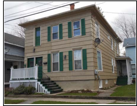
4 Tracy Ave 180200 84.042-1-34

Neighborhood: 300 Property Class: 230 - 3 Family Res Sale Date: 8/8/2023 Sale Price: $ 120,000 Prelim 2025 Land Asmt: $ 10,400 Prelim 2025 Asmt: $ 137,000 Building Style: Old Style Exterior Wall: Alum/vinyl Year Built: 1900 Basement Type: Full Grade: Average Condition: Fair SFLA: 2,140 Sale Price/SFLA: $ 56.07 Number Bedrooms: 6 Number Baths: 3.5