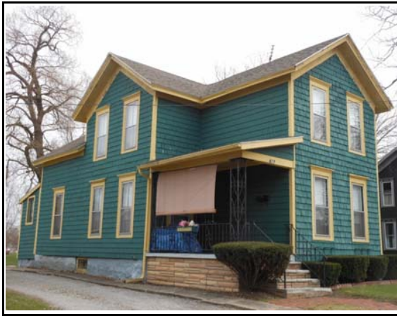
617 Ellicott St 180200 84.084-1-27

Neighborhood: 600 Property Class: 210 - 1 Family Res Sale Date: 2/2/2024 Sale Price: $ 40,000 Prelim 2025 Land Asmt: $ 18,700 Prelim 2025 Asmt: $ 105,000 Building Style: Old Style Exterior Wall: Wood Year Built: 1870 Basement Type: Full Grade: Average Condition: Poor SFLA: 1,162 Sale Price/SFLA: $ 34.42 Number Bedrooms: 3 Number Baths: 1.0