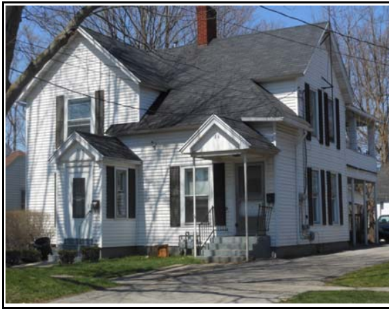
86 South Main St 180200 84.039-1-32

Neighborhood: 500 Property Class: 220 - 2 Family Res Sale Date: 5/24/2023 Sale Price: $ 109,900 Prelim 2025 Land Asmt: $ 15,400 Prelim 2025 Asmt: $ 116,000 Building Style: Old Style Exterior Wall: Alum/vinyl Year Built: 1900 Basement Type: Full Grade: Average Condition: Fair SFLA: 1,936 Sale Price/SFLA: $ 56.77 Number Bedrooms: 3 Number Baths: 2.0