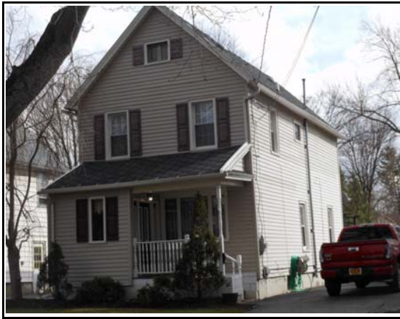
108 East Ave 180200 84.043-3-23

Neighborhood: 700 Property Class: 210 - 1 Family Res Sale Date: 2/26/2024 Sale Price: $ 145,000 Prelim 2025 Land Asmt: $ 14,000 Prelim 2025 Asmt: $ 161,000 Building Style: Old Style Exterior Wall: Alum/vinyl Year Built: 1900 Basement Type: Crawl Grade: Average Condition: Good SFLA: 1,308 Sale Price/SFLA: $ 110.86 Number Bedrooms: 3 Number Baths: 1.0