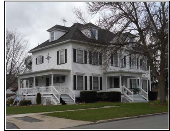
2 North St 180200 84.033-2-1

Neighborhood: 300 Property Class: 220 - 2 Family Res Sale Date: 10/29/2024 Sale Price: $ 106,500 Prelim 2025 Land Asmt: $ 17,600 Prelim 2025 Asmt: $ 124,000 Building Style: Old Style Exterior Wall: Composition Year Built: 1880 Basement Type: Full Grade: Average Condition: Fair SFLA: 2,894 Sale Price/SFLA: $ 36.80 Number Bedrooms: 6 Number Baths: 2.0