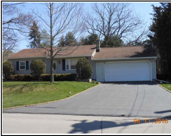
23 Dewey Ave 180200 84.009-2-22

Neighborhood: 500 Property Class: 210 - 1 Family Res Sale Date: 3/6/2024 Sale Price: $ 185,000 Prelim 2025 Land Asmt: $ 12,700 Prelim 2025 Asmt: $ 181,000 Building Style: Ranch Exterior Wall: Alum/vinyl Year Built: 1956 Basement Type: Full Grade: Average Condition: Normal SFLA: 1,056 Sale Price/SFLA: $ 175.19 Number Bedrooms: 3 Number Baths: 1.0