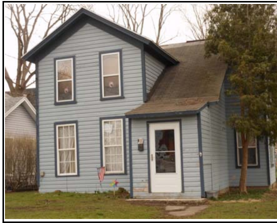
19 Mckinley Ave 180200 84.059-2-43

Neighborhood: 600 Property Class: 210 - 1 Family Res Sale Date: 1/23/2024 Sale Price: $ 93,000 Prelim 2025 Land Asmt: $ 13,700 Prelim 2025 Asmt: $ 77,000 Building Style: Old Style Exterior Wall: Alum/vinyl Year Built: 1874 Basement Type: Full Grade: Average Condition: Fair SFLA: 1,232 Sale Price/SFLA: $ 75.49 Number Bedrooms: 4 Number Baths: 1.0