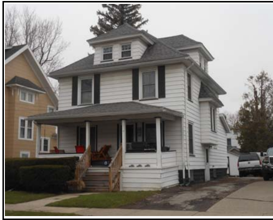
15 Vernon Ave 180200 84.031-1-7

Neighborhood: 200 Property Class: 210 - 1 Family Res Sale Date: 3/3/2023 Sale Price: $ 176,500 Prelim 2025 Land Asmt: $ 11,500 Prelim 2025 Asmt: $ 191,000 Building Style: Old Style Exterior Wall: Wood Year Built: 1910 Basement Type: Full Grade: Average Condition: Normal SFLA: 1,584 Sale Price/SFLA: $ 111.43 Number Bedrooms: 3 Number Baths: 1.0