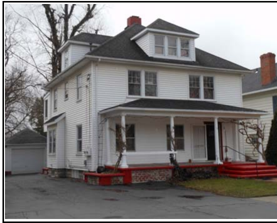
18 Park Ave 180200 84.033-1-2

Neighborhood: 200 Property Class: 210 - 1 Family Res Sale Date: 12/12/2024 Sale Price: $ 277,500 Prelim 2025 Land Asmt: $ 37,800 Prelim 2025 Asmt: $ 262,000 Building Style: Old Style Exterior Wall: Alum/vinyl Year Built: 1894 Basement Type: Full Grade: Average Condition: Normal SFLA: 1,983 Sale Price/SFLA: $ 139.94 Number Bedrooms: 3 Number Baths: 2.0