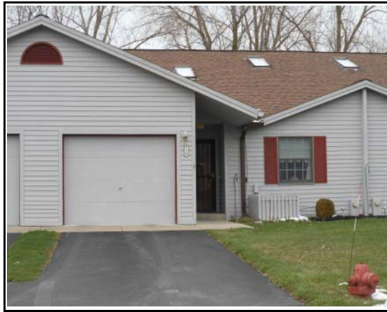
13 North Pointe Dr 180200 84.008-2-82

Neighborhood: 100 Property Class: 210 - 1 Family Res Sale Date: 8/21/2024 Sale Price: $ 425,000 Prelim 2025 Land Asmt: $ 41,600 Prelim 2025 Asmt: $ 412,000 Building Style: Contemp Exterior Wall: Brick Year Built: 1999 Basement Type: Partial Grade: Good Condition: Normal SFLA: 3,092 Sale Price/SFLA: $ 137.45 Number Bedrooms: 4 Number Baths: 2.5