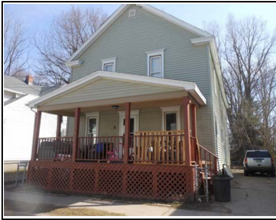
5 Watson St 180200 84.065-1-9

Neighborhood: 500 Property Class: 220 - 2 Family Res Sale Date: 11/17/2023 Sale Price: $ 75,000 Prelim 2025 Land Asmt: $ 10,600 Prelim 2025 Asmt: $ 89,000 Building Style: Old Style Exterior Wall: Wood Year Built: 1890 Basement Type: Full Grade: Average Condition: Poor SFLA: 2,016 Sale Price/SFLA: $ 37.20 Number Bedrooms: 4 Number Baths: 2.0