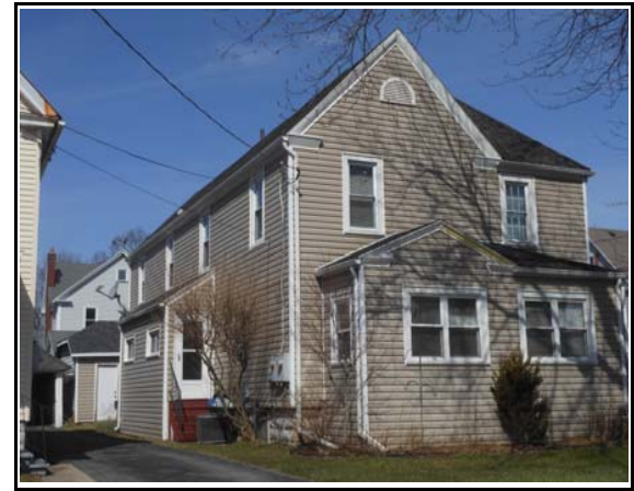
57 Montclair Ave 180200 84.024-1-49

Neighborhood: 300 Property Class: 220 - 2 Family Res Sale Date: 3/21/2024 Sale Price: $ 70,000 Prelim 2025 Land Asmt: $ 14,500 Prelim 2025 Asmt: $ 125,000 Building Style: Old Style Exterior Wall: Composition Year Built: 1900 Basement Type: Full Grade: Average Condition: Poor SFLA: 2,424 Sale Price/SFLA: $ 28.88 Number Bedrooms: 4 Number Baths: 2.0