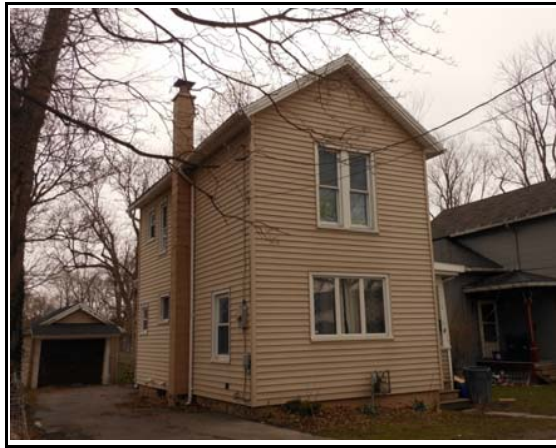
1 Prune St 180200 84.059-2-25

Neighborhood: 600 Property Class: 210 - 1 Family Res Sale Date: 11/14/2023 Sale Price: $ 130,000 Prelim 2025 Land Asmt: $ 3,800 Prelim 2025 Asmt: $ 133,000 Building Style: Old Style Exterior Wall: Composition Year Built: 1900 Basement Type: Full Grade: Average Condition: Normal SFLA: 1,350 Sale Price/SFLA: $ 96.30 Number Bedrooms: 5 Number Baths: 1.0