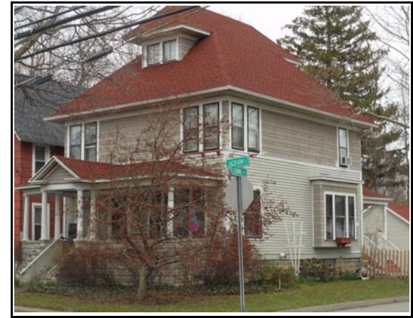
157 Jackson St 180200 84.073-1-13

Neighborhood: 500 Property Class: 210 - 1 Family Res Sale Date: 2/27/2024 Sale Price: $ 135,000 Prelim 2025 Land Asmt: $ 15,000 Prelim 2025 Asmt: $ 122,000 Building Style: Old Style Exterior Wall: Alum/vinyl Year Built: 1900 Basement Type: Full Grade: Average Condition: Normal SFLA: 1,706 Sale Price/SFLA: $ 79.13 Number Bedrooms: 4 Number Baths: 2.0