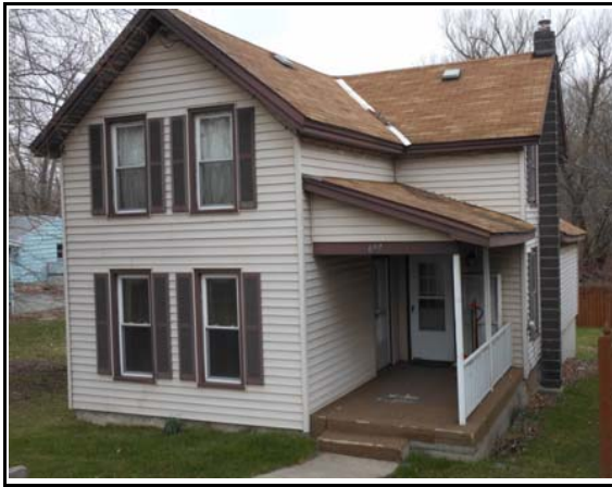
697 East Main St 180200 85.013-1-27

Neighborhood: 600 Property Class: 210 - 1 Family Res Sale Date: 11/14/2023 Sale Price: $ 130,000 Prelim 2025 Land Asmt: $ 3,800 Prelim 2025 Asmt: $ 133,000 Building Style: Old Style Exterior Wall: Composition Year Built: 1900 Basement Type: Full Grade: Average Condition: Normal SFLA: 1,350 Sale Price/SFLA: $ 96.30 Number Bedrooms: 5 Number Baths: 1.0