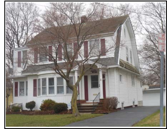
11 Woodrow Rd 180200 84.005-1-21.1

Neighborhood: 400 Property Class: 210 - 1 Family Res Sale Date: 10/25/2023 Sale Price: $ 235,000 Prelim 2025 Land Asmt: $ 33,800 Prelim 2025 Asmt: $ 254,000 Building Style: Old Style Exterior Wall: Alum/vinyl Year Built: 1926 Basement Type: Full Grade: Average Condition: Good SFLA: 1,800 Sale Price/SFLA: $ 130.56 Number Bedrooms: 3 Number Baths: 1.5