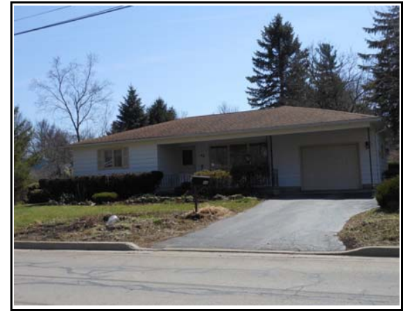
46 Ganson Ave 180200 84.073-1-9

Neighborhood: 500 Property Class: 210 - 1 Family Res Sale Date: 7/27/2023 Sale Price: $ 170,000 Prelim 2025 Land Asmt: $ 16,800 Prelim 2025 Asmt: $ 181,000 Building Style: Ranch Exterior Wall: Alum/vinyl Year Built: 1955 Basement Type: Full Grade: Average Condition: Good SFLA: 976 Sale Price/SFLA: $ 174.18 Number Bedrooms: 2 Number Baths: 1.0