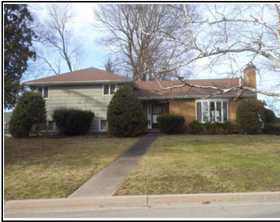
1 Pickthorn Dr 180200 71.018-3-57

Neighborhood: 200 Property Class: 210 - 1 Family Res Sale Date: 10/10/2023 Sale Price: $ 195,000 Prelim 2025 Land Asmt: $ 26,700 Prelim 2025 Asmt: $ 229,000 Building Style: Split Level Exterior Wall: Wood Year Built: 1955 Basement Type: Full Grade: Average Condition: Normal SFLA: 1,987 Sale Price/SFLA: $ 98.14 Number Bedrooms: 3 Number Baths: 1.5