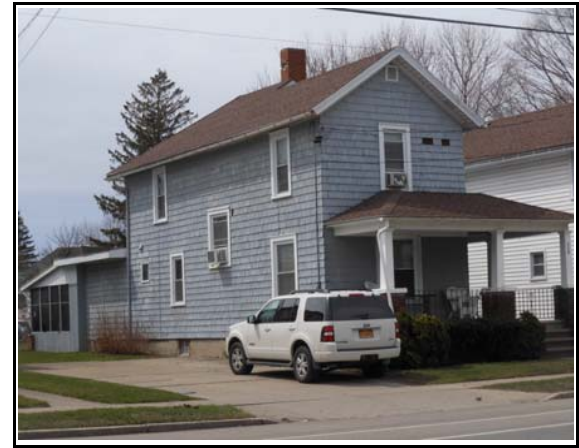
416 Ellicott St 180200 84.074-2-8

Neighborhood: 600 Property Class: 220 - 2 Family Res Sale Date: 6/28/2023 Sale Price: $ 122,000 Prelim 2025 Land Asmt: $ 17,400 Prelim 2025 Asmt: $ 126,000 Building Style: Old Style Exterior Wall: Alum/vinyl Year Built: 1880 Basement Type: Full Grade: Average Condition: Fair SFLA: 1,506 Sale Price/SFLA: $ 81.01 Number Bedrooms: 2 Number Baths: 2.0