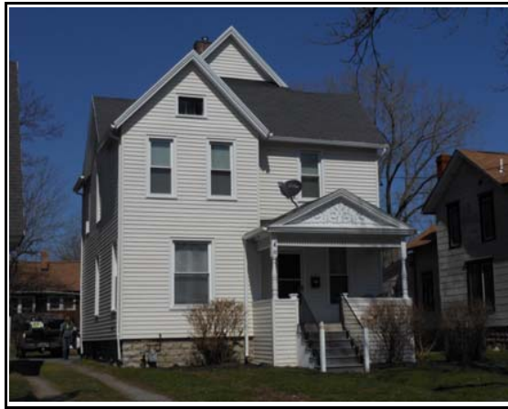
50 Walnut St 180200 84.055-1-16

Neighborhood: 500 Property Class: 220 - 2 Family Res Sale Date: 11/17/2023 Sale Price: $ 75,000 Prelim 2025 Land Asmt: $ 10,600 Prelim 2025 Asmt: $ 89,000 Building Style: Old Style Exterior Wall: Wood Year Built: 1890 Basement Type: Full Grade: Average Condition: Poor SFLA: 2,016 Sale Price/SFLA: $ 37.20 Number Bedrooms: 4 Number Baths: 2.0