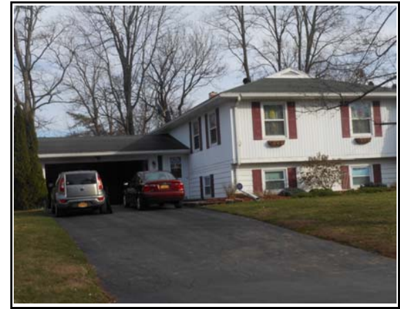
18 Pickthorn Dr 180200 71.018-3-43

Neighborhood: 200 Property Class: 220 - 2 Family Res Sale Date: 9/30/2024 Sale Price: $ 307,000 Prelim 2025 Land Asmt: $ 25,000 Prelim 2025 Asmt: $ 350,000 Building Style: Ranch Exterior Wall: Alum/vinyl Year Built: 1985 Basement Type: Full Grade: Average Condition: Normal SFLA: 2,582 Sale Price/SFLA: $ 118.90 Number Bedrooms: 4 Number Baths: 3.0