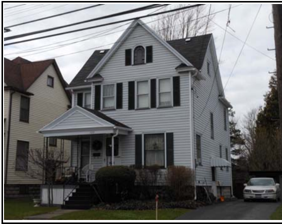
135 Ross St 180200 84.034-3-26

Neighborhood: 300 Property Class: 210 - 1 Family Res Sale Date: 4/3/2024 Sale Price: $ 149,900 Prelim 2025 Land Asmt: $ 11,200 Prelim 2025 Asmt: $ 146,000 Building Style: Old Style Exterior Wall: Alum/vinyl Year Built: 1900 Basement Type: Full Grade: Average Condition: Normal SFLA: 1,488 Sale Price/SFLA: $ 100.74 Number Bedrooms: 3 Number Baths: 1.0