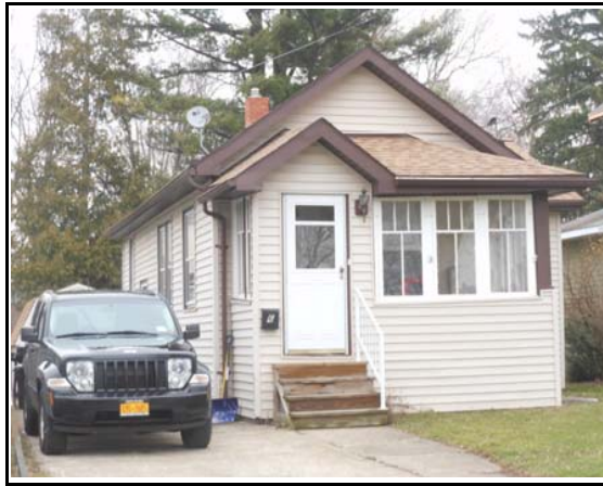
6 West Ave 180200 84.023-1-55

Neighborhood: 300 Property Class: 210 - 1 Family Res Sale Date: 5/20/2024 Sale Price: $ 125,000 Prelim 2025 Land Asmt: $ 17,600 Prelim 2025 Asmt: $ 135,000 Building Style: Old Style Exterior Wall: Composition Year Built: 1870 Basement Type: Full Grade: Average Condition: Poor SFLA: 3,300 Sale Price/SFLA: $ 37.88 Number Bedrooms: 4 Number Baths: 1.0