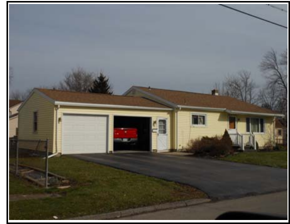
20-22 Warren St 180200 84.073-2-33

Neighborhood: 500 Property Class: 210 - 1 Family Res Sale Date: 2/2/2024 Sale Price: $ 129,500 Prelim 2025 Land Asmt: $ 16,600 Prelim 2025 Asmt: $ 155,000 Building Style: Ranch Exterior Wall: Alum/vinyl Year Built: 1970 Basement Type: Full Grade: Economy Condition: Normal SFLA: 1,056 Sale Price/SFLA: $ 122.63 Number Bedrooms: 3 Number Baths: 1.0