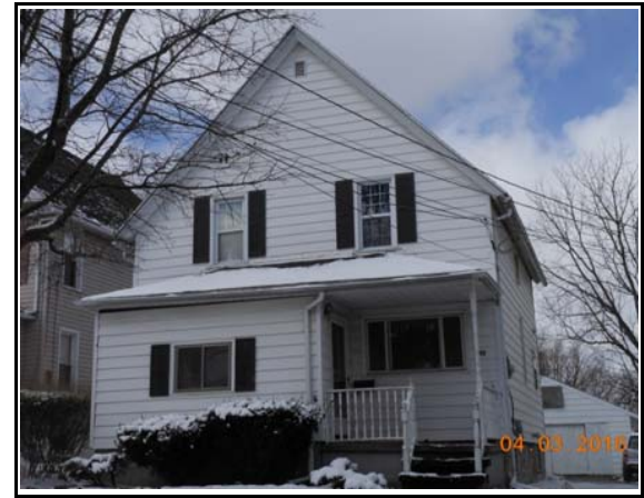
25 Trumbull Pkwy 180200 84.051-2-43

Neighborhood: 700 Property Class: 210 - 1 Family Res Sale Date: 9/30/2024 Sale Price: $ 230,000 Prelim 2025 Land Asmt: $ 12,700 Prelim 2025 Asmt: $ 189,400 Building Style: Old Style Exterior Wall: Alum/vinyl Year Built: 1940 Basement Type: Full Grade: Average Condition: Good SFLA: 1,443 Sale Price/SFLA: $ 159.39 Number Bedrooms: 4 Number Baths: 2.0