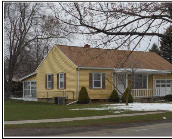
21 Clinton St 180200 84.012-3-41

Neighborhood: 200 Property Class: 210 - 1 Family Res Sale Date: 8/1/2024 Sale Price: $ 210,000 Prelim 2025 Land Asmt: $ 20,000 Prelim 2025 Asmt: $ 162,000 Building Style: Ranch Exterior Wall: Wood Year Built: 1953 Basement Type: Full Grade: Average Condition: Fair SFLA: 744 Sale Price/SFLA: $ 282.26 Number Bedrooms: 2 Number Baths: 2.0