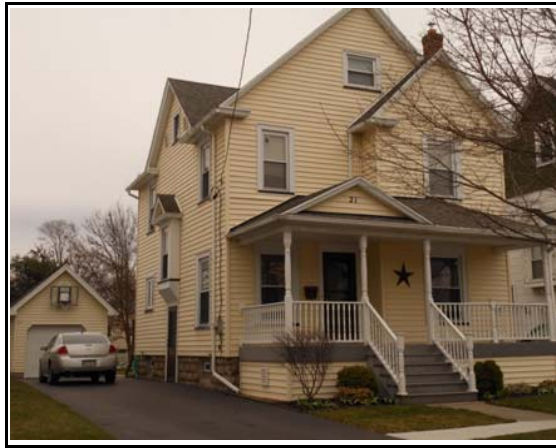
21 Otis St 180200 84.020-2-79

Neighborhood: 500 Property Class: 210 - 1 Family Res Sale Date: 3/27/2024 Sale Price: $ 150,000 Prelim 2025 Land Asmt: $ 11,200 Prelim 2025 Asmt: $ 163,000 Building Style: Old Style Exterior Wall: Wood Year Built: 1930 Basement Type: Full Grade: Average Condition: Normal SFLA: 1,264 Sale Price/SFLA: $ 118.67 Number Bedrooms: 3 Number Baths: 1.0