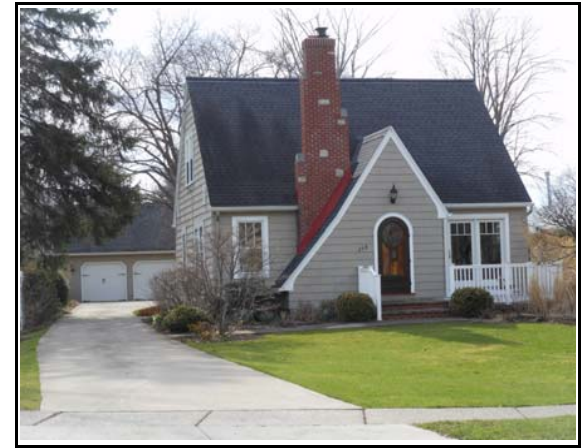
268 East Ave 180200 85.009-1-29

Neighborhood: 200 Property Class: 210 - 1 Family Res Sale Date: 5/12/2023 Sale Price: $ 180,000 Prelim 2025 Land Asmt: $ 15,600 Prelim 2025 Asmt: $ 215,000 Building Style: Cape Cod Exterior Wall: Alum/vinyl Year Built: 1930 Basement Type: Full Grade: Average Condition: Normal SFLA: 1,516 Sale Price/SFLA: $ 118.73 Number Bedrooms: 3 Number Baths: 2.0