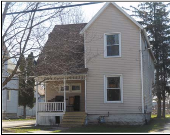
15 Walnut St 180200 84.010-4-15

Neighborhood: 500 Property Class: 210 - 1 Family Res Sale Date: 8/21/2024 Sale Price: $ 110,000 Prelim 2025 Land Asmt: $ 15,000 Prelim 2025 Asmt: $ 92,000 Building Style: Old Style Exterior Wall: Alum/vinyl Year Built: 1900 Basement Type: Full Grade: Average Condition: Fair SFLA: 1,992 Sale Price/SFLA: $ 55.22 Number Bedrooms: 5 Number Baths: 2.0