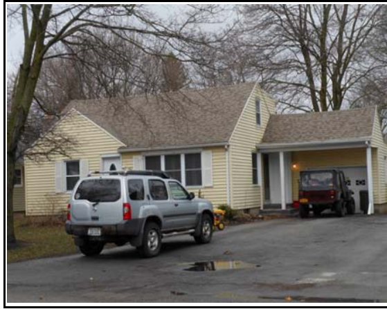
247 State St 180200 71.019-1-30

Neighborhood: 300 Property Class: 210 - 1 Family Res Sale Date: 3/21/2024 Sale Price: $ 165,000 Prelim 2025 Land Asmt: $ 14,600 Prelim 2025 Asmt: $ 160,000 Building Style: Cape Cod Exterior Wall: Alum/vinyl Year Built: 1949 Basement Type: Full Grade: Average Condition: Normal SFLA: 1,384 Sale Price/SFLA: $ 119.22 Number Bedrooms: 1 Number Baths: 1.5