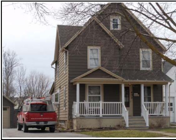
452 Ellicott St 180200 84.020-2-4.1

Neighborhood: 600 Property Class: 210 - 1 Family Res Sale Date: 4/6/2023 Sale Price: $ 155,000 Prelim 2025 Land Asmt: $ 14,200 Prelim 2025 Asmt: $ 160,000 Building Style: Old Style Exterior Wall: Alum/vinyl Year Built: 1910 Basement Type: Full Grade: Average Condition: Normal SFLA: 1,428 Sale Price/SFLA: $ 108.54 Number Bedrooms: 3 Number Baths: 1.5