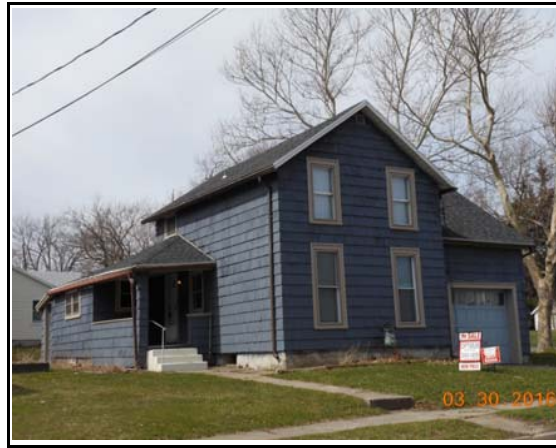
217 Bank St 180200 84.025-1-20

Neighborhood: 300 Property Class: 210 - 1 Family Res Sale Date: 4/21/2023 Sale Price: $ 120,000 Prelim 2025 Land Asmt: $ 8,800 Prelim 2025 Asmt: $ 135,000 Building Style: Old Style Exterior Wall: Wood Year Built: 1920 Basement Type: Full Grade: Average Condition: Normal SFLA: 1,232 Sale Price/SFLA: $ 97.40 Number Bedrooms: 3 Number Baths: 1.0