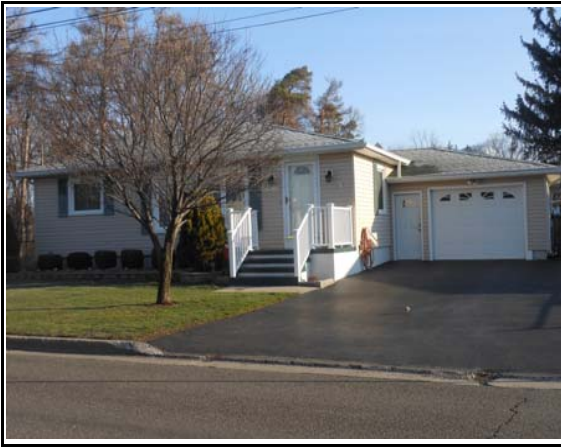
218 Richmond Ave 180200 71.018-1-42

Neighborhood: 400 Property Class: 210 - 1 Family Res Sale Date: 2/20/2024 Sale Price: $ 207,000 Prelim 2025 Land Asmt: $ 17,600 Prelim 2025 Asmt: $ 171,400 Building Style: Ranch Exterior Wall: Alum/vinyl Year Built: 1965 Basement Type: Full Grade: Average Condition: Good SFLA: 1,088 Sale Price/SFLA: $ 190.26 Number Bedrooms: 2 Number Baths: 1.0