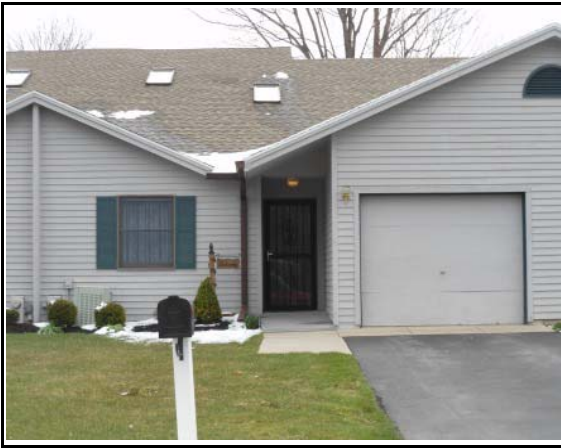
6 North Pointe Dr 180200 84.008-2-70

Neighborhood: 100 Property Class: 210 - 1 Family Res Sale Date: 2/20/2023 Sale Price: $ 201,000 Prelim 2025 Land Asmt: $ 9,900 Prelim 2025 Asmt: $ 198,000 Building Style: Town House Exterior Wall: Wood Year Built: 1990 Basement Type: Full Grade: Average Condition: Normal SFLA: 1,613 Sale Price/SFLA: $ 124.61 Number Bedrooms: 2 Number Baths: 2.0