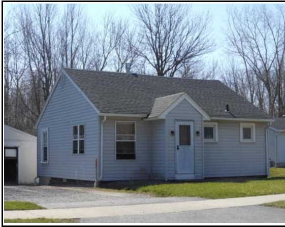
117 Walnut St 180200 84.014-2-27

Neighborhood: 500 Property Class: 210 - 1 Family Res Sale Date: 11/1/2023 Sale Price: $ 54,000 Prelim 2025 Land Asmt: $ 12,600 Prelim 2025 Asmt: $ 89,000 Building Style: Ranch Exterior Wall: Alum/vinyl Year Built: 1950 Basement Type: Crawl Grade: Economy Condition: Poor SFLA: 720 Sale Price/SFLA: $ 75.00 Number Bedrooms: 2 Number Baths: 1.0