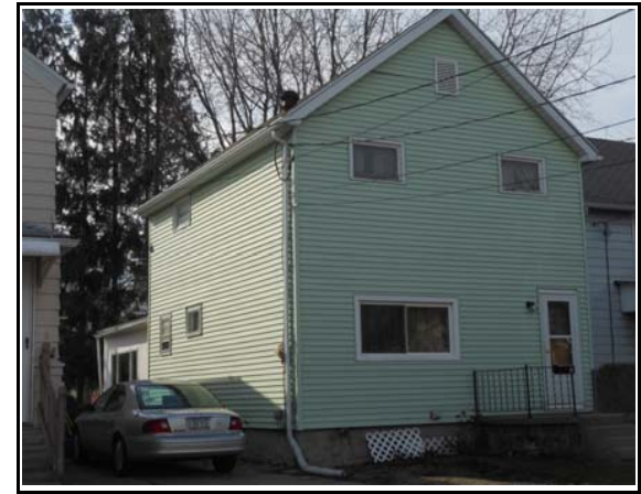
8 Hyde Park 180200 84.074-1-41

Neighborhood: 500 Property Class: 210 - 1 Family Res Sale Date: 4/18/2023 Sale Price: $ 123,800 Prelim 2025 Land Asmt: $ 24,200 Prelim 2025 Asmt: $ 132,000 Building Style: Old Style Exterior Wall: Wood Year Built: 1910 Basement Type: Full Grade: Average Condition: Fair SFLA: 1,235 Sale Price/SFLA: $ 100.24 Number Bedrooms: 2 Number Baths: 1.0