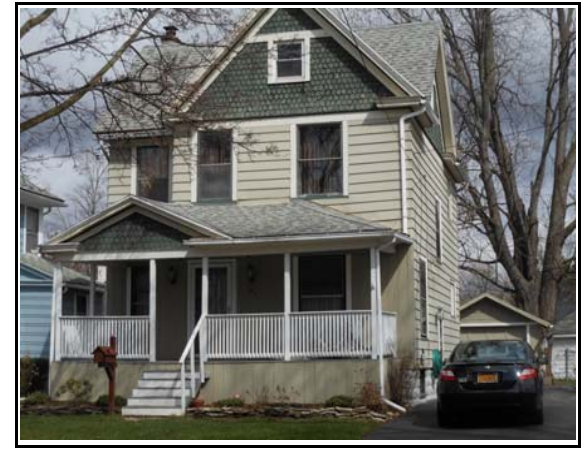
101 North St 180200 84.026-1-43

Neighborhood: 300 Property Class: 210 - 1 Family Res Sale Date: 10/6/2023 Sale Price: $ 145,000 Prelim 2025 Land Asmt: $ 6,700 Prelim 2025 Asmt: $ 166,000 Building Style: Old Style Exterior Wall: Alum/vinyl Year Built: 1850 Basement Type: Full Grade: Average Condition: Normal SFLA: 1,442 Sale Price/SFLA: $ 100.55 Number Bedrooms: 3 Number Baths: 1.0