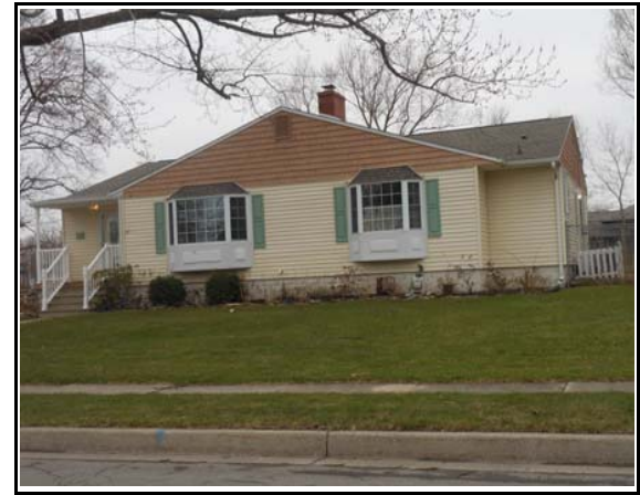
29 Woodrow Rd 180200 84.005-1-11.1

Neighborhood: 400 Property Class: 210 - 1 Family Res Sale Date: 6/5/2023 Sale Price: $ 140,000 Prelim 2025 Land Asmt: $ 26,200 Prelim 2025 Asmt: $ 154,000 Building Style: Ranch Exterior Wall: Wood Year Built: 1951 Basement Type: Full Grade: Average Condition: Fair SFLA: 1,182 Sale Price/SFLA: $ 118.44 Number Bedrooms: 2 Number Baths: 1.0