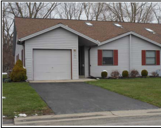
9 North Pointe Dr 180200 84.008-2-80

Neighborhood: 100 Property Class: 210 - 1 Family Res Sale Date: 10/25/2024 Sale Price: $ 175,000 Prelim 2025 Land Asmt: $ 9,900 Prelim 2025 Asmt: $ 191,000 Building Style: Town House Exterior Wall: Alum/vinyl Year Built: 1990 Basement Type: Full Grade: Average Condition: Normal SFLA: 1,236 Sale Price/SFLA: $ 141.59 Number Bedrooms: 2 Number Baths: 2.0