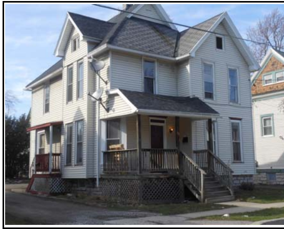
21 Dellinger Ave 180200 84.040-2-67

Neighborhood: 300 Property Class: 220 - 2 Family Res Sale Date: 1/19/2024 Sale Price: $ 150,000 Prelim 2025 Land Asmt: $ 16,700 Prelim 2025 Asmt: $ 164,000 Building Style: Old Style Exterior Wall: Alum/vinyl Year Built: 1930 Basement Type: Partial Grade: Average Condition: Normal SFLA: 2,208 Sale Price/SFLA: $ 67.93 Number Bedrooms: 4 Number Baths: 2.0