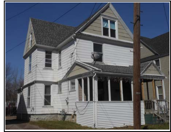
11 Holland Ave 180200 84.031-3-21

Neighborhood: 300 Property Class: 210 - 1 Family Res Sale Date: 5/21/2024 Sale Price: $ 178,000 Prelim 2025 Land Asmt: $ 11,900 Prelim 2025 Asmt: $ 154,000 Building Style: Old Style Exterior Wall: Alum/vinyl Year Built: 1890 Basement Type: Full Grade: Average Condition: Normal SFLA: 1,572 Sale Price/SFLA: $ 113.23 Number Bedrooms: 4 Number Baths: 1.0