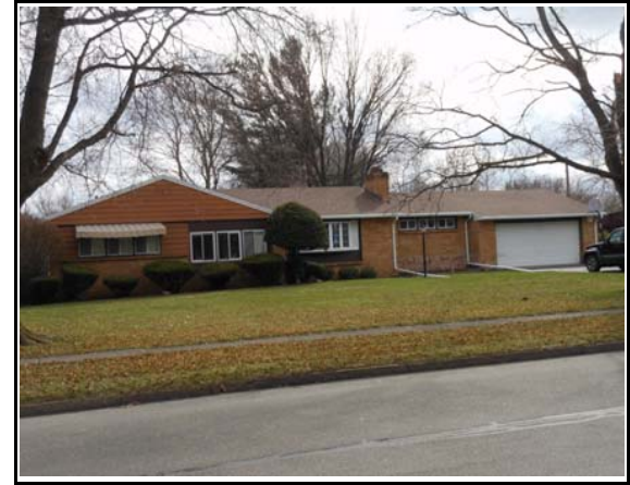
240 East Ave 180200 84.012-3-10

Neighborhood: 200 Property Class: 210 - 1 Family Res Sale Date: 3/22/2024 Sale Price: $ 217,000 Prelim 2025 Land Asmt: $ 21,400 Prelim 2025 Asmt: $ 222,000 Building Style: Ranch Exterior Wall: Alum/vinyl Year Built: 1958 Basement Type: Full Grade: Average Condition: Normal SFLA: 1,456 Sale Price/SFLA: $ 149.04 Number Bedrooms: 3 Number Baths: 2.0