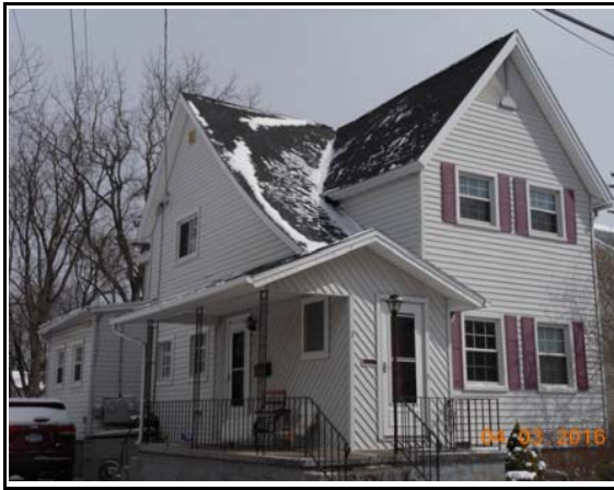
7 Fisher Park 180200 84.051-1-28

Neighborhood: 700 Property Class: 220 - 2 Family Res Sale Date: 5/31/2024 Sale Price: $ 164,900 Prelim 2025 Land Asmt: $ 14,000 Prelim 2025 Asmt: $ 143,000 Building Style: Old Style Exterior Wall: Alum/vinyl Year Built: 1900 Basement Type: Full Grade: Average Condition: Normal SFLA: 1,757 Sale Price/SFLA: $ 93.85 Number Bedrooms: 3 Number Baths: 2.0