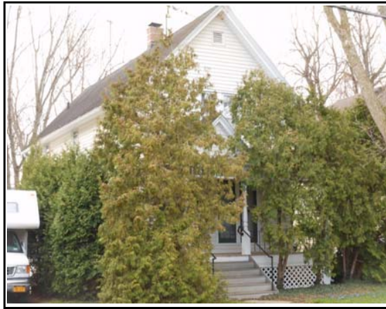
14 Tracy Ave 180200 84.042-1-39

Neighborhood: 300 Property Class: 210 - 1 Family Res Sale Date: 5/26/2023 Sale Price: $ 150,000 Prelim 2025 Land Asmt: $ 8,600 Prelim 2025 Asmt: $ 168,000 Building Style: Old Style Exterior Wall: Alum/vinyl Year Built: 1900 Basement Type: Full Grade: Average Condition: Normal SFLA: 1,362 Sale Price/SFLA: $ 110.13 Number Bedrooms: 4 Number Baths: 1.0