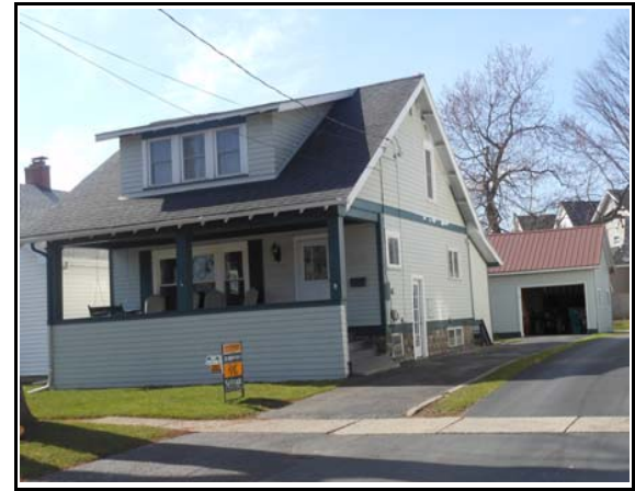
33 Prospect Ave 180200 84.032-1-22

Neighborhood: 200 Property Class: 210 - 1 Family Res Sale Date: 7/15/2024 Sale Price: $ 205,303 Prelim 2025 Land Asmt: $ 10,300 Prelim 2025 Asmt: $ 184,000 Building Style: Old Style Exterior Wall: Alum/vinyl Year Built: 1900 Basement Type: Full Grade: Average Condition: Normal SFLA: 1,320 Sale Price/SFLA: $ 155.53 Number Bedrooms: 3 Number Baths: 1.5