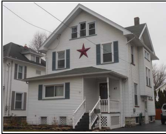
47 Vernon Ave 180200 84.023-2-11

Neighborhood: 200 Property Class: 220 - 2 Family Res Sale Date: 10/20/2023 Sale Price: $ 179,900 Prelim 2025 Land Asmt: $ 11,500 Prelim 2025 Asmt: $ 194,000 Building Style: Old Style Exterior Wall: Alum/vinyl Year Built: 1900 Basement Type: Partial Grade: Average Condition: Normal SFLA: 1,812 Sale Price/SFLA: $ 99.28 Number Bedrooms: 4 Number Baths: 3.0