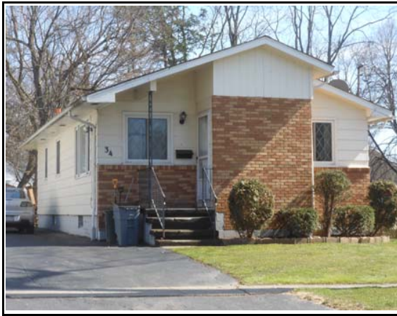
34 Prospect Ave 180200 84.006-4-58

Neighborhood: 200 Property Class: 210 - 1 Family Res Sale Date: 6/23/2023 Sale Price: $ 223,002 Prelim 2025 Land Asmt: $ 13,200 Prelim 2025 Asmt: $ 179,000 Building Style: Ranch Exterior Wall: Composition Year Built: 1974 Basement Type: Full Grade: Average Condition: Normal SFLA: 1,048 Sale Price/SFLA: $ 212.79 Number Bedrooms: 3 Number Baths: 1.0