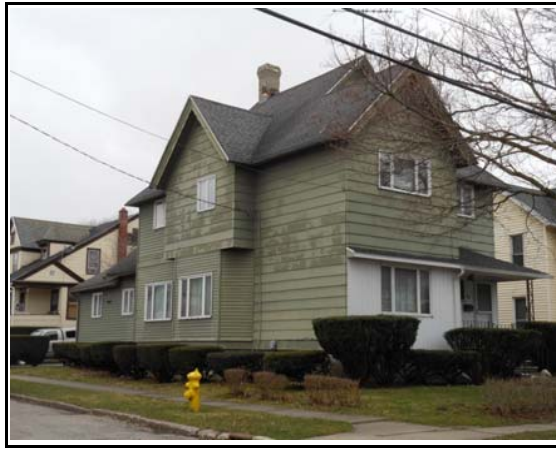
12 Vine St 180200 84.012-1-1

Neighborhood: 700 Property Class: 210 - 1 Family Res Sale Date: 7/28/2023 Sale Price: $ 260,000 Prelim 2025 Land Asmt: $ 17,000 Prelim 2025 Asmt: $ 274,000 Building Style: Old Style Exterior Wall: Wood Year Built: 1925 Basement Type: Full Grade: Average Condition: Normal SFLA: 2,336 Sale Price/SFLA: $ 111.30 Number Bedrooms: 4 Number Baths: 2.0