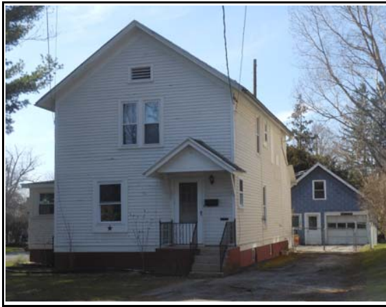
43 Prospect Ave 180200 84.024-1-14

Neighborhood: 200 Property Class: 210 - 1 Family Res Sale Date: 4/10/2024 Sale Price: $ 235,000 Prelim 2025 Land Asmt: $ 16,500 Prelim 2025 Asmt: $ 249,000 Building Style: Old Style Exterior Wall: Alum/vinyl Year Built: 1910 Basement Type: Full Grade: Average Condition: Normal SFLA: 2,070 Sale Price/SFLA: $ 113.53 Number Bedrooms: 4 Number Baths: 1.5