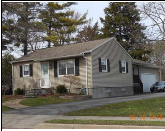
317 Bank St 180200 71.020-1-4

Neighborhood: 200 Property Class: 210 - 1 Family Res Sale Date: 8/1/2024 Sale Price: $ 210,000 Prelim 2025 Land Asmt: $ 20,000 Prelim 2025 Asmt: $ 162,000 Building Style: Ranch Exterior Wall: Wood Year Built: 1953 Basement Type: Full Grade: Average Condition: Fair SFLA: 744 Sale Price/SFLA: $ 282.26 Number Bedrooms: 2 Number Baths: 2.0