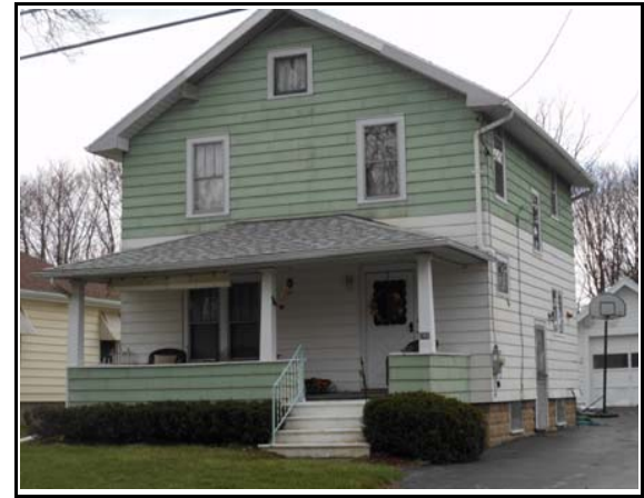
280 Ross St 180200 71.020-1-77.1

Neighborhood: 200 Property Class: 210 - 1 Family Res Sale Date: 9/18/2024 Sale Price: $ 120,000 Prelim 2025 Land Asmt: $ 11,000 Prelim 2025 Asmt: $ 135,000 Building Style: Old Style Exterior Wall: Wood Year Built: 1928 Basement Type: Full Grade: Average Condition: Normal SFLA: 1,248 Sale Price/SFLA: $ 96.15 Number Bedrooms: 3 Number Baths: 1.0