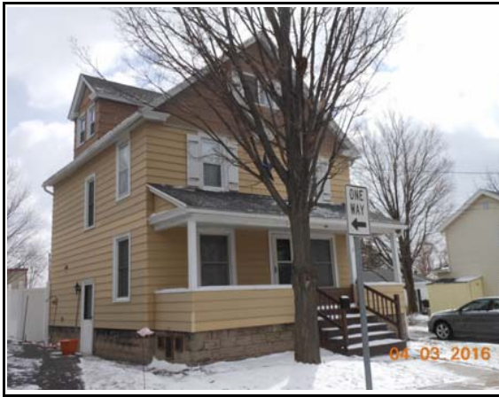
2 North Spruce St 180200 84.012-3-65

Neighborhood: 700 Property Class: 210 - 1 Family Res Sale Date: 10/29/2024 Sale Price: $ 165,000 Prelim 2025 Land Asmt: $ 10,600 Prelim 2025 Asmt: $ 134,000 Building Style: Old Style Exterior Wall: Alum/vinyl Year Built: 1910 Basement Type: Full Grade: Average Condition: Normal SFLA: 1,404 Sale Price/SFLA: $ 117.52 Number Bedrooms: 3 Number Baths: 1.0