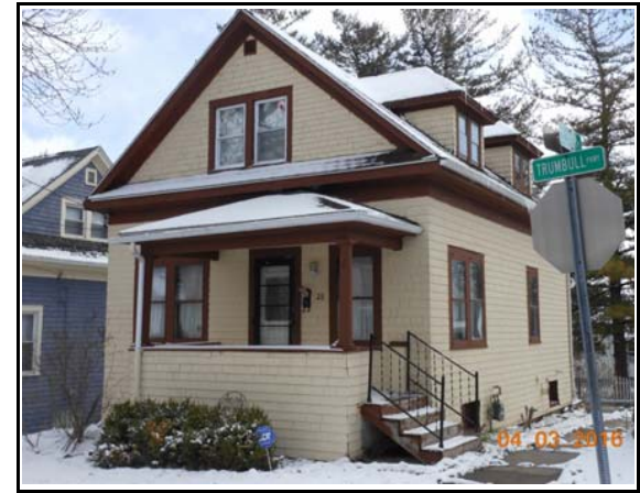
26 Trumbull Pkwy 180200 84.051-2-19

Neighborhood: 700 Property Class: 210 - 1 Family Res Sale Date: 7/25/2024 Sale Price: $ 40,000 Prelim 2025 Land Asmt: $ 9,200 Prelim 2025 Asmt: $ 75,000 Building Style: Old Style Exterior Wall: Wood Year Built: 1910 Basement Type: Full Grade: Average Condition: Poor SFLA: 990 Sale Price/SFLA: $ 40.40 Number Bedrooms: 3 Number Baths: 1.0