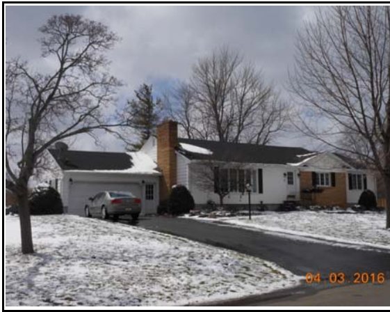
6 Evergreen Dr 180200 84.008-1-42

Neighborhood: 200 Property Class: 210 - 1 Family Res Sale Date: 9/5/2024 Sale Price: $ 285,775 Prelim 2025 Land Asmt: $ 20,500 Prelim 2025 Asmt: $ 267,000 Building Style: Ranch Exterior Wall: Alum/vinyl Year Built: 1957 Basement Type: Full Grade: Average Condition: Normal SFLA: 1,860 Sale Price/SFLA: $ 153.64 Number Bedrooms: 3 Number Baths: 1.5