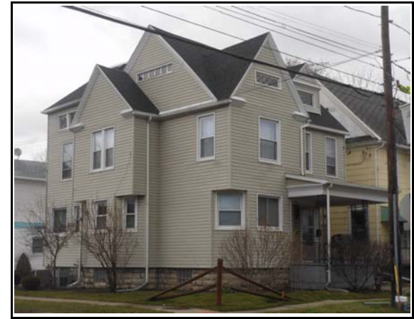
201 Washington Ave 180200 84.042-1-66

Neighborhood: 300 Property Class: 220 - 2 Family Res Sale Date: 5/20/2024 Sale Price: $ 111,297 Prelim 2025 Land Asmt: $ 9,500 Prelim 2025 Asmt: $ 116,000 Building Style: Old Style Exterior Wall: Brick Year Built: 1920 Basement Type: Full Grade: Average Condition: Fair SFLA: 1,998 Sale Price/SFLA: $ 55.70 Number Bedrooms: 4 Number Baths: 2.0