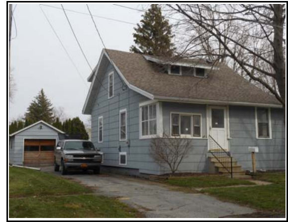
23 Kibbe Ave 180200 84.019-2-62

Neighborhood: 500 Property Class: 210 - 1 Family Res Sale Date: 10/10/2024 Sale Price: $ 87,500 Prelim 2025 Land Asmt: $ 6,900 Prelim 2025 Asmt: $ 102,000 Building Style: Cape Cod Exterior Wall: Alum/vinyl Year Built: 1880 Basement Type: Full Grade: Average Condition: Fair SFLA: 988 Sale Price/SFLA: $ 88.56 Number Bedrooms: 4 Number Baths: 1.0