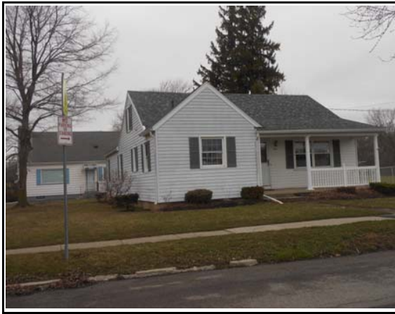
101 Union St 180200 71.018-1-33

Neighborhood: 200 Property Class: 210 - 1 Family Res Sale Date: 11/27/2024 Sale Price: $ 185,000 Prelim 2025 Land Asmt: $ 15,600 Prelim 2025 Asmt: $ 179,000 Building Style: Cape Cod Exterior Wall: Alum/vinyl Year Built: 1950 Basement Type: Full Grade: Average Condition: Normal SFLA: 1,719 Sale Price/SFLA: $ 107.62 Number Bedrooms: 3 Number Baths: 1.0