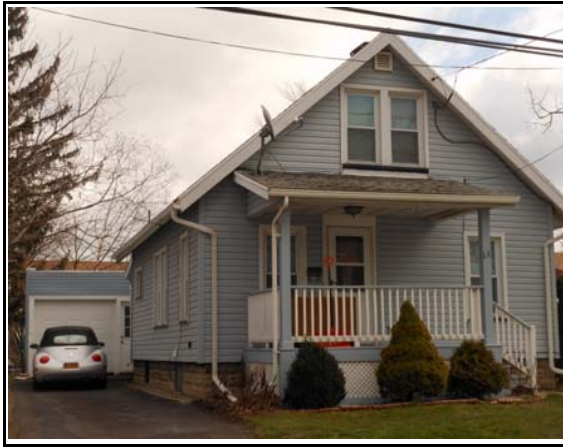
13 Cedar St 180200 85.013-1-67

Neighborhood: 600 Property Class: 210 - 1 Family Res Sale Date: 9/30/2024 Sale Price: $ 147,500 Prelim 2025 Land Asmt: $ 12,700 Prelim 2025 Asmt: $ 119,000 Building Style: Old Style Exterior Wall: Alum/vinyl Year Built: 1930 Basement Type: Full Grade: Average Condition: Normal SFLA: 865 Sale Price/SFLA: $ 170.52 Number Bedrooms: 2 Number Baths: 1.0