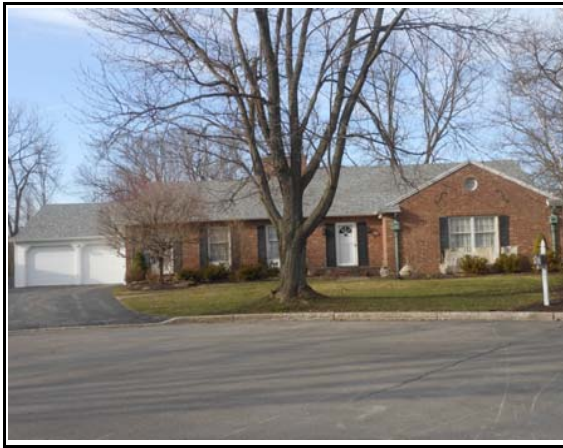
23 Pickthorn Dr 180200 71.018-3-47

Neighborhood: 200 Property Class: 210 - 1 Family Res Sale Date: 8/21/2024 Sale Price: $ 325,888 Prelim 2025 Land Asmt: $ 17,400 Prelim 2025 Asmt: $ 334,000 Building Style: Cape Cod Exterior Wall: Brick Year Built: 1958 Basement Type: Full Grade: Average Condition: Normal SFLA: 3,696 Sale Price/SFLA: $ 88.17 Number Bedrooms: 5 Number Baths: 3.0