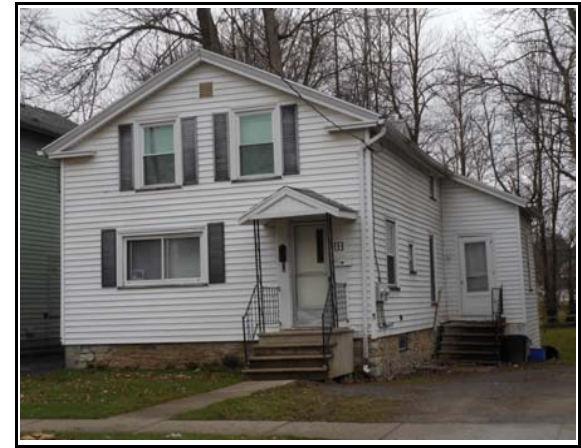
133 State St 180200 84.007-1-9

Neighborhood: 700 Property Class: 210 - 1 Family Res Sale Date: 11/19/2024 Sale Price: $ 180,000 Prelim 2025 Land Asmt: $ 14,000 Prelim 2025 Asmt: $ 156,000 Building Style: Old Style Exterior Wall: Wood Year Built: 1890 Basement Type: Partial Grade: Average Condition: Normal SFLA: 1,538 Sale Price/SFLA: $ 117.04 Number Bedrooms: 5 Number Baths: 1.0