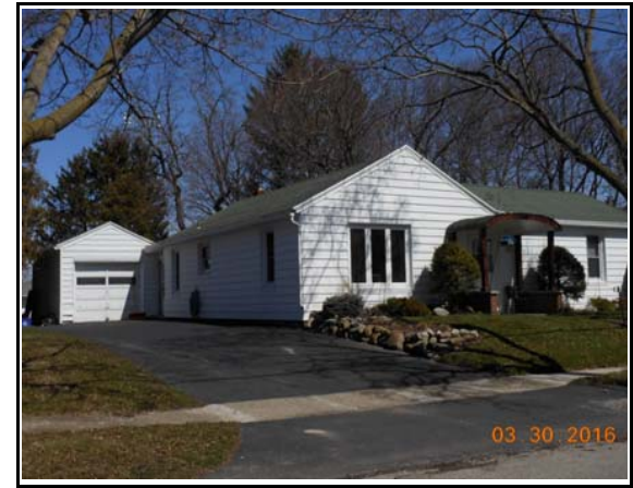
20 Douglas St 180200 71.082-1-54

Neighborhood: 200 Property Class: 210 - 1 Family Res Sale Date: 3/29/2023 Sale Price: $ 210,500 Prelim 2025 Land Asmt: $ 18,400 Prelim 2025 Asmt: $ 234,000 Building Style: Ranch Exterior Wall: Alum/vinyl Year Built: 1957 Basement Type: Full Grade: Average Condition: Normal SFLA: 1,244 Sale Price/SFLA: $ 169.21 Number Bedrooms: 3 Number Baths: 1.0