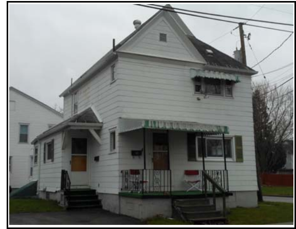
4 Sumner St 180200 84.019-3-18

Neighborhood: 500 Property Class: 210 - 1 Family Res Sale Date: 6/27/2024 Sale Price: $ 122,340 Prelim 2025 Land Asmt: $ 12,000 Prelim 2025 Asmt: $ 122,000 Building Style: Old Style Exterior Wall: Brick Year Built: 1900 Basement Type: Full Grade: Average Condition: Normal SFLA: 1,183 Sale Price/SFLA: $ 103.42 Number Bedrooms: 3 Number Baths: 1.5