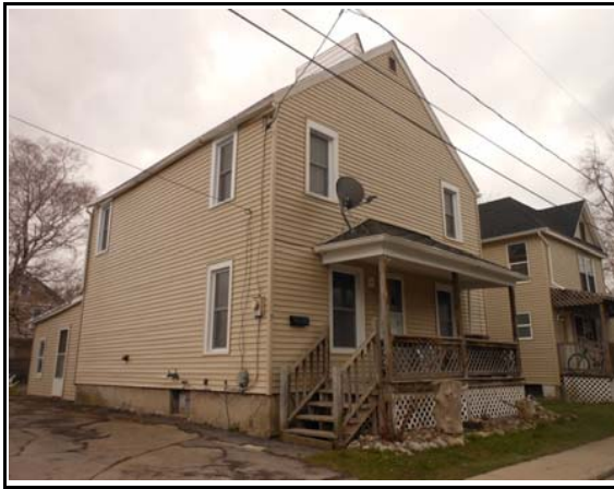
7 Mckinley Ave 180200 84.059-2-36

Neighborhood: 600 Property Class: 210 - 1 Family Res Sale Date: 1/23/2024 Sale Price: $ 93,000 Prelim 2025 Land Asmt: $ 13,700 Prelim 2025 Asmt: $ 77,000 Building Style: Old Style Exterior Wall: Alum/vinyl Year Built: 1874 Basement Type: Full Grade: Average Condition: Fair SFLA: 1,232 Sale Price/SFLA: $ 75.49 Number Bedrooms: 4 Number Baths: 1.0