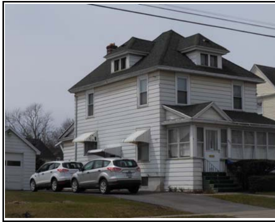
512 Ellicott St 180200 84.020-3-4

Neighborhood: 600 Property Class: 210 - 1 Family Res Sale Date: 2/2/2024 Sale Price: $ 40,000 Prelim 2025 Land Asmt: $ 18,700 Prelim 2025 Asmt: $ 105,000 Building Style: Old Style Exterior Wall: Wood Year Built: 1870 Basement Type: Full Grade: Average Condition: Poor SFLA: 1,162 Sale Price/SFLA: $ 34.42 Number Bedrooms: 3 Number Baths: 1.0