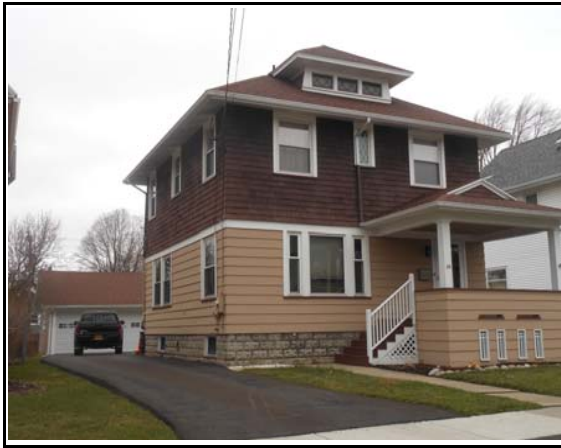
35 Vernon Ave 180200 84.023-2-17

Neighborhood: 200 Property Class: 210 - 1 Family Res Sale Date: 8/20/2024 Sale Price: $ 240,500 Prelim 2025 Land Asmt: $ 15,300 Prelim 2025 Asmt: $ 187,000 Building Style: Old Style Exterior Wall: Wood Year Built: 1910 Basement Type: Partial Grade: Average Condition: Normal SFLA: 1,654 Sale Price/SFLA: $ 145.41 Number Bedrooms: 4 Number Baths: 1.5