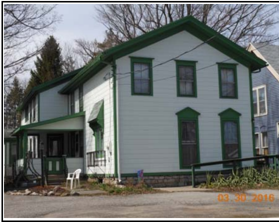
121 Bank St 180200 84.041-1-11

Neighborhood: 300 Property Class: 210 - 1 Family Res Sale Date: 5/20/2024 Sale Price: $ 125,000 Prelim 2025 Land Asmt: $ 17,600 Prelim 2025 Asmt: $ 135,000 Building Style: Old Style Exterior Wall: Composition Year Built: 1870 Basement Type: Full Grade: Average Condition: Poor SFLA: 3,300 Sale Price/SFLA: $ 37.88 Number Bedrooms: 4 Number Baths: 1.0