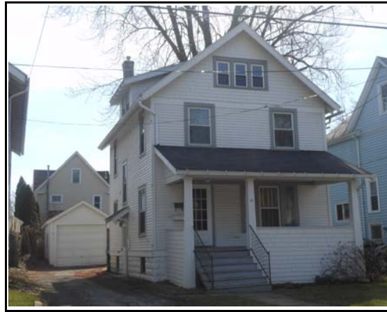
20 Lyon St 180200 84.031-2-31

Neighborhood: 300 Property Class: 210 - 1 Family Res Sale Date: 10/23/2023 Sale Price: $ 165,000 Prelim 2025 Land Asmt: $ 9,000 Prelim 2025 Asmt: $ 178,000 Building Style: Old Style Exterior Wall: Alum/vinyl Year Built: 1930 Basement Type: Full Grade: Average Condition: Normal SFLA: 1,276 Sale Price/SFLA: $ 129.31 Number Bedrooms: 3 Number Baths: 1.5