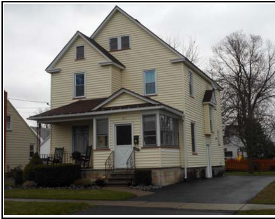
108 Osterhout Ave 180200 84.082-2-32

Neighborhood: 500 Property Class: 210 - 1 Family Res Sale Date: 9/6/2023 Sale Price: $ 185,000 Prelim 2025 Land Asmt: $ 10,600 Prelim 2025 Asmt: $ 207,000 Building Style: Old Style Exterior Wall: Alum/vinyl Year Built: 1900 Basement Type: Full Grade: Average Condition: Normal SFLA: 1,396 Sale Price/SFLA: $ 132.52 Number Bedrooms: 3 Number Baths: 1.0