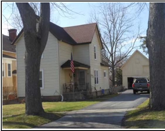
47 Prospect Ave 180200 84.024-1-12

Neighborhood: 200 Property Class: 210 - 1 Family Res Sale Date: 11/2/2023 Sale Price: $ 145,000 Prelim 2025 Land Asmt: $ 16,500 Prelim 2025 Asmt: $ 161,000 Building Style: Old Style Exterior Wall: Alum/vinyl Year Built: 1910 Basement Type: Full Grade: Average Condition: Normal SFLA: 1,208 Sale Price/SFLA: $ 120.03 Number Bedrooms: 3 Number Baths: 1.0