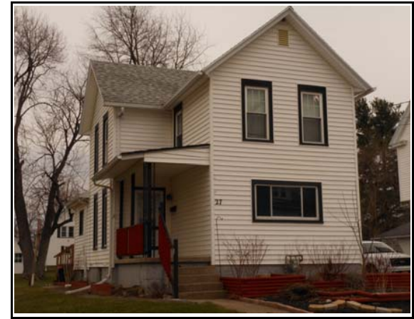
27 Otis St 180200 84.020-2-76

Neighborhood: 500 Property Class: 210 - 1 Family Res Sale Date: 2/13/2023 Sale Price: $ 139,900 Prelim 2025 Land Asmt: $ 13,100 Prelim 2025 Asmt: $ 149,000 Building Style: Old Style Exterior Wall: Wood Year Built: 1920 Basement Type: Full Grade: Average Condition: Normal SFLA: 1,312 Sale Price/SFLA: $ 106.63 Number Bedrooms: 4 Number Baths: 1.0