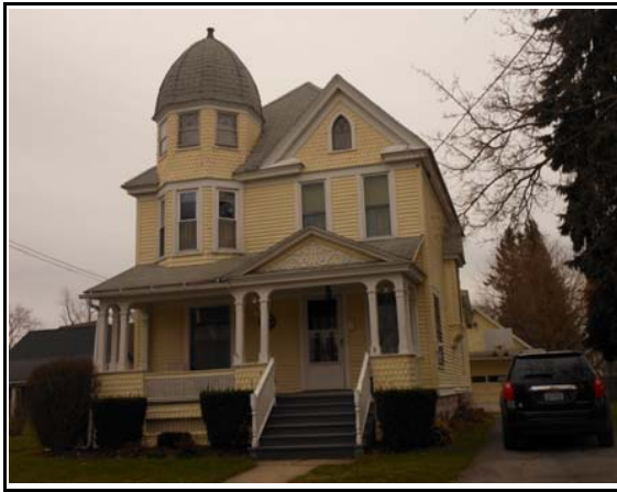
9 Otis St 180200 84.020-2-83

Neighborhood: 500 Property Class: 210 - 1 Family Res Sale Date: 1/22/2024 Sale Price: $ 162,500 Prelim 2025 Land Asmt: $ 14,200 Prelim 2025 Asmt: $ 158,000 Building Style: Old Style Exterior Wall: Wood Year Built: 1890 Basement Type: Full Grade: Average Condition: Normal SFLA: 1,624 Sale Price/SFLA: $ 100.06 Number Bedrooms: 4 Number Baths: 1.5