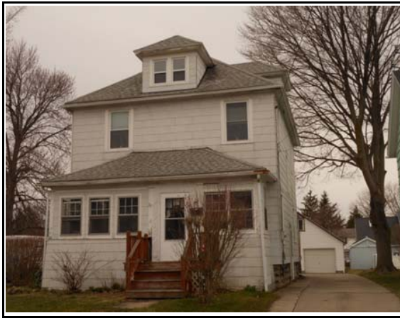
34 Otis St 180200 84.082-2-9

Neighborhood: 500 Property Class: 210 - 1 Family Res Sale Date: 8/22/2023 Sale Price: $ 173,000 Prelim 2025 Land Asmt: $ 15,300 Prelim 2025 Asmt: $ 197,000 Building Style: Old Style Exterior Wall: Wood Year Built: 1918 Basement Type: Full Grade: Average Condition: Fair SFLA: 1,500 Sale Price/SFLA: $ 115.33 Number Bedrooms: 4 Number Baths: 1.0