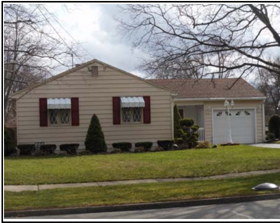
260 East Ave 180200 85.009-1-44

Neighborhood: 200 Property Class: 210 - 1 Family Res Sale Date: 4/2/2024 Sale Price: $ 205,000 Prelim 2025 Land Asmt: $ 20,200 Prelim 2025 Asmt: $ 184,000 Building Style: Ranch Exterior Wall: Alum/vinyl Year Built: 1954 Basement Type: Full Grade: Average Condition: Normal SFLA: 1,217 Sale Price/SFLA: $ 168.45 Number Bedrooms: 3 Number Baths: 2.0