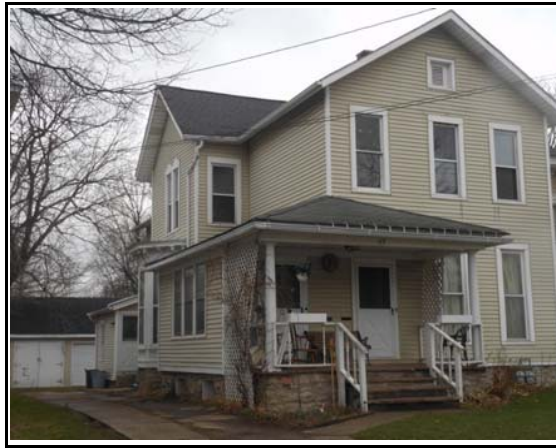
117 State St 180200 84.007-1-18

Neighborhood: 700 Property Class: 220 - 2 Family Res Sale Date: 5/24/2023 Sale Price: $ 84,000 Prelim 2025 Land Asmt: $ 9,300 Prelim 2025 Asmt: $ 103,000 Building Style: Old Style Exterior Wall: Wood Year Built: 1880 Basement Type: Full Grade: Average Condition: Poor SFLA: 2,216 Sale Price/SFLA: $ 37.91 Number Bedrooms: 4 Number Baths: 2.0