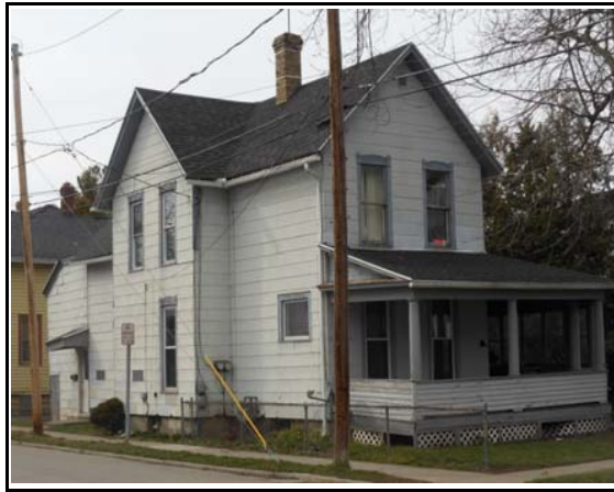
110 Jackson St 180200 84.057-1-36

Neighborhood: 500 Property Class: 220 - 2 Family Res Sale Date: 1/29/2024 Sale Price: $ 75,000 Prelim 2025 Land Asmt: $ 15,800 Prelim 2025 Asmt: $ 79,000 Building Style: Old Style Exterior Wall: Alum/vinyl Year Built: 1900 Basement Type: Full Grade: Average Condition: Poor SFLA: 1,600 Sale Price/SFLA: $ 46.88 Number Bedrooms: 4 Number Baths: 2.0