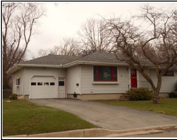
31 Clifton Ave 180200 84.020-3-58

Neighborhood: 500 Property Class: 210 - 1 Family Res Sale Date: 1/23/2023 Sale Price: $ 149,000 Prelim 2025 Land Asmt: $ 14,400 Prelim 2025 Asmt: $ 161,000 Building Style: Ranch Exterior Wall: Alum/vinyl Year Built: 1960 Basement Type: Full Grade: Average Condition: Normal SFLA: 1,212 Sale Price/SFLA: $ 122.94 Number Bedrooms: 3 Number Baths: 1.0