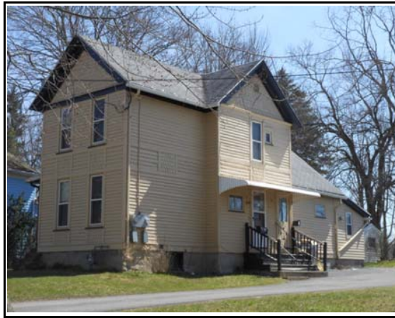
41 Maple St 180200 84.064-1-19

Neighborhood: 500 Property Class: 210 - 1 Family Res Sale Date: 9/6/2023 Sale Price: $ 185,000 Prelim 2025 Land Asmt: $ 10,600 Prelim 2025 Asmt: $ 207,000 Building Style: Old Style Exterior Wall: Alum/vinyl Year Built: 1900 Basement Type: Full Grade: Average Condition: Normal SFLA: 1,396 Sale Price/SFLA: $ 132.52 Number Bedrooms: 3 Number Baths: 1.0