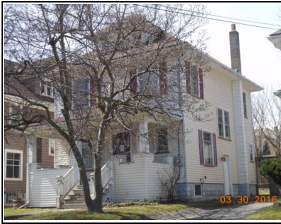
5 Norris Ave 180200 84.025-1-12

Neighborhood: 200 Property Class: 210 - 1 Family Res Sale Date: 11/28/2023 Sale Price: $ 120,000 Prelim 2025 Land Asmt: $ 11,500 Prelim 2025 Asmt: $ 143,000 Building Style: Old Style Exterior Wall: Alum/vinyl Year Built: 1917 Basement Type: Full Grade: Average Condition: Fair SFLA: 1,520 Sale Price/SFLA: $ 78.95 Number Bedrooms: 4 Number Baths: 2.0