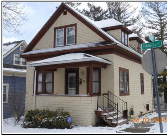
26 Trumbull Pkwy 180200 84.051-2-19

Neighborhood: 700 Property Class: 210 - 1 Family Res Sale Date: 8/9/2023 Sale Price: $ 130,000 Prelim 2025 Land Asmt: $ 14,700 Prelim 2025 Asmt: $ 142,000 Building Style: Old Style Exterior Wall: Alum/vinyl Year Built: 1925 Basement Type: Full Grade: Average Condition: Normal SFLA: 911 Sale Price/SFLA: $ 142.70 Number Bedrooms: 1 Number Baths: 1.0