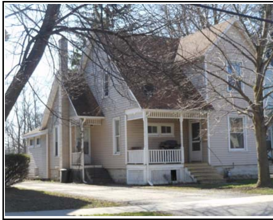
13 Walnut St 180200 84.010-4-16

Neighborhood: 500 Property Class: 220 - 2 Family Res Sale Date: 7/24/2024 Sale Price: $ 100,000 Prelim 2025 Land Asmt: $ 10,100 Prelim 2025 Asmt: $ 112,000 Building Style: Old Style Exterior Wall: Composition Year Built: 1880 Basement Type: Full Grade: Average Condition: Fair SFLA: 1,692 Sale Price/SFLA: $ 59.10 Number Bedrooms: 4 Number Baths: 2.0