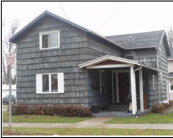
45 Washington Ave 180200 84.041-1-41

Neighborhood: 300 Property Class: 230 - 3 Family Res Sale Date: 3/21/2024 Sale Price: $ 72,000 Prelim 2025 Land Asmt: $ 10,200 Prelim 2025 Asmt: $ 99,000 Building Style: Old Style Exterior Wall: Wood Year Built: 1920 Basement Type: Full Grade: Average Condition: Poor SFLA: 1,926 Sale Price/SFLA: $ 37.38 Number Bedrooms: 4 Number Baths: 3.0