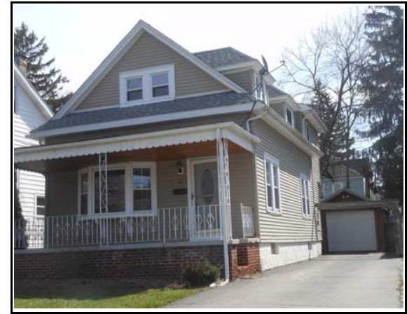
40 Lyon St 180200 84.031-2-40

Neighborhood: 300 Property Class: 210 - 1 Family Res Sale Date: 5/31/2024 Sale Price: $ 152,850 Prelim 2025 Land Asmt: $ 11,900 Prelim 2025 Asmt: $ 149,000 Building Style: Old Style Exterior Wall: Wood Year Built: 1930 Basement Type: Full Grade: Average Condition: Normal SFLA: 1,196 Sale Price/SFLA: $ 127.80 Number Bedrooms: 3 Number Baths: 1.0