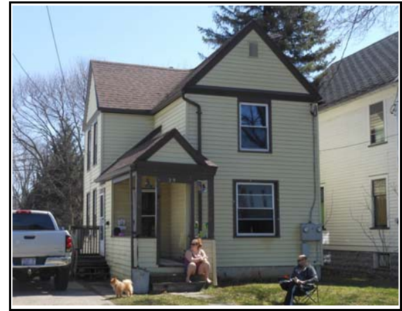
29 Pringle Ave 180200 84.066-1-32

Neighborhood: 500 Property Class: 210 - 1 Family Res Sale Date: 1/11/2024 Sale Price: $ 130,000 Prelim 2025 Land Asmt: $ 11,700 Prelim 2025 Asmt: $ 128,000 Building Style: Old Style Exterior Wall: Alum/vinyl Year Built: 1880 Basement Type: Full Grade: Average Condition: Normal SFLA: 1,441 Sale Price/SFLA: $ 90.22 Number Bedrooms: 3 Number Baths: 1.0