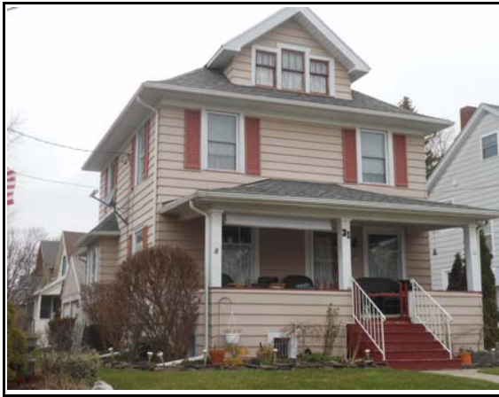
31 Union St 180200 84.023-1-52

Neighborhood: 300 Property Class: 210 - 1 Family Res Sale Date: 10/6/2024 Sale Price: $ 169,500 Prelim 2025 Land Asmt: $ 12,400 Prelim 2025 Asmt: $ 148,000 Building Style: Old Style Exterior Wall: Alum/vinyl Year Built: 1920 Basement Type: Full Grade: Average Condition: Normal SFLA: 1,560 Sale Price/SFLA: $ 108.65 Number Bedrooms: 3 Number Baths: 1.0