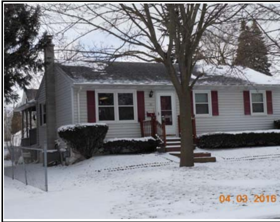
20 Chase Park 180200 84.051-1-20

Neighborhood: 700 Property Class: 210 - 1 Family Res Sale Date: 2/14/2024 Sale Price: $ 125,000 Prelim 2025 Land Asmt: $ 17,000 Prelim 2025 Asmt: $ 143,000 Building Style: Ranch Exterior Wall: Alum/vinyl Year Built: 1980 Basement Type: Full Grade: Average Condition: Normal SFLA: 936 Sale Price/SFLA: $ 133.55 Number Bedrooms: 3 Number Baths: 1.0