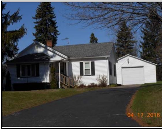
76 River St 180200 84.009-1-26

Neighborhood: 500 Property Class: 210 - 1 Family Res Sale Date: 4/12/2024 Sale Price: $ 145,000 Prelim 2025 Land Asmt: $ 18,000 Prelim 2025 Asmt: $ 144,000 Building Style: Old Style Exterior Wall: Alum/vinyl Year Built: 1920 Basement Type: Partial Grade: Average Condition: Normal SFLA: 891 Sale Price/SFLA: $ 162.74 Number Bedrooms: 3 Number Baths: 1.0