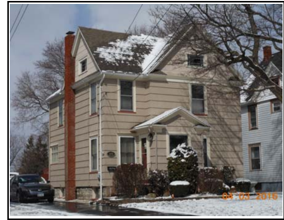
19 Trumbull Pkwy 180200 84.051-2-46

Neighborhood: 700 Property Class: 210 - 1 Family Res Sale Date: 9/22/2023 Sale Price: $ 85,000 Prelim 2025 Land Asmt: $ 10,100 Prelim 2025 Asmt: $ 110,000 Building Style: Old Style Exterior Wall: Wood Year Built: 1870 Basement Type: Full Grade: Average Condition: Poor SFLA: 1,380 Sale Price/SFLA: $ 61.59 Number Bedrooms: 3 Number Baths: 1.5