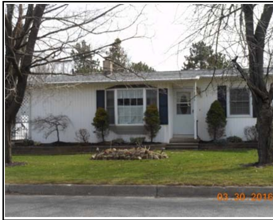
286 Bank St 180200 71.019-1-17

Neighborhood: 300 Property Class: 210 - 1 Family Res Sale Date: 9/24/2024 Sale Price: $ 140,000 Prelim 2025 Land Asmt: $ 9,500 Prelim 2025 Asmt: $ 122,000 Building Style: Ranch Exterior Wall: Stucco Year Built: 1947 Basement Type: Crawl Grade: Average Condition: Normal SFLA: 928 Sale Price/SFLA: $ 150.86 Number Bedrooms: 2 Number Baths: 1.0