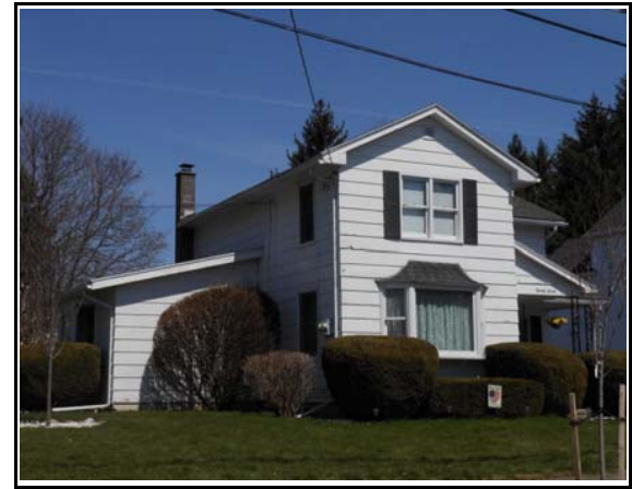
25-27 Cherry St 180200 84.066-1-29

Neighborhood: 500 Property Class: 220 - 2 Family Res Sale Date: 10/6/2023 Sale Price: $ 105,000 Prelim 2025 Land Asmt: $ 14,700 Prelim 2025 Asmt: $ 122,000 Building Style: Old Style Exterior Wall: Composition Year Built: 1890 Basement Type: Partial Grade: Average Condition: Poor SFLA: 2,112 Sale Price/SFLA: $ 49.72 Number Bedrooms: 4 Number Baths: 2.0