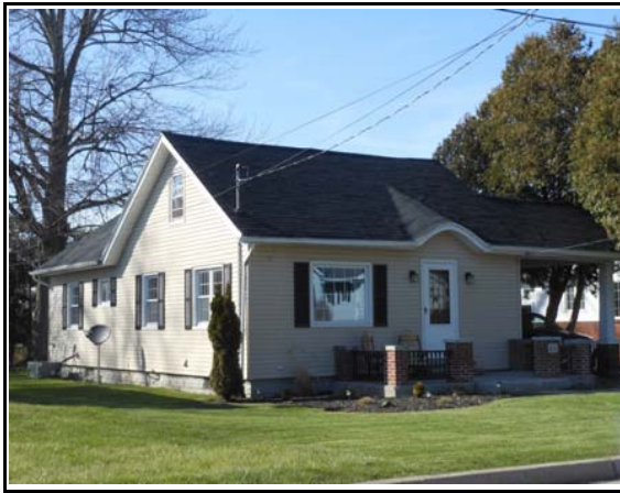
46 Roosevelt Ave 180200 84.009-2-32

Neighborhood: 500 Property Class: 210 - 1 Family Res Sale Date: 9/30/2024 Sale Price: $ 170,000 Prelim 2025 Land Asmt: $ 14,800 Prelim 2025 Asmt: $ 153,000 Building Style: Cape Cod Exterior Wall: Alum/vinyl Year Built: 1935 Basement Type: Full Grade: Average Condition: Normal SFLA: 1,214 Sale Price/SFLA: $ 140.03 Number Bedrooms: 1 Number Baths: 1.0