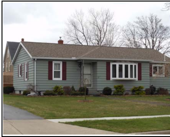
504 North St 180200 84.035-2-1

Neighborhood: 200 Property Class: 210 - 1 Family Res Sale Date: 4/2/2024 Sale Price: $ 205,000 Prelim 2025 Land Asmt: $ 20,200 Prelim 2025 Asmt: $ 184,000 Building Style: Ranch Exterior Wall: Alum/vinyl Year Built: 1954 Basement Type: Full Grade: Average Condition: Normal SFLA: 1,217 Sale Price/SFLA: $ 168.45 Number Bedrooms: 3 Number Baths: 2.0