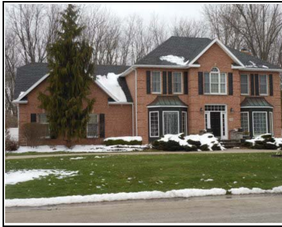
398 Garden Dr 180200 85.005-1-78

Neighborhood: 100 Property Class: 210 - 1 Family Res Sale Date: 7/11/2024 Sale Price: $ 331,500 Prelim 2025 Land Asmt: $ 33,500 Prelim 2025 Asmt: $ 356,000 Building Style: Colonial Exterior Wall: Alum/vinyl Year Built: 1968 Basement Type: Full Grade: Average Condition: Normal SFLA: 3,058 Sale Price/SFLA: $ 108.40 Number Bedrooms: 5 Number Baths: 3.0