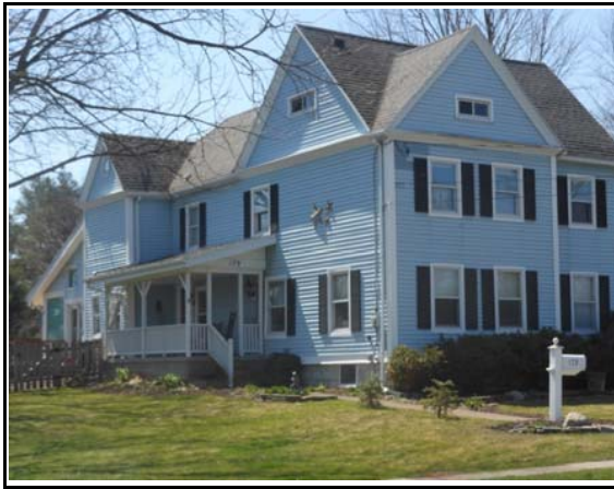
179 South Main St 180200 84.009-2-9

Neighborhood: 500 Property Class: 210 - 1 Family Res Sale Date: 8/15/2024 Sale Price: $ 258,400 Prelim 2025 Land Asmt: $ 18,200 Prelim 2025 Asmt: $ 223,000 Building Style: Old Style Exterior Wall: Alum/vinyl Year Built: 1874 Basement Type: Full Grade: Average Condition: Normal SFLA: 2,238 Sale Price/SFLA: $ 115.46 Number Bedrooms: 5 Number Baths: 2.0