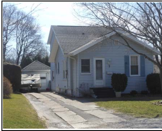
7 Genesee St 180200 84.006-2-27

Neighborhood: 200 Property Class: 210 - 1 Family Res Sale Date: 11/28/2023 Sale Price: $ 120,000 Prelim 2025 Land Asmt: $ 11,500 Prelim 2025 Asmt: $ 143,000 Building Style: Old Style Exterior Wall: Alum/vinyl Year Built: 1917 Basement Type: Full Grade: Average Condition: Fair SFLA: 1,520 Sale Price/SFLA: $ 78.95 Number Bedrooms: 4 Number Baths: 2.0