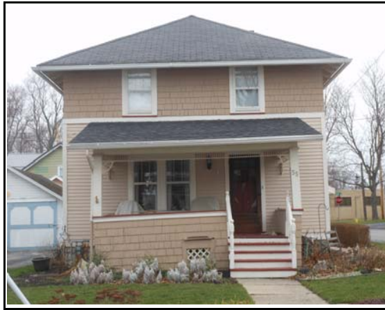
55 Kingsbury Ave 180200 84.023-1-14

Neighborhood: 200 Property Class: 210 - 1 Family Res Sale Date: 6/3/2024 Sale Price: $ 189,900 Prelim 2025 Land Asmt: $ 19,600 Prelim 2025 Asmt: $ 171,000 Building Style: Old Style Exterior Wall: Wood Year Built: 1915 Basement Type: Full Grade: Average Condition: Normal SFLA: 1,232 Sale Price/SFLA: $ 154.14 Number Bedrooms: 2 Number Baths: 1.0