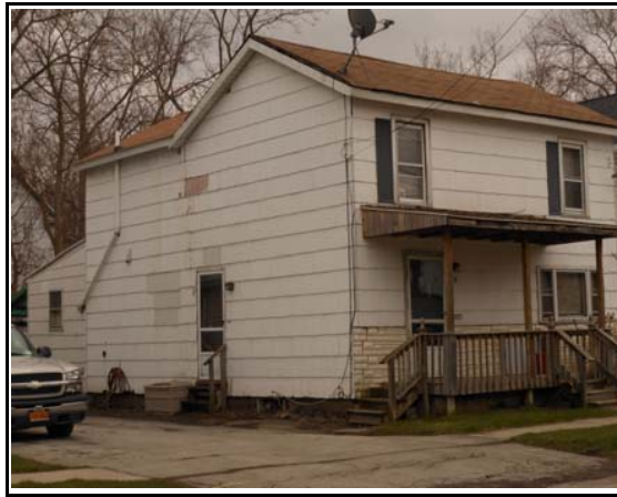
19 Harvester Ave 180200 84.059-2-50

Neighborhood: 600 Property Class: 210 - 1 Family Res Sale Date: 2/6/2024 Sale Price: $ 22,000 Prelim 2025 Land Asmt: $ 6,400 Prelim 2025 Asmt: $ 62,000 Building Style: Old Style Exterior Wall: Composition Year Built: 1900 Basement Type: Full Grade: Average Condition: Poor SFLA: 1,636 Sale Price/SFLA: $ 13.45 Number Bedrooms: 3 Number Baths: 1.0