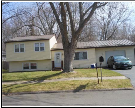
24 Gateway Dr 180200 71.014-2-11

Neighborhood: 200 Property Class: 210 - 1 Family Res Sale Date: 7/31/2023 Sale Price: $ 180,000 Prelim 2025 Land Asmt: $ 17,700 Prelim 2025 Asmt: $ 206,000 Building Style: Split Level Exterior Wall: Composition Year Built: 1970 Basement Type: Partial Grade: Average Condition: Normal SFLA: 1,280 Sale Price/SFLA: $ 140.63 Number Bedrooms: 3 Number Baths: 1.0