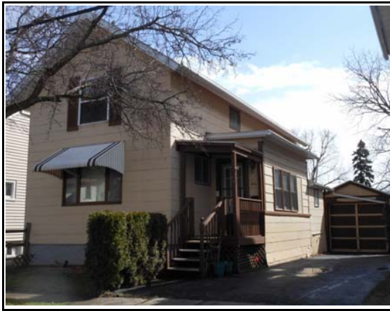
30 1/2 Columbia Ave 180200 84.043-1-29

Neighborhood: 300 Property Class: 210 - 1 Family Res Sale Date: 6/27/2024 Sale Price: $ 162,000 Prelim 2025 Land Asmt: $ 6,100 Prelim 2025 Asmt: $ 111,000 Building Style: Old Style Exterior Wall: Composition Year Built: 1880 Basement Type: Full Grade: Average Condition: Normal SFLA: 1,092 Sale Price/SFLA: $ 148.35 Number Bedrooms: 2 Number Baths: 1.0