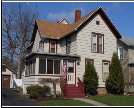
33 Tracy Ave 180200 84.034-1-68

Neighborhood: 300 Property Class: 210 - 1 Family Res Sale Date: 9/10/2024 Sale Price: $ 113,400 Prelim 2025 Land Asmt: $ 9,000 Prelim 2025 Asmt: $ 124,000 Building Style: Old Style Exterior Wall: Alum/vinyl Year Built: 1907 Basement Type: Full Grade: Average Condition: Normal SFLA: 1,688 Sale Price/SFLA: $ 67.18 Number Bedrooms: 4 Number Baths: 1.5