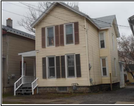
105 State St 180200 84.041-1-36

Neighborhood: 700 Property Class: 210 - 1 Family Res Sale Date: 5/6/2024 Sale Price: $ 60,000 Prelim 2025 Land Asmt: $ 7,300 Prelim 2025 Asmt: $ 72,000 Building Style: Old Style Exterior Wall: Alum/vinyl Year Built: 1900 Basement Type: Full Grade: Average Condition: Poor SFLA: 1,192 Sale Price/SFLA: $ 50.34 Number Bedrooms: 3 Number Baths: 1.0