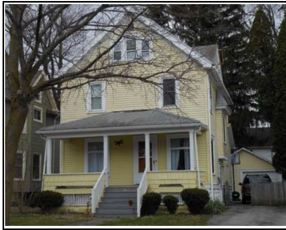
162 Ross St 180200 84.035-1-73

Neighborhood: 300 Property Class: 210 - 1 Family Res Sale Date: 7/2/2024 Sale Price: $ 86,100 Prelim 2025 Land Asmt: $ 9,500 Prelim 2025 Asmt: $ 136,000 Building Style: Old Style Exterior Wall: Wood Year Built: 1900 Basement Type: Full Grade: Average Condition: Poor SFLA: 1,547 Sale Price/SFLA: $ 55.66 Number Bedrooms: 4 Number Baths: 1.5