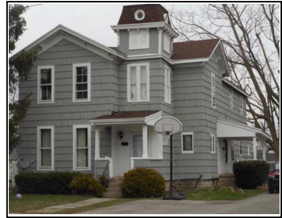
161 Jackson St 180200 84.073-1-45

Neighborhood: 500 Property Class: 220 - 2 Family Res Sale Date: 6/27/2023 Sale Price: $ 127,500 Prelim 2025 Land Asmt: $ 10,200 Prelim 2025 Asmt: $ 135,000 Building Style: Old Style Exterior Wall: Alum/vinyl Year Built: 1900 Basement Type: Full Grade: Average Condition: Normal SFLA: 2,576 Sale Price/SFLA: $ 49.50 Number Bedrooms: 6 Number Baths: 2.5