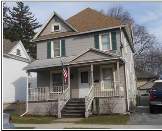
2 Lincoln Ave 180200 84.032-2-22

Neighborhood: 200 Property Class: 210 - 1 Family Res Sale Date: 1/9/2024 Sale Price: $ 194,920 Prelim 2025 Land Asmt: $ 13,900 Prelim 2025 Asmt: $ 211,000 Building Style: Old Style Exterior Wall: Wood Year Built: 1925 Basement Type: Full Grade: Average Condition: Normal SFLA: 1,327 Sale Price/SFLA: $ 146.89 Number Bedrooms: 3 Number Baths: 1.5