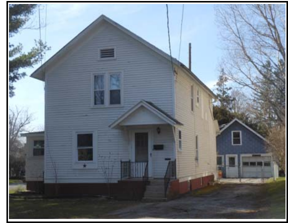
43 Prospect Ave 180200 84.024-1-14

Neighborhood: 200 Property Class: 220 - 2 Family Res Sale Date: 7/3/2024 Sale Price: $ 200,000 Prelim 2025 Land Asmt: $ 16,100 Prelim 2025 Asmt: $ 172,000 Building Style: Old Style Exterior Wall: Alum/vinyl Year Built: 1890 Basement Type: Full Grade: Average Condition: Normal SFLA: 2,002 Sale Price/SFLA: $ 99.90 Number Bedrooms: 3 Number Baths: 2.0