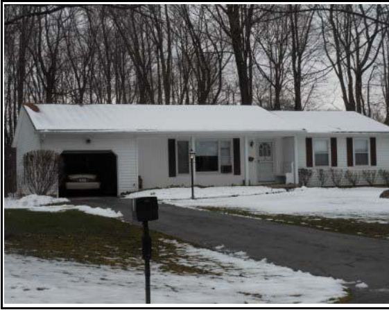
6 Belvedere Ln 180200 85.005-1-16

Neighborhood: 100 Property Class: 210 - 1 Family Res Sale Date: 7/2/2024 Sale Price: $ 205,010 Prelim 2025 Land Asmt: $ 34,100 Prelim 2025 Asmt: $ 195,000 Building Style: Ranch Exterior Wall: Wood Year Built: 1976 Basement Type: Full Grade: Average Condition: Normal SFLA: 1,421 Sale Price/SFLA: $ 144.27 Number Bedrooms: 3 Number Baths: 1.5