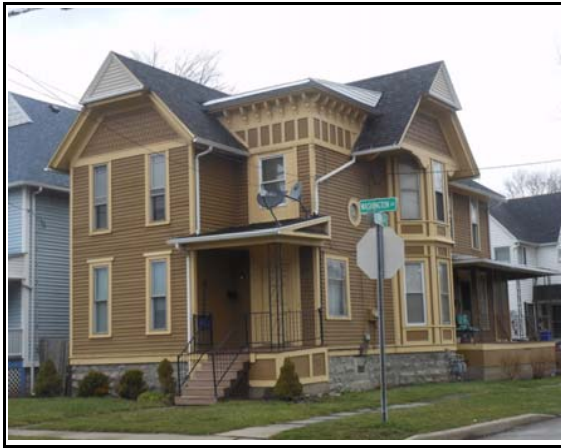
215 Washington Ave 180200 84.042-1-59

Neighborhood: 300 Property Class: 220 - 2 Family Res Sale Date: 9/7/2023 Sale Price: $ 90,000 Prelim 2025 Land Asmt: $ 8,300 Prelim 2025 Asmt: $ 116,000 Building Style: Old Style Exterior Wall: Wood Year Built: 1890 Basement Type: Full Grade: Average Condition: Poor SFLA: 1,986 Sale Price/SFLA: $ 45.32 Number Bedrooms: 5 Number Baths: 2.0