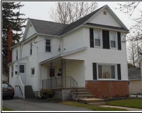
127 Hutchins St 180200 84.082-1-12.1

Neighborhood: 500 Property Class: 220 - 2 Family Res Sale Date: 12/20/2024 Sale Price: $ 172,000 Prelim 2025 Land Asmt: $ 12,600 Prelim 2025 Asmt: $ 161,500 Building Style: Old Style Exterior Wall: Alum/vinyl Year Built: 1880 Basement Type: Full Grade: Average Condition: Normal SFLA: 1,772 Sale Price/SFLA: $ 97.07 Number Bedrooms: 3 Number Baths: 2.0