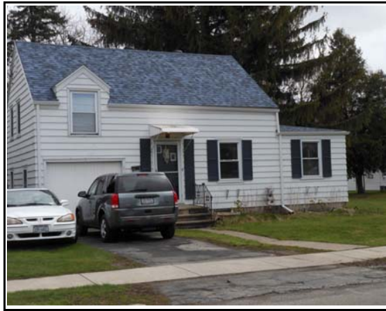
124 Vine St 180200 84.043-2-79

Neighborhood: 200 Property Class: 210 - 1 Family Res Sale Date: 10/10/2023 Sale Price: $ 195,000 Prelim 2025 Land Asmt: $ 26,700 Prelim 2025 Asmt: $ 229,000 Building Style: Split Level Exterior Wall: Wood Year Built: 1955 Basement Type: Full Grade: Average Condition: Normal SFLA: 1,987 Sale Price/SFLA: $ 98.14 Number Bedrooms: 3 Number Baths: 1.5