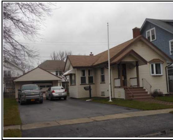
19-21 Kingsbury Ave 180200 84.023-1-31

Neighborhood: 200 Property Class: 210 - 1 Family Res Sale Date: 6/23/2023 Sale Price: $ 223,002 Prelim 2025 Land Asmt: $ 13,200 Prelim 2025 Asmt: $ 179,000 Building Style: Ranch Exterior Wall: Composition Year Built: 1974 Basement Type: Full Grade: Average Condition: Normal SFLA: 1,048 Sale Price/SFLA: $ 212.79 Number Bedrooms: 3 Number Baths: 1.0