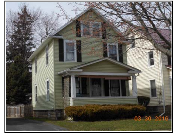
229 Bank St 180200 84.026-1-75

Neighborhood: 300 Property Class: 210 - 1 Family Res Sale Date: 9/30/2024 Sale Price: $ 139,900 Prelim 2025 Land Asmt: $ 9,500 Prelim 2025 Asmt: $ 135,000 Building Style: Old Style Exterior Wall: Alum/vinyl Year Built: 1902 Basement Type: Full Grade: Average Condition: Normal SFLA: 1,107 Sale Price/SFLA: $ 126.38 Number Bedrooms: 3 Number Baths: 1.0