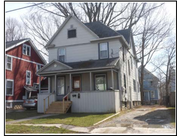
32 Lyon St 180200 84.031-2-36

Neighborhood: 300 Property Class: 220 - 2 Family Res Sale Date: 11/2/2023 Sale Price: $ 86,000 Prelim 2025 Land Asmt: $ 10,200 Prelim 2025 Asmt: $ 94,000 Building Style: Old Style Exterior Wall: Alum/vinyl Year Built: 1890 Basement Type: Full Grade: Average Condition: Poor SFLA: 1,666 Sale Price/SFLA: $ 51.62 Number Bedrooms: 4 Number Baths: 2.0