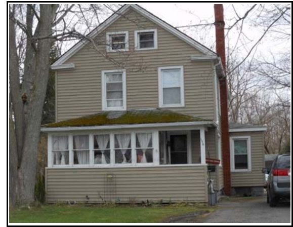
156 Vine St 180200 84.008-1-33

Neighborhood: 200 Property Class: 210 - 1 Family Res Sale Date: 4/24/2023 Sale Price: $ 189,900 Prelim 2025 Land Asmt: $ 15,300 Prelim 2025 Asmt: $ 213,000 Building Style: Old Style Exterior Wall: Alum/vinyl Year Built: 1900 Basement Type: Partial Grade: Average Condition: Normal SFLA: 1,968 Sale Price/SFLA: $ 96.49 Number Bedrooms: 3 Number Baths: 1.0