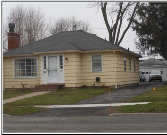
43 Redfield Pkwy 180200 71.017-2-47

Neighborhood: 400 Property Class: 210 - 1 Family Res Sale Date: 2/20/2024 Sale Price: $ 207,000 Prelim 2025 Land Asmt: $ 17,600 Prelim 2025 Asmt: $ 171,400 Building Style: Ranch Exterior Wall: Alum/vinyl Year Built: 1965 Basement Type: Full Grade: Average Condition: Good SFLA: 1,088 Sale Price/SFLA: $ 190.26 Number Bedrooms: 2 Number Baths: 1.0