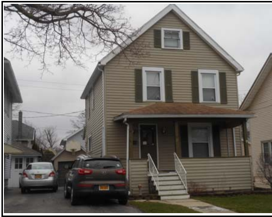
38 Union St 180200 84.023-1-45

Neighborhood: 300 Property Class: 210 - 1 Family Res Sale Date: 3/22/2024 Sale Price: $ 120,000 Prelim 2025 Land Asmt: $ 9,000 Prelim 2025 Asmt: $ 135,000 Building Style: Old Style Exterior Wall: Alum/vinyl Year Built: 1925 Basement Type: Full Grade: Average Condition: Normal SFLA: 1,194 Sale Price/SFLA: $ 100.50 Number Bedrooms: 3 Number Baths: 1.0