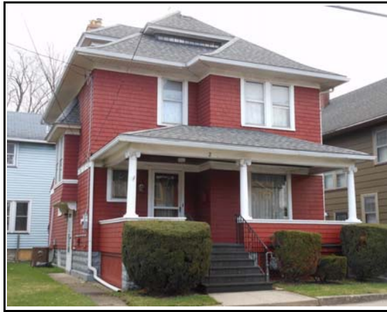
2 Tracy Ave 180200 84.042-1-33

Neighborhood: 300 Property Class: 210 - 1 Family Res Sale Date: 1/23/2023 Sale Price: $ 70,000 Prelim 2025 Land Asmt: $ 10,200 Prelim 2025 Asmt: $ 91,000 Building Style: Old Style Exterior Wall: Alum/vinyl Year Built: 1880 Basement Type: Partial Grade: Average Condition: Poor SFLA: 1,414 Sale Price/SFLA: $ 49.50 Number Bedrooms: 3 Number Baths: 1.0