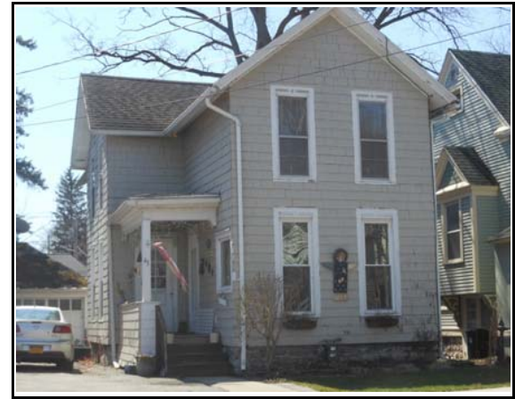
43 South Main St 180200 84.047-2-15

Neighborhood: 500 Property Class: 220 - 2 Family Res Sale Date: 10/29/2024 Sale Price: $ 110,000 Prelim 2025 Land Asmt: $ 8,300 Prelim 2025 Asmt: $ 78,000 Building Style: Old Style Exterior Wall: Wood Year Built: 1900 Basement Type: Full Grade: Average Condition: Normal SFLA: 1,521 Sale Price/SFLA: $ 72.32 Number Bedrooms: 5 Number Baths: 2.0