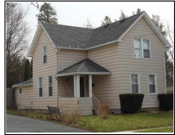
129 Hutchins St 180200 84.082-1-28

Neighborhood: 500 Property Class: 210 - 1 Family Res Sale Date: 9/30/2024 Sale Price: $ 160,000 Prelim 2025 Land Asmt: $ 13,200 Prelim 2025 Asmt: $ 150,000 Building Style: Old Style Exterior Wall: Alum/vinyl Year Built: 1900 Basement Type: Full Grade: Average Condition: Normal SFLA: 1,272 Sale Price/SFLA: $ 125.79 Number Bedrooms: 4 Number Baths: 1.0