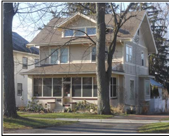
3 Richmond Ave 180200 84.006-4-4

Neighborhood: 300 Property Class: 210 - 1 Family Res Sale Date: 5/14/2024 Sale Price: $ 157,500 Prelim 2025 Land Asmt: $ 11,000 Prelim 2025 Asmt: $ 151,000 Building Style: Old Style Exterior Wall: Alum/vinyl Year Built: 1890 Basement Type: Full Grade: Average Condition: Normal SFLA: 1,596 Sale Price/SFLA: $ 98.68 Number Bedrooms: 3 Number Baths: 1.5