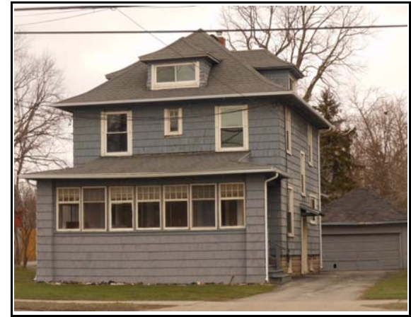
344 West Main St 180200 84.005-2-20

Neighborhood: 300 Property Class: 210 - 1 Family Res Sale Date: 3/31/2023 Sale Price: $ 130,000 Prelim 2025 Land Asmt: $ 7,100 Prelim 2025 Asmt: $ 150,000 Building Style: Old Style Exterior Wall: Wood Year Built: 1915 Basement Type: Full Grade: Average Condition: Normal SFLA: 1,416 Sale Price/SFLA: $ 91.81 Number Bedrooms: 3 Number Baths: 1.0