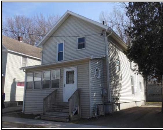
7 Watson St 180200 84.065-1-8

Neighborhood: 500 Property Class: 220 - 2 Family Res Sale Date: 1/29/2024 Sale Price: $ 75,000 Prelim 2025 Land Asmt: $ 15,800 Prelim 2025 Asmt: $ 79,000 Building Style: Old Style Exterior Wall: Alum/vinyl Year Built: 1900 Basement Type: Full Grade: Average Condition: Poor SFLA: 1,600 Sale Price/SFLA: $ 46.88 Number Bedrooms: 4 Number Baths: 2.0