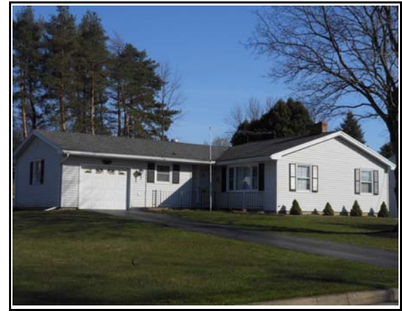
43-45 Roosevelt Ave 180200 84.009-4-23

Neighborhood: 500 Property Class: 210 - 1 Family Res Sale Date: 8/14/2023 Sale Price: $ 125,000 Prelim 2025 Land Asmt: $ 10,800 Prelim 2025 Asmt: $ 153,000 Building Style: Ranch Exterior Wall: Composition Year Built: 1950 Basement Type: Full Grade: Average Condition: Fair SFLA: 1,272 Sale Price/SFLA: $ 98.27 Number Bedrooms: 3 Number Baths: 1.0