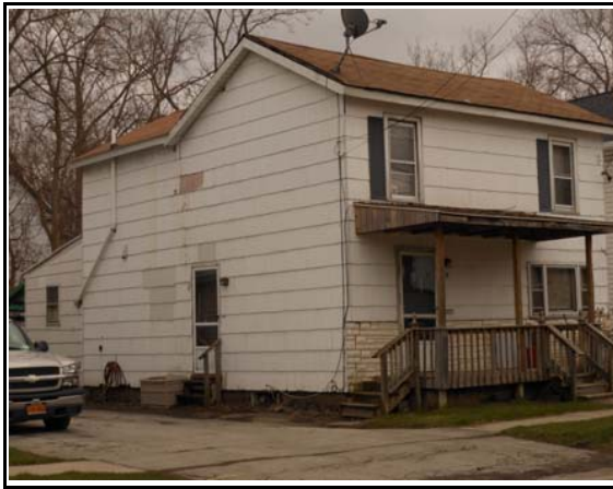
19 Harvester Ave 180200 84.059-2-50

Neighborhood: 600 Property Class: 210 - 1 Family Res Sale Date: 2/6/2024 Sale Price: $ 22,000 Prelim 2025 Land Asmt: $ 6,400 Prelim 2025 Asmt: $ 62,000 Building Style: Old Style Exterior Wall: Composition Year Built: 1900 Basement Type: Full Grade: Average Condition: Poor SFLA: 1,636 Sale Price/SFLA: $ 13.45 Number Bedrooms: 3 Number Baths: 1.0