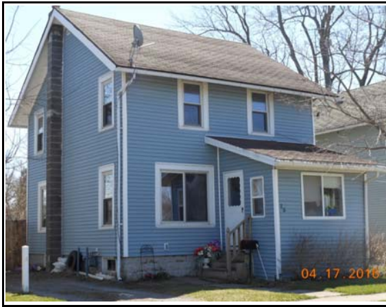
15 South Lyon St 180200 84.039-1-20

Neighborhood: 500 Property Class: 210 - 1 Family Res Sale Date: 7/24/2023 Sale Price: $ 119,000 Prelim 2025 Land Asmt: $ 8,500 Prelim 2025 Asmt: $ 125,000 Building Style: Old Style Exterior Wall: Alum/vinyl Year Built: 1920 Basement Type: Full Grade: Average Condition: Normal SFLA: 1,144 Sale Price/SFLA: $ 104.02 Number Bedrooms: 3 Number Baths: 1.0