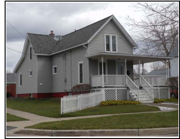
211 North St 180200 84.034-3-63

Neighborhood: 300 Property Class: 210 - 1 Family Res Sale Date: 1/25/2024 Sale Price: $ 75,000 Prelim 2025 Land Asmt: $ 9,800 Prelim 2025 Asmt: $ 102,000 Building Style: Old Style Exterior Wall: Alum/vinyl Year Built: 1875 Basement Type: Full Grade: Average Condition: Poor SFLA: 1,032 Sale Price/SFLA: $ 72.67 Number Bedrooms: 2 Number Baths: 1.0