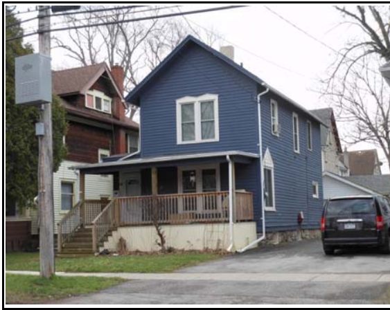
108 North St 180200 84.034-1-5

Neighborhood: 300 Property Class: 210 - 1 Family Res Sale Date: 5/26/2023 Sale Price: $ 150,000 Prelim 2025 Land Asmt: $ 8,600 Prelim 2025 Asmt: $ 168,000 Building Style: Old Style Exterior Wall: Alum/vinyl Year Built: 1900 Basement Type: Full Grade: Average Condition: Normal SFLA: 1,362 Sale Price/SFLA: $ 110.13 Number Bedrooms: 4 Number Baths: 1.0