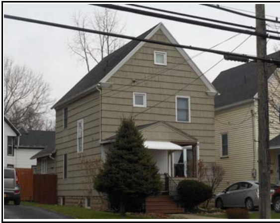
135 Jackson St 180200 84.065-2-49

Neighborhood: 500 Property Class: 210 - 1 Family Res Sale Date: 4/11/2023 Sale Price: $ 91,500 Prelim 2025 Land Asmt: $ 7,800 Prelim 2025 Asmt: $ 101,000 Building Style: Old Style Exterior Wall: Composition Year Built: 1900 Basement Type: Partial Grade: Average Condition: Fair SFLA: 1,320 Sale Price/SFLA: $ 69.32 Number Bedrooms: 3 Number Baths: 1.5