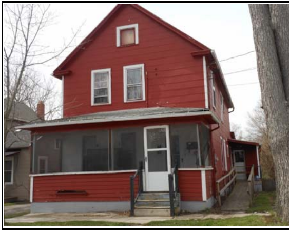
18 Hutchins St 180200 84.066-2-55

Neighborhood: 500 Property Class: 220 - 2 Family Res Sale Date: 7/24/2024 Sale Price: $ 100,000 Prelim 2025 Land Asmt: $ 10,100 Prelim 2025 Asmt: $ 112,000 Building Style: Old Style Exterior Wall: Composition Year Built: 1880 Basement Type: Full Grade: Average Condition: Fair SFLA: 1,692 Sale Price/SFLA: $ 59.10 Number Bedrooms: 4 Number Baths: 2.0