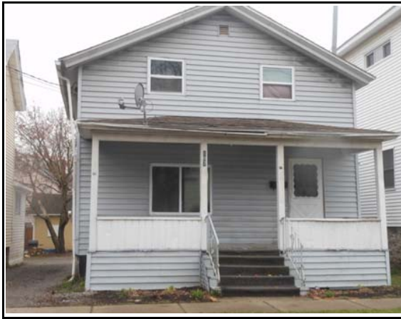
107 State St 180200 84.041-1-35

Neighborhood: 700 Property Class: 210 - 1 Family Res Sale Date: 9/29/2023 Sale Price: $ 51,000 Prelim 2025 Land Asmt: $ 8,300 Prelim 2025 Asmt: $ 58,000 Building Style: Old Style Exterior Wall: Alum/vinyl Year Built: 1880 Basement Type: Full Grade: Economy Condition: Poor SFLA: 1,512 Sale Price/SFLA: $ 33.73 Number Bedrooms: 5 Number Baths: 2.0