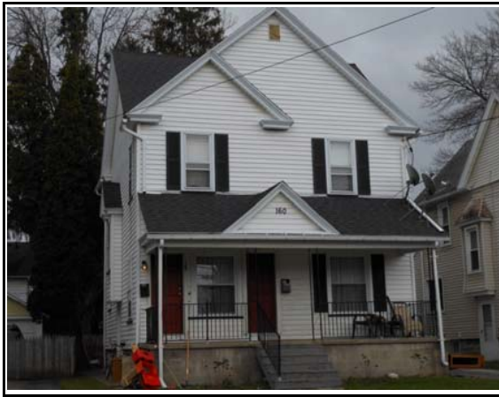
160 Ross St 180200 84.035-1-72

Neighborhood: 300 Property Class: 220 - 2 Family Res Sale Date: 3/15/2023 Sale Price: $ 97,000 Prelim 2025 Land Asmt: $ 9,500 Prelim 2025 Asmt: $ 109,000 Building Style: Old Style Exterior Wall: Alum/vinyl Year Built: 1900 Basement Type: Full Grade: Average Condition: Fair SFLA: 1,646 Sale Price/SFLA: $ 58.93 Number Bedrooms: 4 Number Baths: 2.0