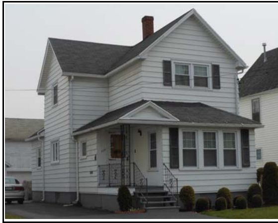
117 Hutchins St 180200 84.082-1-31

Neighborhood: 500 Property Class: 210 - 1 Family Res Sale Date: 4/24/2023 Sale Price: $ 120,000 Prelim 2025 Land Asmt: $ 11,700 Prelim 2025 Asmt: $ 128,000 Building Style: Old Style Exterior Wall: Alum/vinyl Year Built: 1880 Basement Type: Full Grade: Average Condition: Normal SFLA: 1,441 Sale Price/SFLA: $ 83.28 Number Bedrooms: 3 Number Baths: 1.0