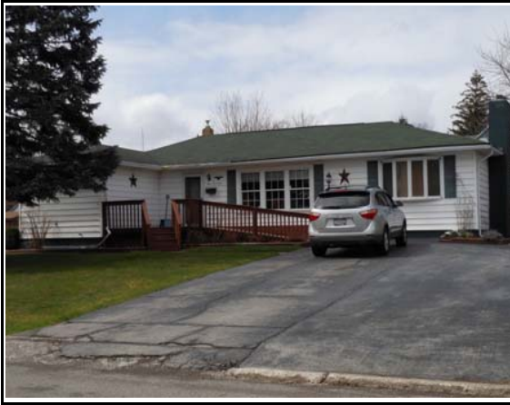
117 Vine St 180200 84.043-1-11

Neighborhood: 200 Property Class: 210 - 1 Family Res Sale Date: 9/23/2024 Sale Price: $ 160,000 Prelim 2025 Land Asmt: $ 19,400 Prelim 2025 Asmt: $ 183,000 Building Style: Ranch Exterior Wall: Alum/vinyl Year Built: 1964 Basement Type: Full Grade: Average Condition: Normal SFLA: 1,416 Sale Price/SFLA: $ 112.99 Number Bedrooms: 3 Number Baths: 1.0