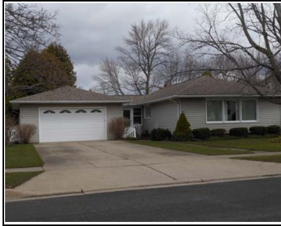
509 North St 180200 84.008-2-31

Neighborhood: 200 Property Class: 210 - 1 Family Res Sale Date: 9/23/2024 Sale Price: $ 160,000 Prelim 2025 Land Asmt: $ 19,400 Prelim 2025 Asmt: $ 183,000 Building Style: Ranch Exterior Wall: Alum/vinyl Year Built: 1964 Basement Type: Full Grade: Average Condition: Normal SFLA: 1,416 Sale Price/SFLA: $ 112.99 Number Bedrooms: 3 Number Baths: 1.0