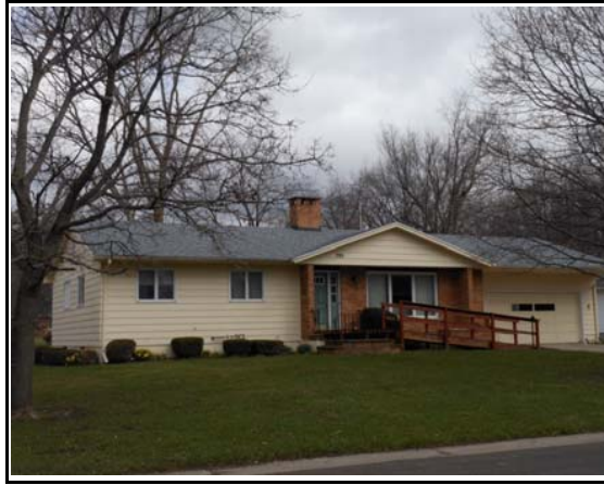
705 North St 180200 85.005-1-8

Neighborhood: 100 Property Class: 210 - 1 Family Res Sale Date: 7/2/2024 Sale Price: $ 205,010 Prelim 2025 Land Asmt: $ 34,100 Prelim 2025 Asmt: $ 195,000 Building Style: Ranch Exterior Wall: Wood Year Built: 1976 Basement Type: Full Grade: Average Condition: Normal SFLA: 1,421 Sale Price/SFLA: $ 144.27 Number Bedrooms: 3 Number Baths: 1.5