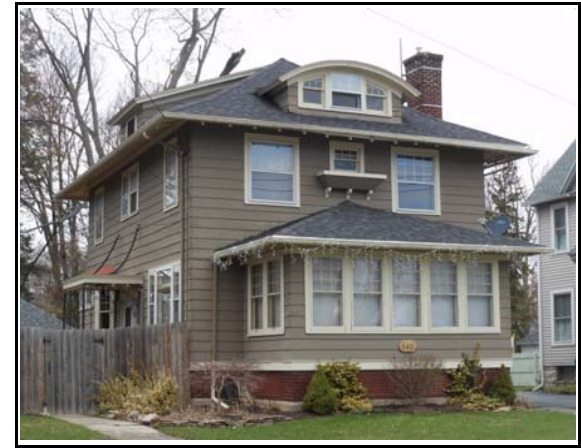
103 Ross St 180200 84.042-2-21

Neighborhood: 300 Property Class: 220 - 2 Family Res Sale Date: 1/6/2023 Sale Price: $ 73,500 Prelim 2025 Land Asmt: $ 11,000 Prelim 2025 Asmt: $ 89,000 Building Style: Old Style Exterior Wall: Alum/vinyl Year Built: 1910 Basement Type: Full Grade: Average Condition: Poor SFLA: 2,184 Sale Price/SFLA: $ 33.65 Number Bedrooms: 6 Number Baths: 2.0