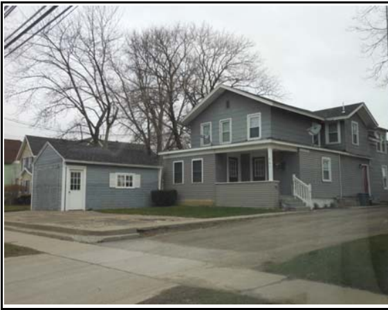
661 East Main St 180200 85.013-1-22

Neighborhood: 600 Property Class: 230 - 3 Family Res Sale Date: 4/9/2024 Sale Price: $ 205,000 Prelim 2025 Land Asmt: $ 14,800 Prelim 2025 Asmt: $ 120,000 Building Style: Old Style Exterior Wall: Wood Year Built: 1900 Basement Type: Full Grade: Average Condition: Fair SFLA: 2,282 Sale Price/SFLA: $ 89.83 Number Bedrooms: 3 Number Baths: 3.0