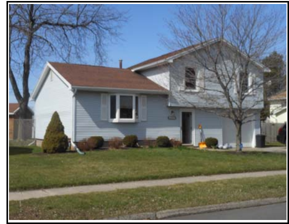
25 Gateway Dr 180200 71.014-2-17

Neighborhood: 200 Property Class: 210 - 1 Family Res Sale Date: 2/22/2023 Sale Price: $ 175,000 Prelim 2025 Land Asmt: $ 17,700 Prelim 2025 Asmt: $ 193,000 Building Style: Split Level Exterior Wall: Alum/vinyl Year Built: 1971 Basement Type: Partial Grade: Average Condition: Normal SFLA: 1,391 Sale Price/SFLA: $ 125.81 Number Bedrooms: 3 Number Baths: 1.0