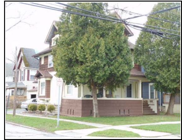
110 North St 180200 84.034-1-6

Neighborhood: 300 Property Class: 210 - 1 Family Res Sale Date: 11/12/2024 Sale Price: $ 155,000 Prelim 2025 Land Asmt: $ 10,900 Prelim 2025 Asmt: $ 151,000 Building Style: Old Style Exterior Wall: Alum/vinyl Year Built: 1900 Basement Type: Full Grade: Average Condition: Normal SFLA: 1,482 Sale Price/SFLA: $ 104.59 Number Bedrooms: 2 Number Baths: 1.5