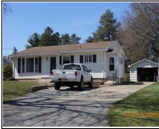
12 Dewey Ave 180200 84.009-2-16

Neighborhood: 500 Property Class: 210 - 1 Family Res Sale Date: 9/27/2023 Sale Price: $ 165,000 Prelim 2025 Land Asmt: $ 17,300 Prelim 2025 Asmt: $ 177,000 Building Style: Ranch Exterior Wall: Alum/vinyl Year Built: 1988 Basement Type: Full Grade: Average Condition: Normal SFLA: 960 Sale Price/SFLA: $ 171.88 Number Bedrooms: 3 Number Baths: 1.0