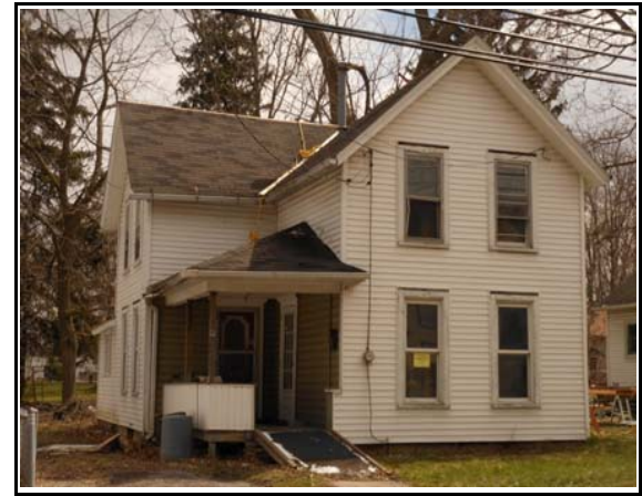
9 Cedar St 180200 85.013-1-69

Neighborhood: 600 Property Class: 210 - 1 Family Res Sale Date: 3/28/2024 Sale Price: $ 70,000 Prelim 2025 Land Asmt: $ 15,800 Prelim 2025 Asmt: $ 95,000 Building Style: Old Style Exterior Wall: Alum/vinyl Year Built: 1850 Basement Type: Full Grade: Average Condition: Normal SFLA: 1,023 Sale Price/SFLA: $ 68.43 Number Bedrooms: 3 Number Baths: 1.0