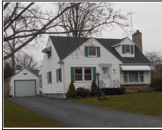
59 Bogue Ave 180200 71.017-2-17

Neighborhood: 400 Property Class: 210 - 1 Family Res Sale Date: 11/14/2023 Sale Price: $ 199,900 Prelim 2025 Land Asmt: $ 30,500 Prelim 2025 Asmt: $ 217,000 Building Style: Ranch Exterior Wall: Concrete Year Built: 1947 Basement Type: Slab/pier Grade: Average Condition: Normal SFLA: 1,892 Sale Price/SFLA: $ 105.66 Number Bedrooms: 3 Number Baths: 1.0