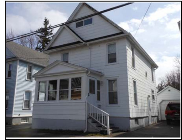
58 Columbia Ave 180200 84.035-1-29

Neighborhood: 300 Property Class: 210 - 1 Family Res Sale Date: 7/10/2023 Sale Price: $ 80,000 Prelim 2025 Land Asmt: $ 6,100 Prelim 2025 Asmt: $ 95,000 Building Style: Old Style Exterior Wall: Wood Year Built: 1900 Basement Type: Full Grade: Average Condition: Fair SFLA: 1,180 Sale Price/SFLA: $ 67.80 Number Bedrooms: 3 Number Baths: 1.0