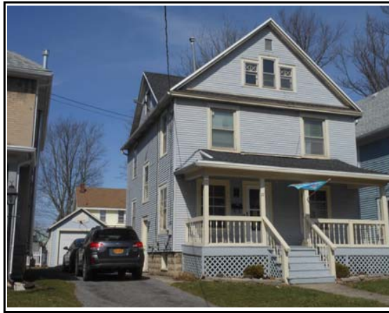
27 Montclair Ave 180200 84.031-2-9

Neighborhood: 300 Property Class: 210 - 1 Family Res Sale Date: 7/17/2023 Sale Price: $ 157,850 Prelim 2025 Land Asmt: $ 12,100 Prelim 2025 Asmt: $ 170,000 Building Style: Old Style Exterior Wall: Alum/vinyl Year Built: 1900 Basement Type: Full Grade: Average Condition: Normal SFLA: 1,344 Sale Price/SFLA: $ 117.45 Number Bedrooms: 3 Number Baths: 1.0