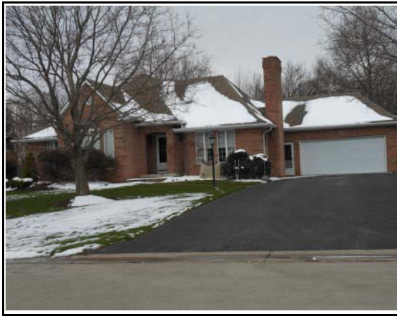
418 Garden Dr 180200 85.005-2-2

Neighborhood: 100 Property Class: 210 - 1 Family Res Sale Date: 10/16/2023 Sale Price: $ 385,900 Prelim 2025 Land Asmt: $ 31,600 Prelim 2025 Asmt: $ 415,000 Building Style: Ranch Exterior Wall: Brick Year Built: 1988 Basement Type: Full Grade: Good Condition: Good SFLA: 2,094 Sale Price/SFLA: $ 184.29 Number Bedrooms: 3 Number Baths: 2.0