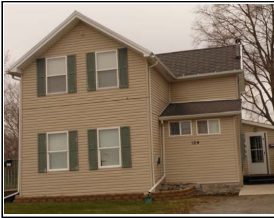
104 Clifton Ave 180200 97.007-1-19

Neighborhood: 500 Property Class: 230 - 3 Family Res Sale Date: 4/17/2024 Sale Price: $ 182,000 Prelim 2025 Land Asmt: $ 13,000 Prelim 2025 Asmt: $ 169,000 Building Style: Old Style Exterior Wall: Alum/vinyl Year Built: 1925 Basement Type: Partial Grade: Average Condition: Normal SFLA: 1,711 Sale Price/SFLA: $ 106.37 Number Bedrooms: 5 Number Baths: 3.0