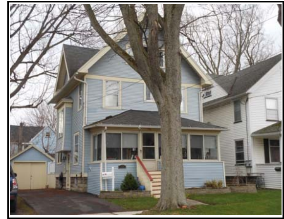
170 Ross St 180200 84.035-1-77

Neighborhood: 300 Property Class: 210 - 1 Family Res Sale Date: 4/5/2023 Sale Price: $ 105,000 Prelim 2025 Land Asmt: $ 14,000 Prelim 2025 Asmt: $ 119,000 Building Style: Old Style Exterior Wall: Alum/vinyl Year Built: 1900 Basement Type: Full Grade: Average Condition: Normal SFLA: 1,458 Sale Price/SFLA: $ 72.02 Number Bedrooms: 3 Number Baths: 1.5