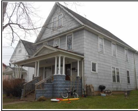
132 Liberty St 180200 84.066-1-19

Neighborhood: 500 Property Class: 220 - 2 Family Res Sale Date: 1/12/2023 Sale Price: $ 85,000 Prelim 2025 Land Asmt: $ 12,200 Prelim 2025 Asmt: $ 93,000 Building Style: Old Style Exterior Wall: Alum/vinyl Year Built: 1900 Basement Type: Full Grade: Average Condition: Poor SFLA: 2,090 Sale Price/SFLA: $ 40.67 Number Bedrooms: 3 Number Baths: 2.0