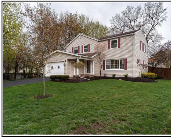
15 Bogue Ave 180200 84.005-1-45

Neighborhood: 400 Property Class: 210 - 1 Family Res Sale Date: 8/11/2023 Sale Price: $ 220,000 Prelim 2025 Land Asmt: $ 29,000 Prelim 2025 Asmt: $ 242,000 Building Style: Colonial Exterior Wall: Alum/vinyl Year Built: 1930 Basement Type: Full Grade: Good Condition: Normal SFLA: 1,752 Sale Price/SFLA: $ 125.57 Number Bedrooms: 4 Number Baths: 1.0