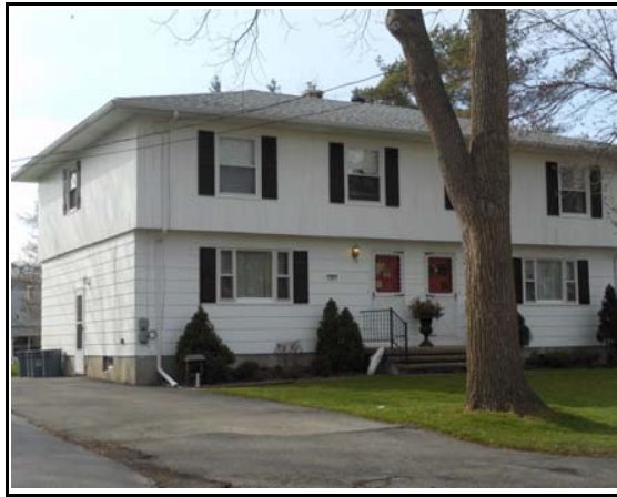
6-8 Jackson Ave 180200 84.019-2-34

Neighborhood: 500 Property Class: 220 - 2 Family Res Sale Date: 6/26/2023 Sale Price: $ 118,500 Prelim 2025 Land Asmt: $ 17,000 Prelim 2025 Asmt: $ 144,000 Building Style: Old Style Exterior Wall: Composition Year Built: 1900 Basement Type: Full Grade: Average Condition: Normal SFLA: 2,936 Sale Price/SFLA: $ 40.36 Number Bedrooms: 5 Number Baths: 2.0