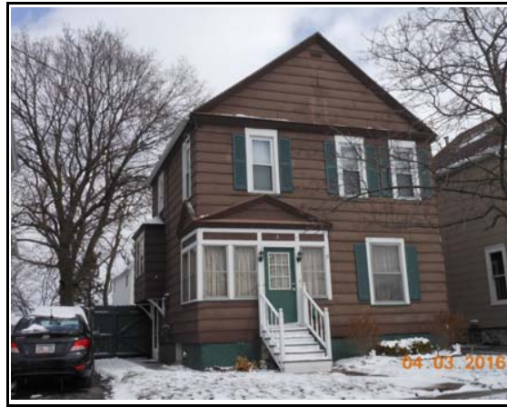
5 Margaret Pl 180200 84.051-2-30

Neighborhood: 700 Property Class: 210 - 1 Family Res Sale Date: 2/26/2024 Sale Price: $ 145,000 Prelim 2025 Land Asmt: $ 14,000 Prelim 2025 Asmt: $ 161,000 Building Style: Old Style Exterior Wall: Alum/vinyl Year Built: 1900 Basement Type: Crawl Grade: Average Condition: Good SFLA: 1,308 Sale Price/SFLA: $ 110.86 Number Bedrooms: 3 Number Baths: 1.0