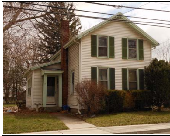
11 Cedar St 180200 85.013-1-68

Neighborhood: 600 Property Class: 210 - 1 Family Res Sale Date: 9/30/2024 Sale Price: $ 147,500 Prelim 2025 Land Asmt: $ 12,700 Prelim 2025 Asmt: $ 119,000 Building Style: Old Style Exterior Wall: Alum/vinyl Year Built: 1930 Basement Type: Full Grade: Average Condition: Normal SFLA: 865 Sale Price/SFLA: $ 170.52 Number Bedrooms: 2 Number Baths: 1.0