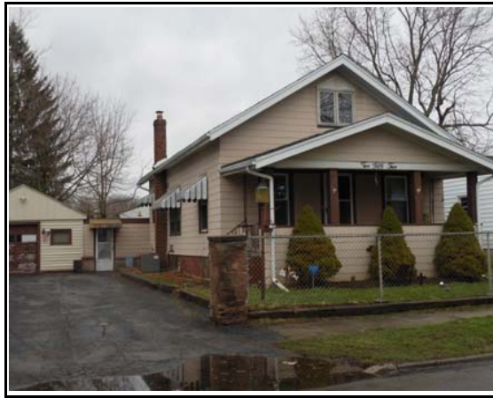
252 Swan St 180200 84.019-3-37

Neighborhood: 500 Property Class: 210 - 1 Family Res Sale Date: 1/12/2024 Sale Price: $ 169,000 Prelim 2025 Land Asmt: $ 17,000 Prelim 2025 Asmt: $ 163,000 Building Style: Old Style Exterior Wall: Alum/vinyl Year Built: 1890 Basement Type: Full Grade: Average Condition: Normal SFLA: 1,204 Sale Price/SFLA: $ 140.37 Number Bedrooms: 2 Number Baths: 1.5