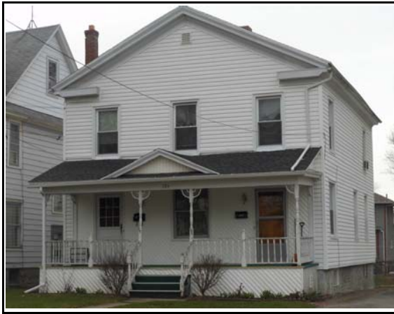
124 Jackson St 180200 84.065-1-41

Neighborhood: 500 Property Class: 220 - 2 Family Res Sale Date: 6/26/2023 Sale Price: $ 118,500 Prelim 2025 Land Asmt: $ 17,000 Prelim 2025 Asmt: $ 144,000 Building Style: Old Style Exterior Wall: Composition Year Built: 1900 Basement Type: Full Grade: Average Condition: Normal SFLA: 2,936 Sale Price/SFLA: $ 40.36 Number Bedrooms: 5 Number Baths: 2.0