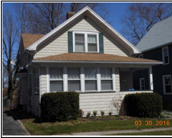
17 Hart St 180200 71.082-1-32

Neighborhood: 200 Property Class: 210 - 1 Family Res Sale Date: 9/20/2024 Sale Price: $ 180,000 Prelim 2025 Land Asmt: $ 15,600 Prelim 2025 Asmt: $ 174,000 Building Style: Old Style Exterior Wall: Wood Year Built: 1928 Basement Type: Full Grade: Average Condition: Normal SFLA: 1,320 Sale Price/SFLA: $ 136.36 Number Bedrooms: 3 Number Baths: 1.5