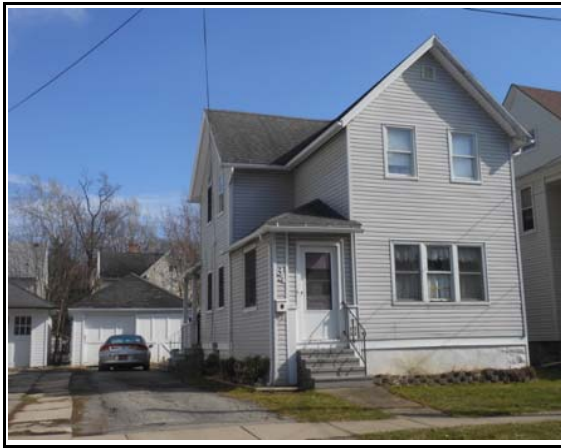
34 Dellinger Ave 180200 84.040-2-47

Neighborhood: 300 Property Class: 210 - 1 Family Res Sale Date: 2/2/2024 Sale Price: $ 65,000 Prelim 2025 Land Asmt: $ 10,300 Prelim 2025 Asmt: $ 70,000 Building Style: Old Style Exterior Wall: Alum/vinyl Year Built: 1900 Basement Type: Full Grade: Average Condition: Poor SFLA: 1,400 Sale Price/SFLA: $ 46.43 Number Bedrooms: 4 Number Baths: 1.5